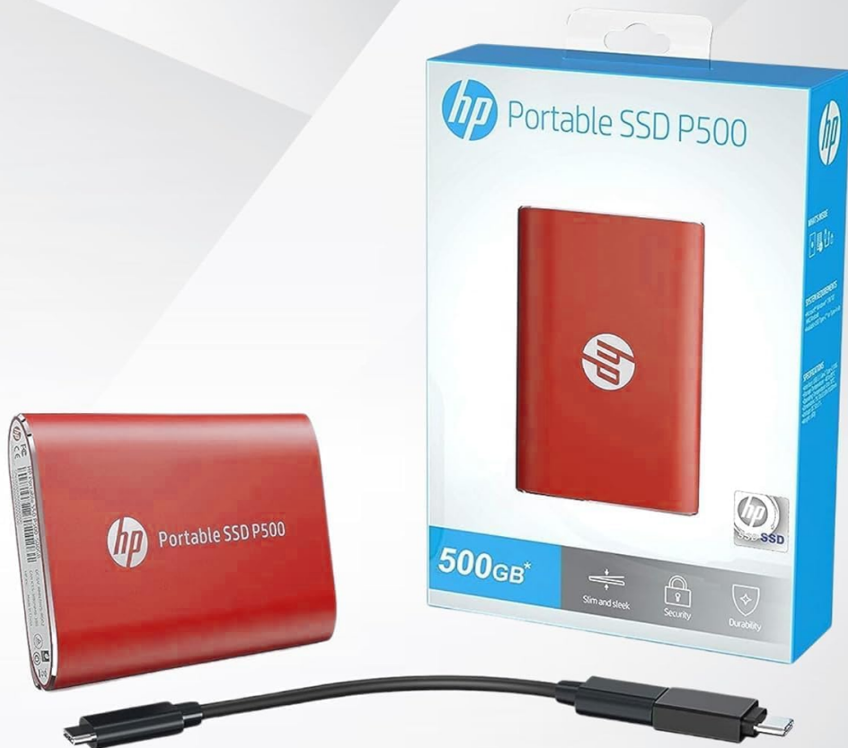
Image 2: HP P500 500GB Portable SSD and USB-C cable, included with the laptop.