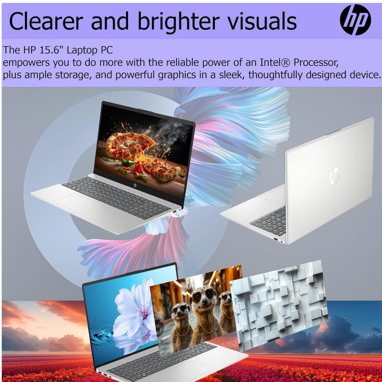
Image 3: The HP Pavilion laptop's display showcasing clear and bright visuals.

The laptop features a 15.6-inch Full HD (1920 x 1080) display, providing clear and vibrant visuals for various tasks, from streaming content to working on documents. The anti-glare coating helps reduce reflections.