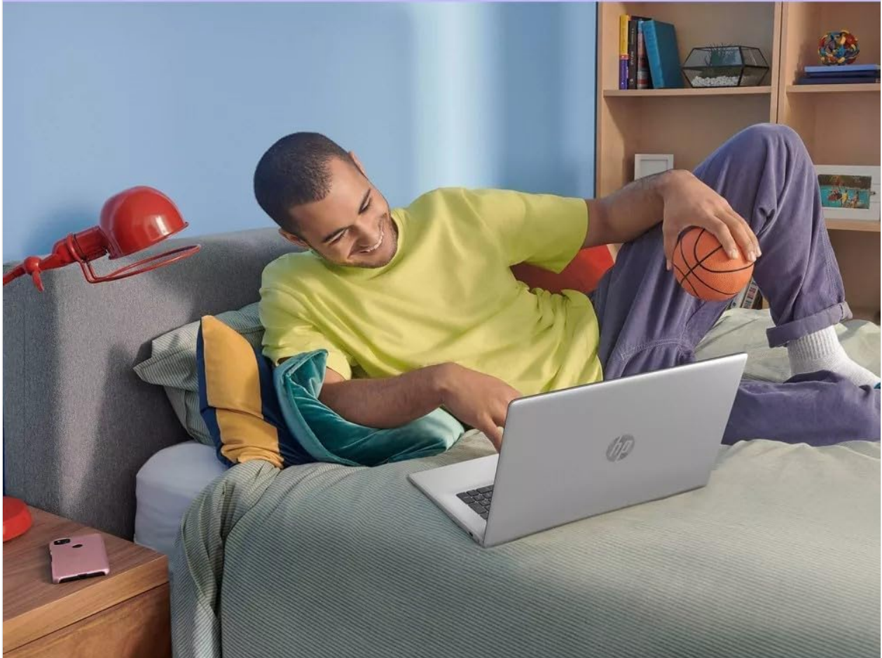
Image 6: User enjoying extended use of the HP Pavilion laptop, highlighting its battery performance.

Take on the day without worrying about recharging. HP Fast Charge goes from 0 to 50% charge in approximately 45 minutes.