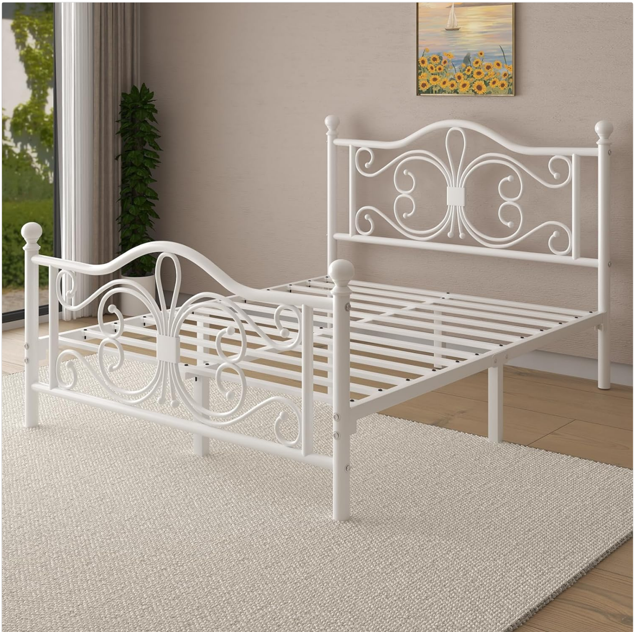
Image: Components of the bed frame, including headboard, footboard, side rails, and slats, ready for assembly.

Connect the side rails to the headboard and footboard using the provided bolts and the Allen wrench. Ensure all connections are finger-tight at this stage.