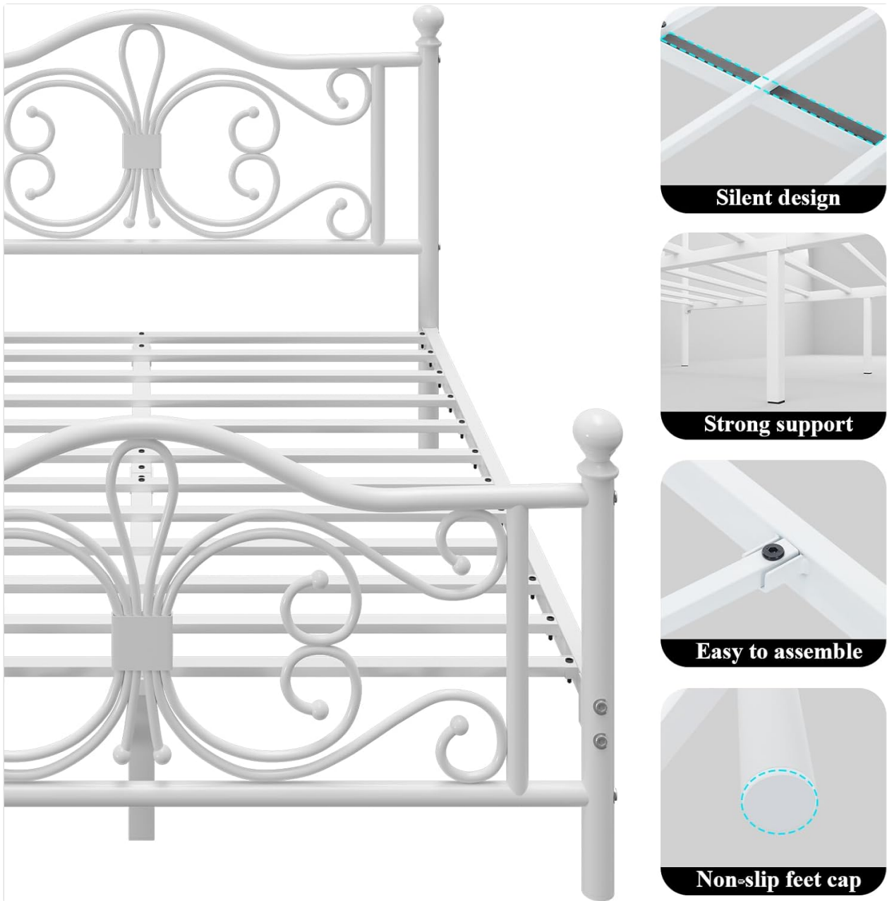
Image: Visual representation of key features including silent design, strong support, easy assembly, and non-slip feet caps.