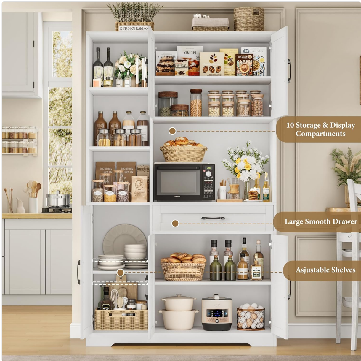
Figure 5: An interior view highlighting the 10 storage and display compartments, the large smooth drawer, and the adjustable shelves within the cabinet.