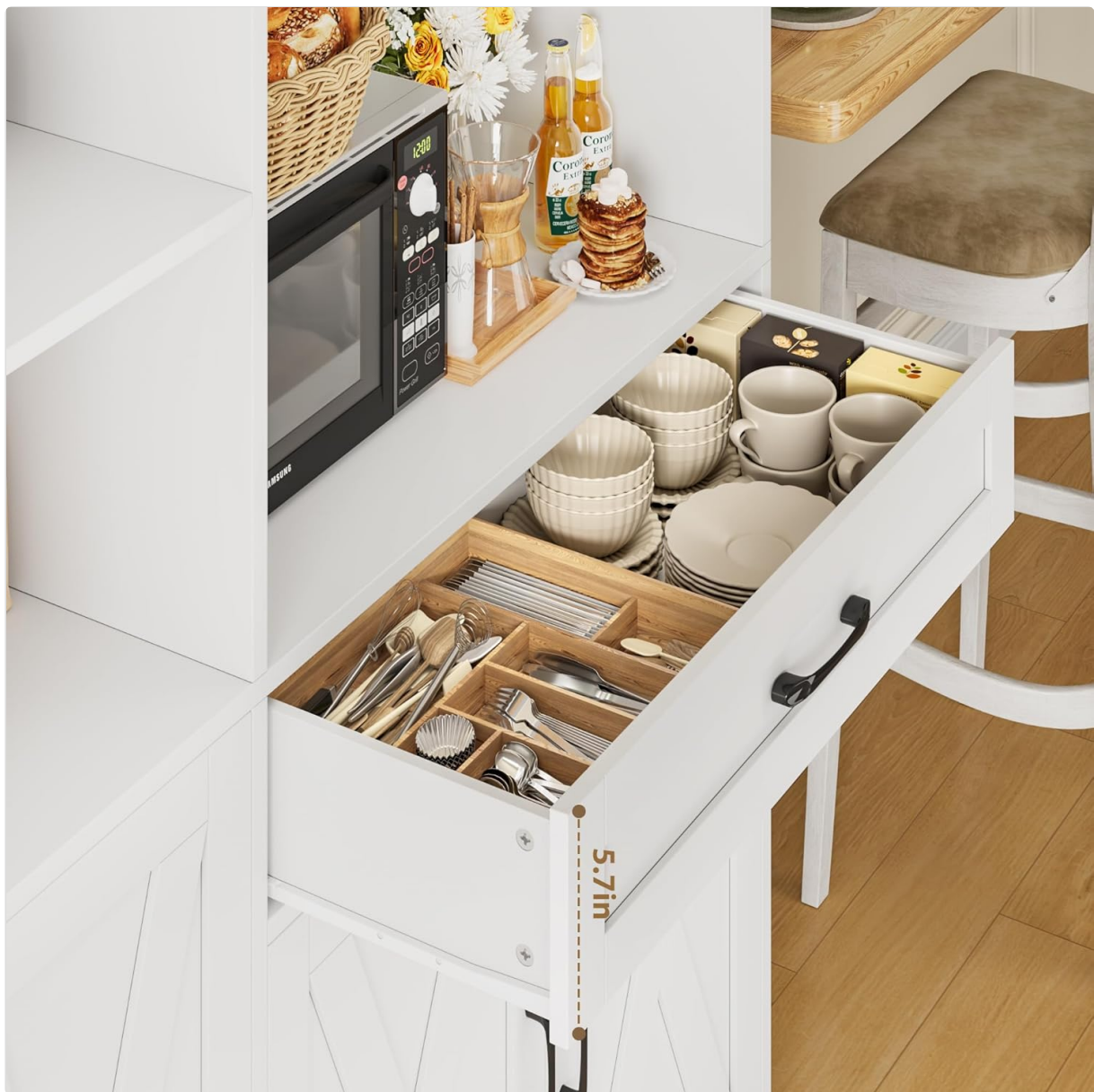
Figure 7: A detailed view of the wide drawer, shown with kitchen utensils and dishes, demonstrating its capacity for hidden storage.