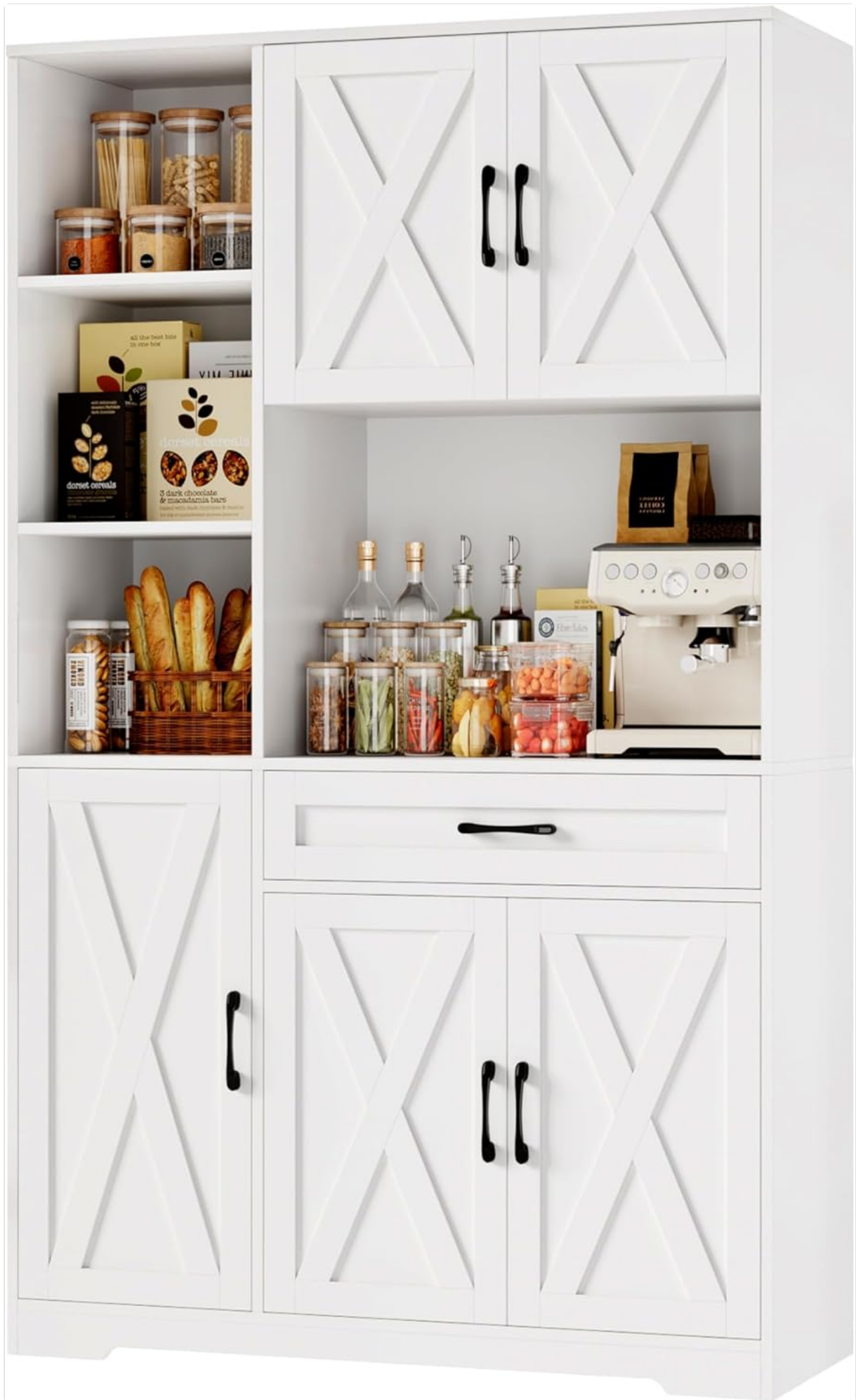
Figure 1: Front view of the HOSTACK 71" Tall Kitchen Pantry Storage Cabinet, showcasing its white finish and barn doors.