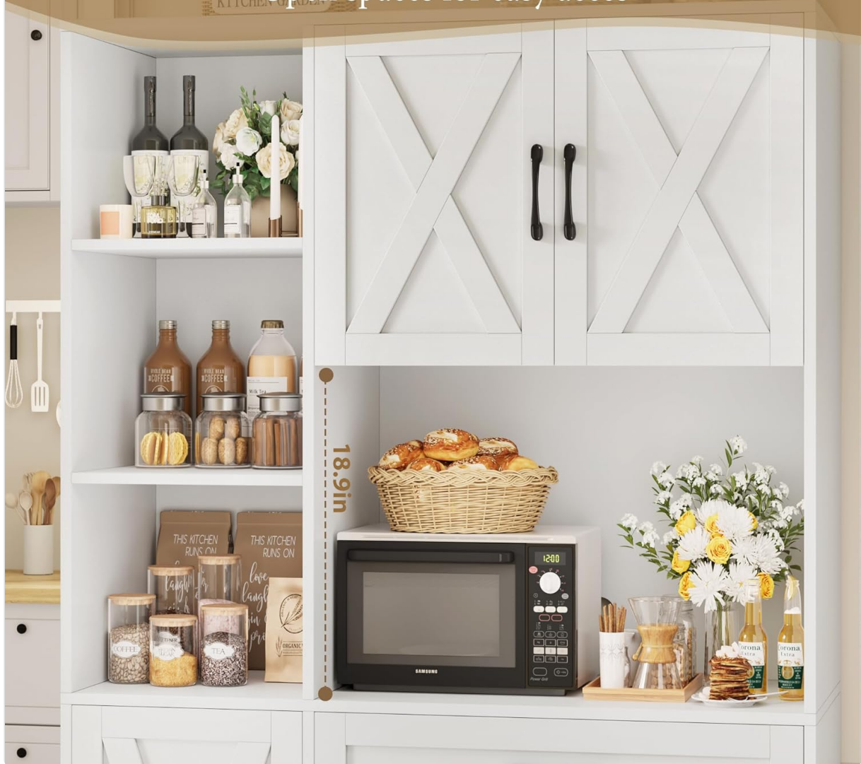
Figure 6: A close-up of the large open compartment, measuring 18.9 inches in height, suitable for a microwave or other kitchen appliances, with a cable management hole visible.