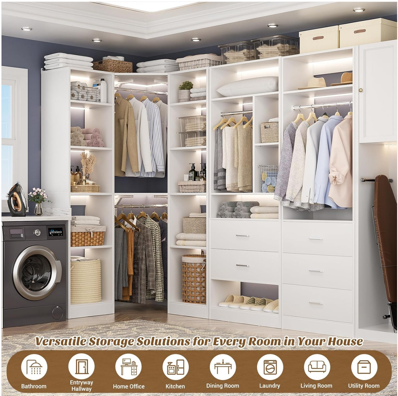
Image 5.2: The closet system used in a laundry room, illustrating its adaptability for various storage needs beyond a bedroom closet.