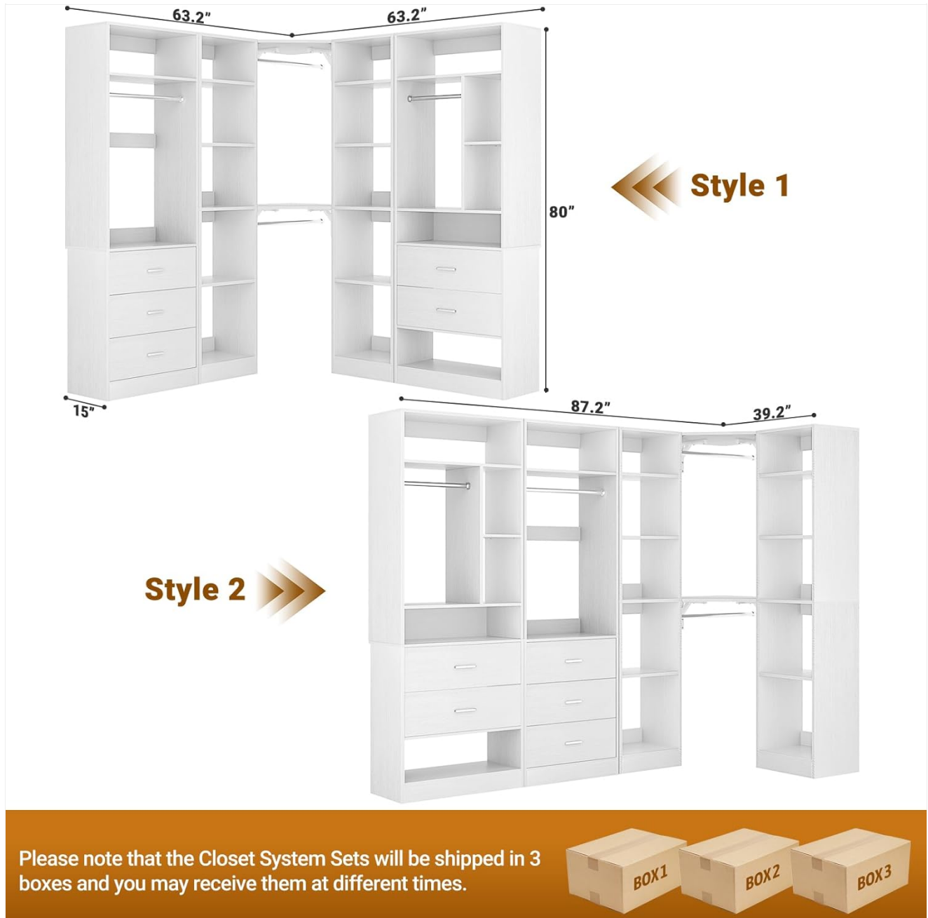
Image 3.1: Illustration of the closet system's dimensions and the three-box packaging for shipment.