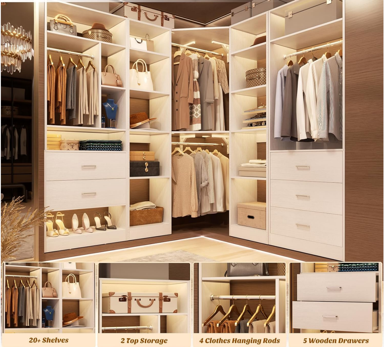
Image 5.1: Close-up highlighting the various storage features: shelves, top storage, hanging rods, and drawers.

- 2,000 lbs capacity, holds up to 500 clothings and small items