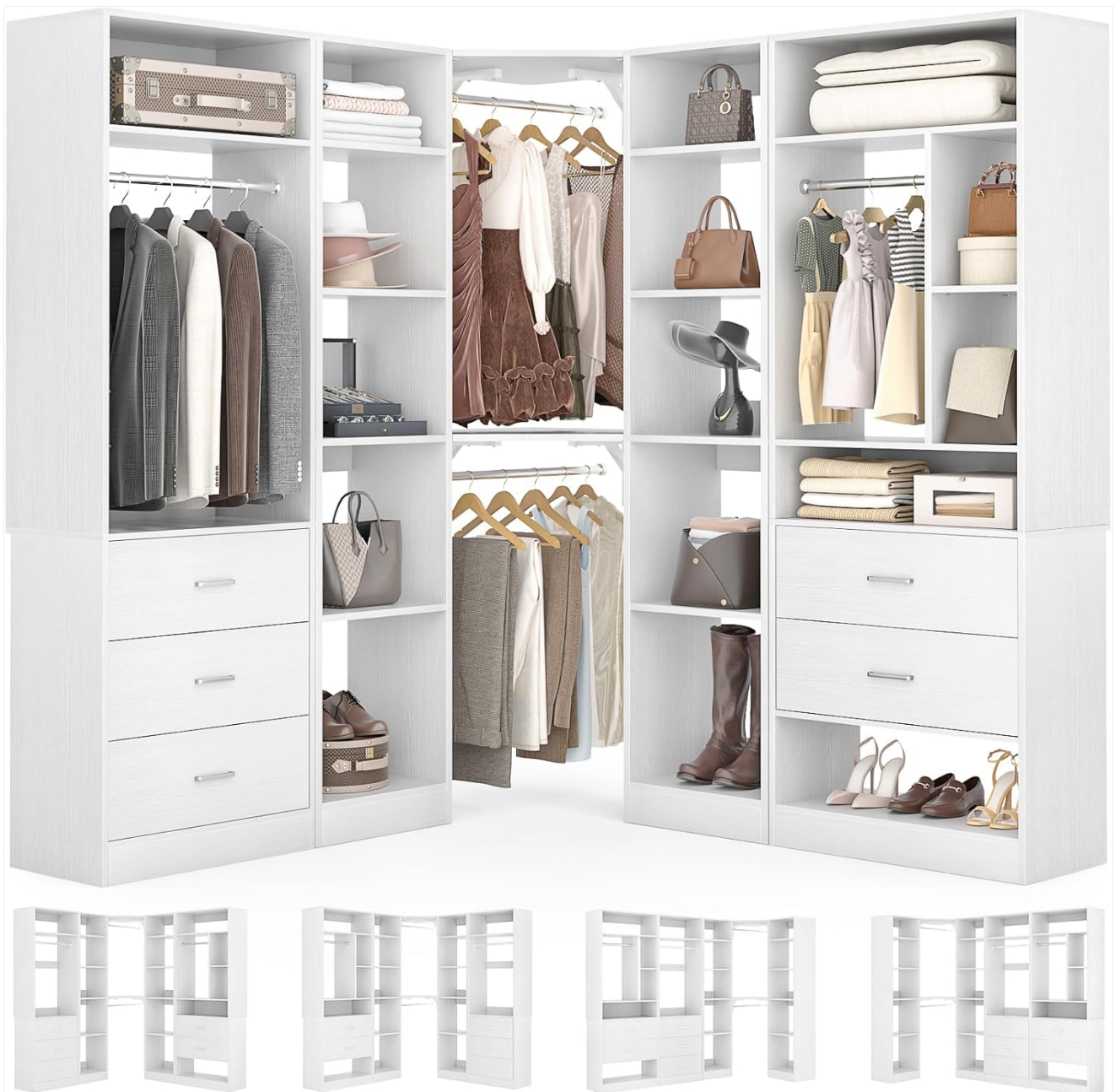
Image 1.1: Fully assembled BesioSt Corner Closet System, showcasing its storage capabilities with clothes, shoes, and bags.