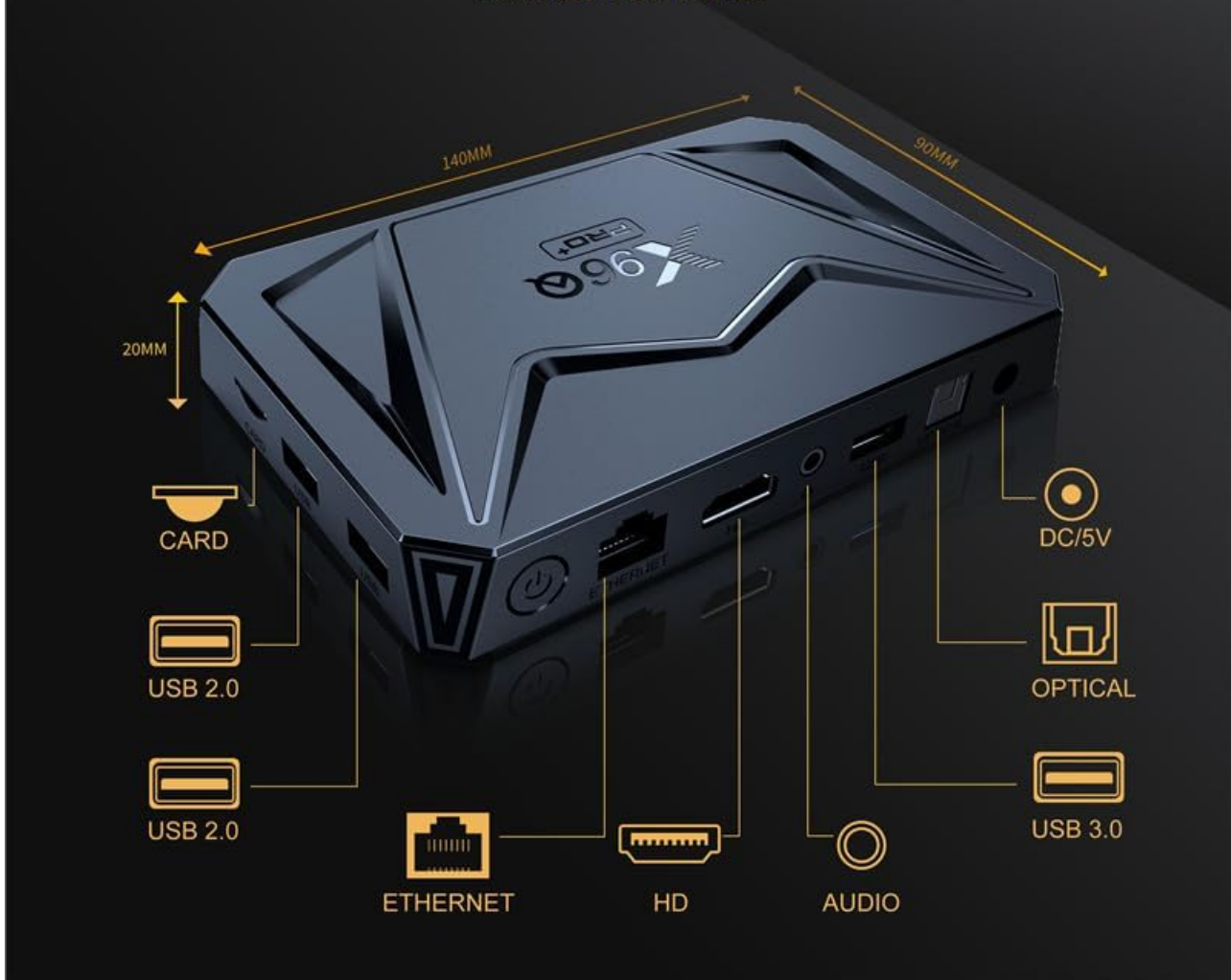
Image: Diagram showing the various ports and dimensions of the CHROX X96Q PRO+ TV Box, including USB 2.0, USB 3.0, Ethernet, HD (HDMI), Audio, Optical, DC/5V, and Card slot.

Various interfaces such as HD, LAN, USB, etc. To meet your different needs at the same time.