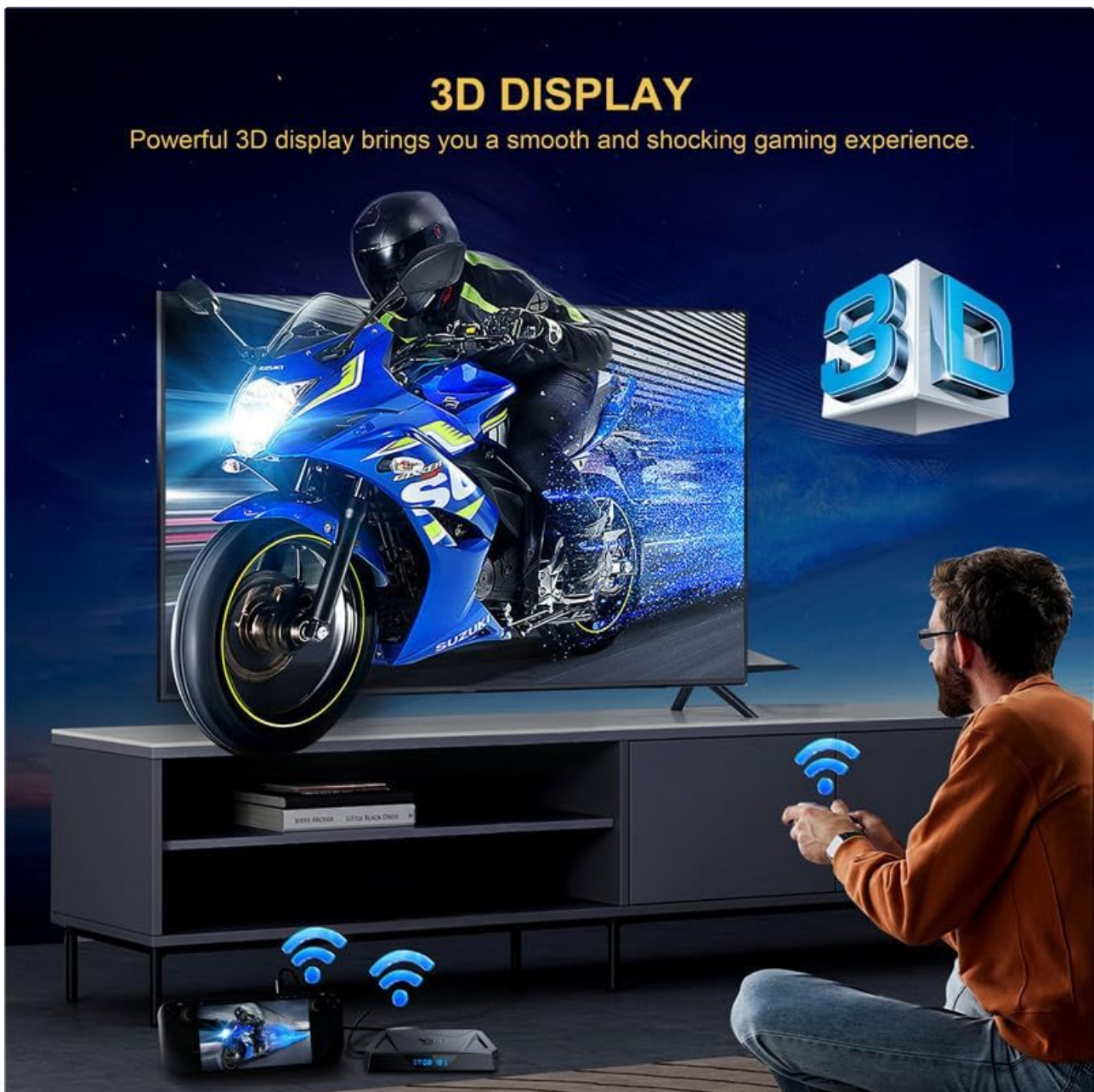
Image: A person playing a 3D game on a TV, demonstrating the 3D display capability of the CHROX X96Q PRO+ TV Box.