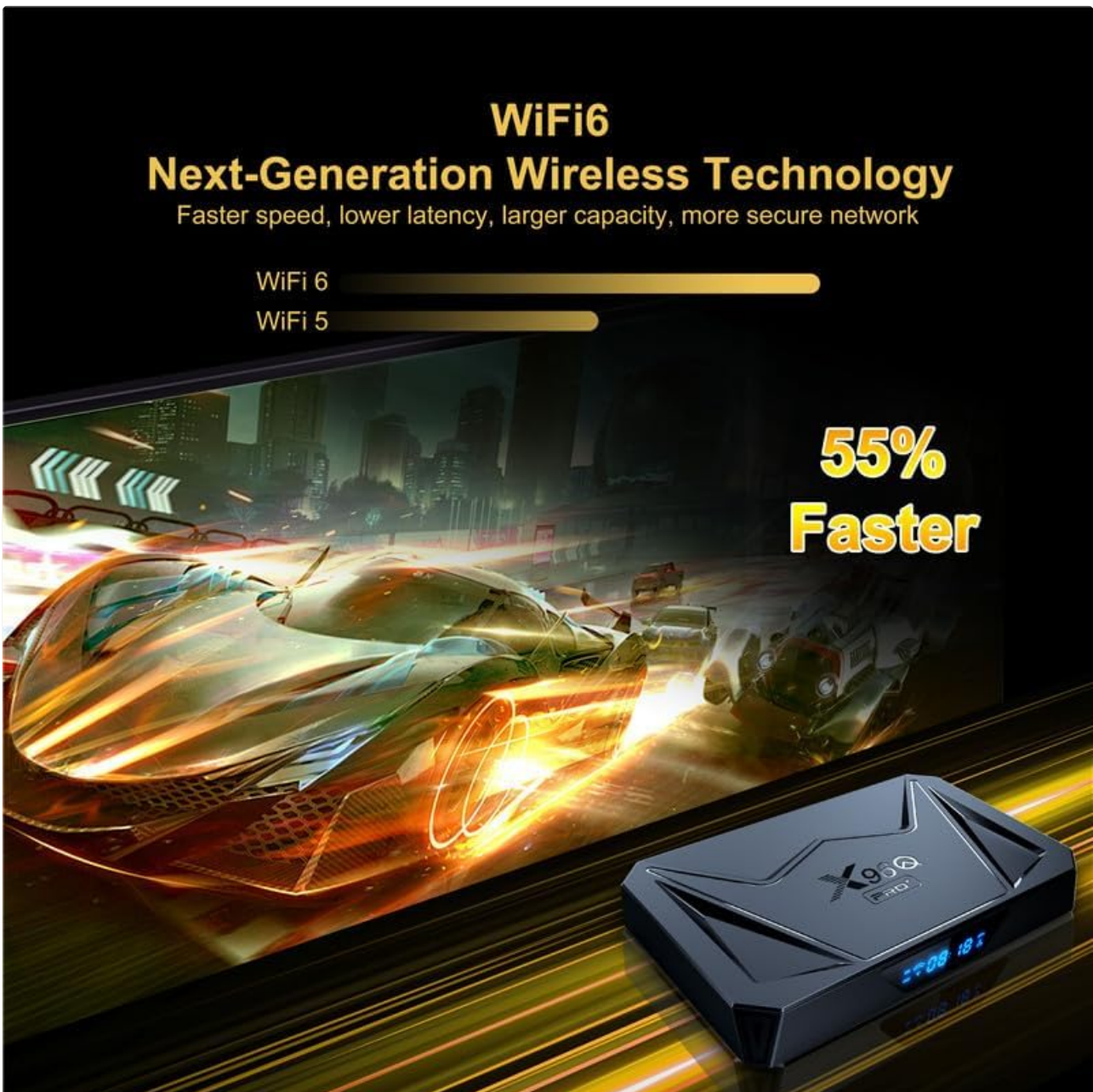
Image: Illustration highlighting the Wi-Fi 6 technology of the CHROX X96Q PRO+ TV Box, indicating faster speed and lower latency compared to Wi-Fi 5.