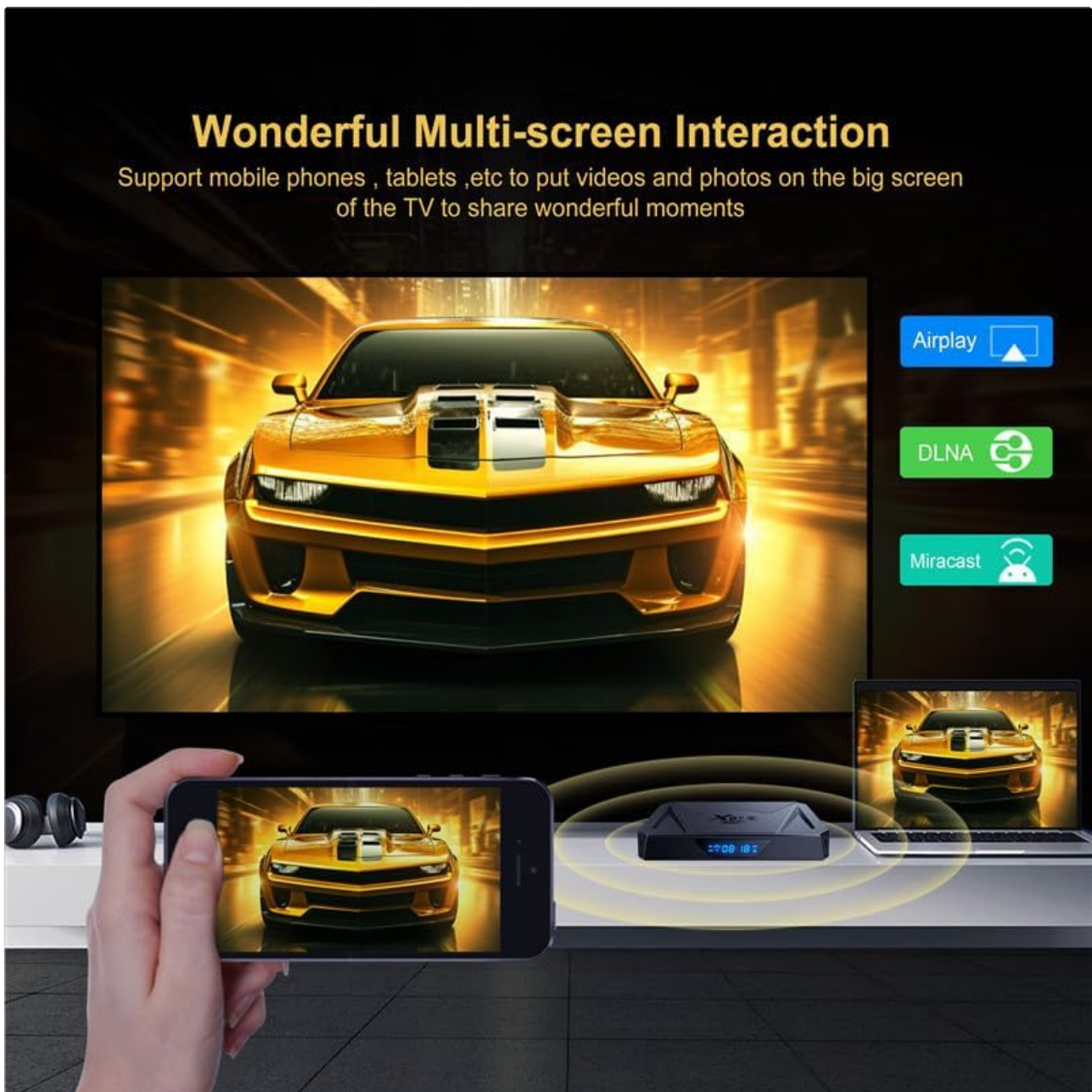
Image: Depiction of multi-screen interaction, showing a smartphone and laptop casting content to a TV via the CHROX X96Q PRO+ TV Box using Airplay, DLNA, and Miracast.

Ensure your mobile device and the TV Box are connected to the same Wi-Fi network for these features to function.