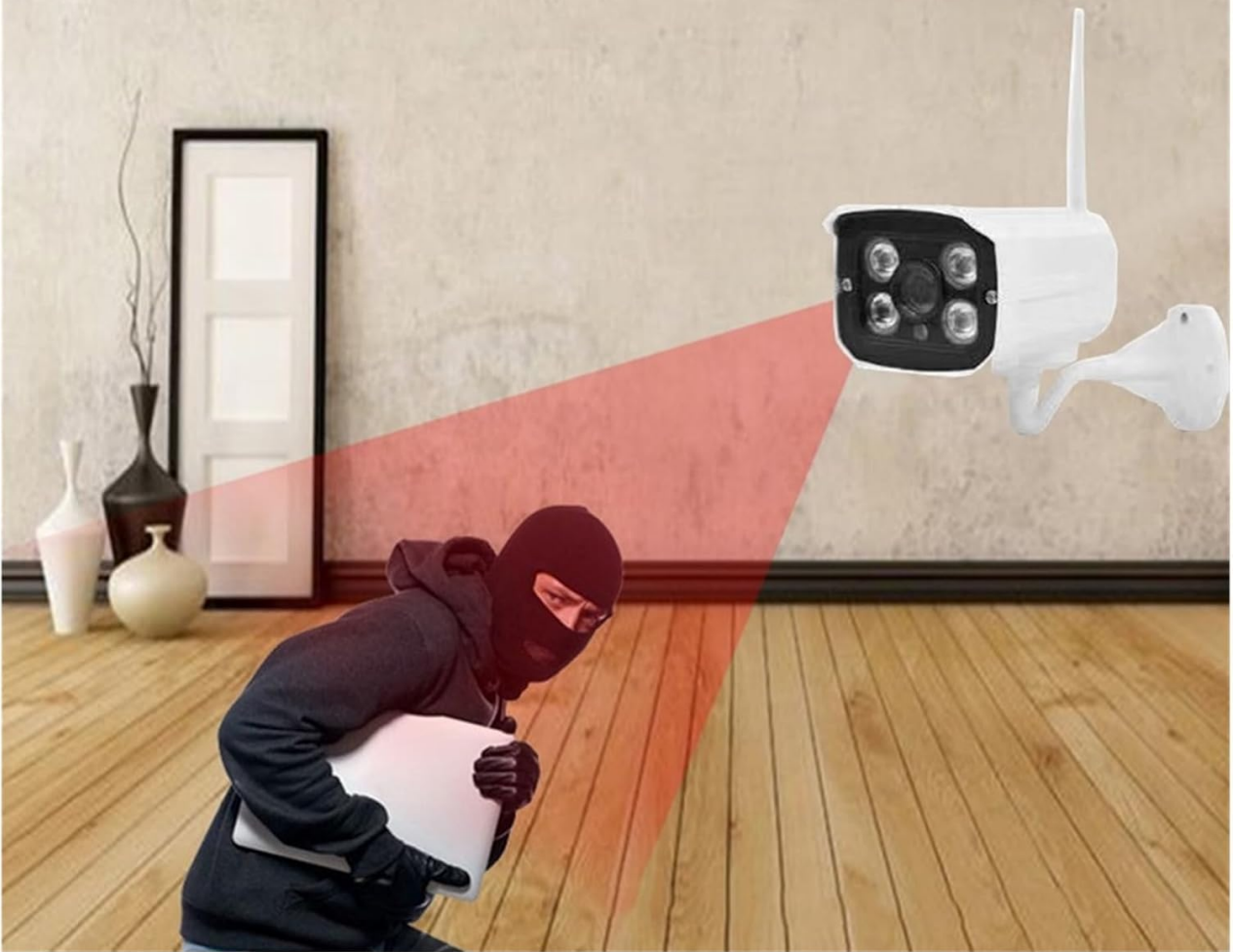
Image: Motion Detection Intelligent Alarm. This image depicts a security camera with a red detection zone, highlighting its ability to detect human movement and trigger an alarm, sending notifications to a mobile phone.

Push alarm message to mobile phone when abnormal situation occurs at home