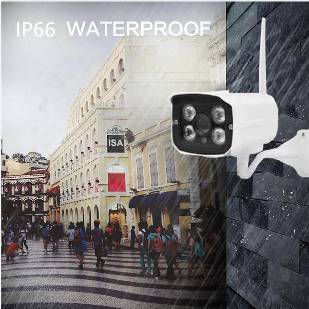
Image: IP66 Waterproof Camera. This image demonstrates the camera's IP66 waterproof rating, showing it functioning reliably outdoors even in rainy conditions, ensuring durability against environmental elements.