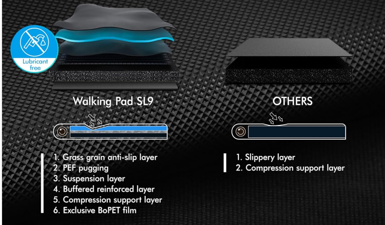
Figure 7: The innovated 6-layer running belt provides anti-slip, durable, and anti-static performance, contributing to a comfortable and safe workout experience.