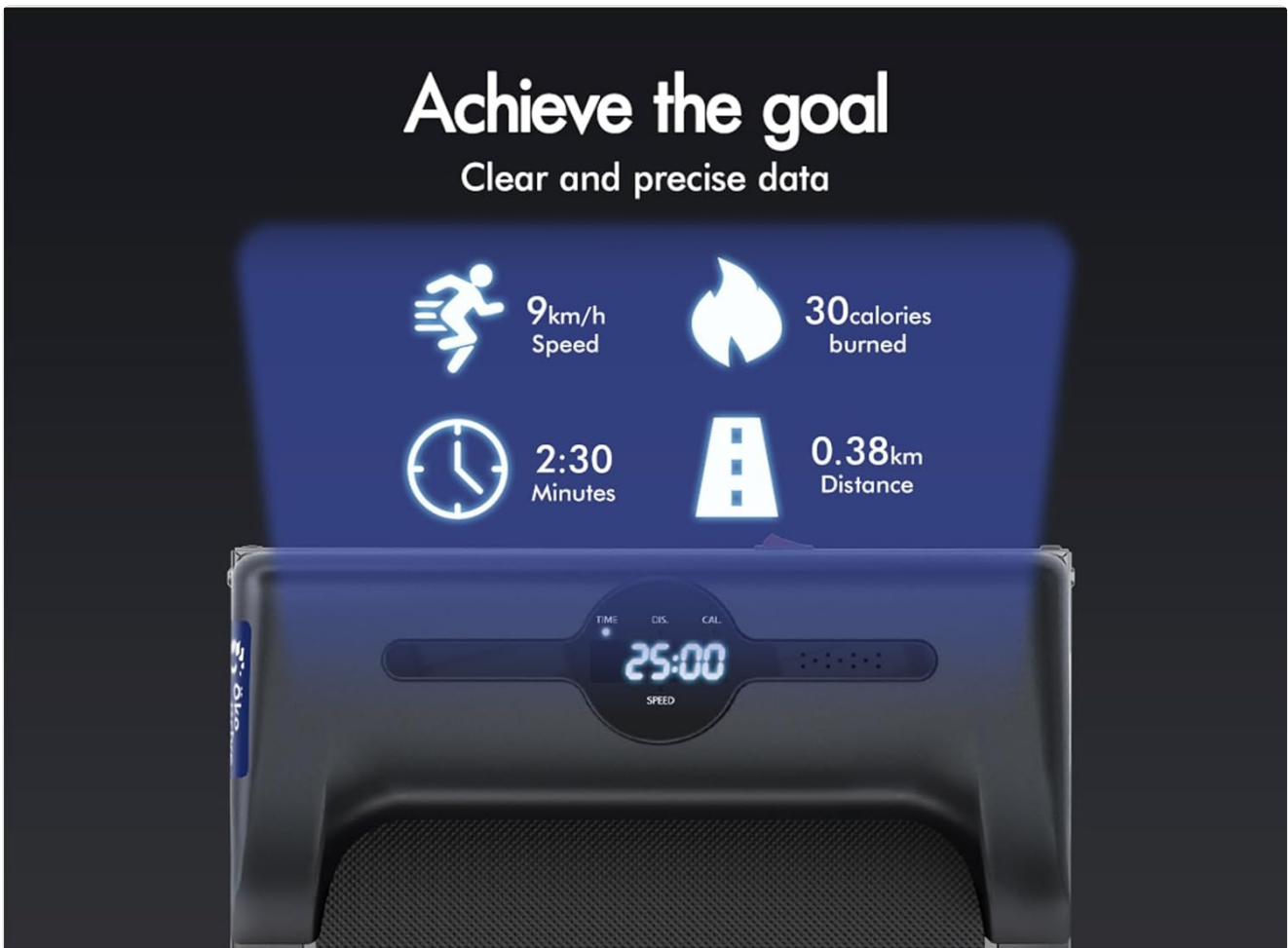
Figure 5: The clear LED display provides essential workout metrics such as speed, time, distance, and calories burned, helping users track their progress.