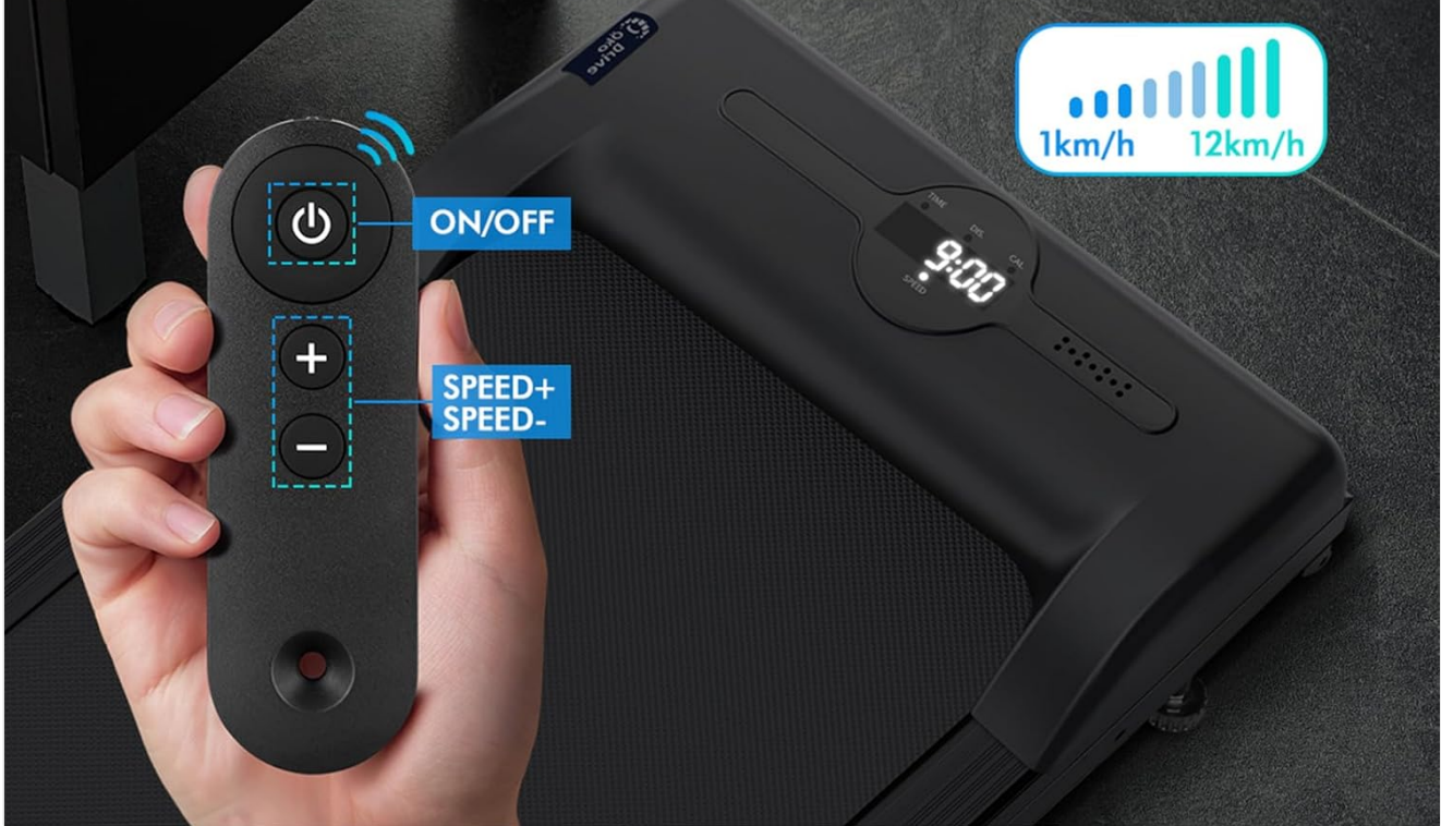
Figure 4: The remote control provides quick access to power on/off and speed adjustments, allowing users to easily manage their workout intensity.