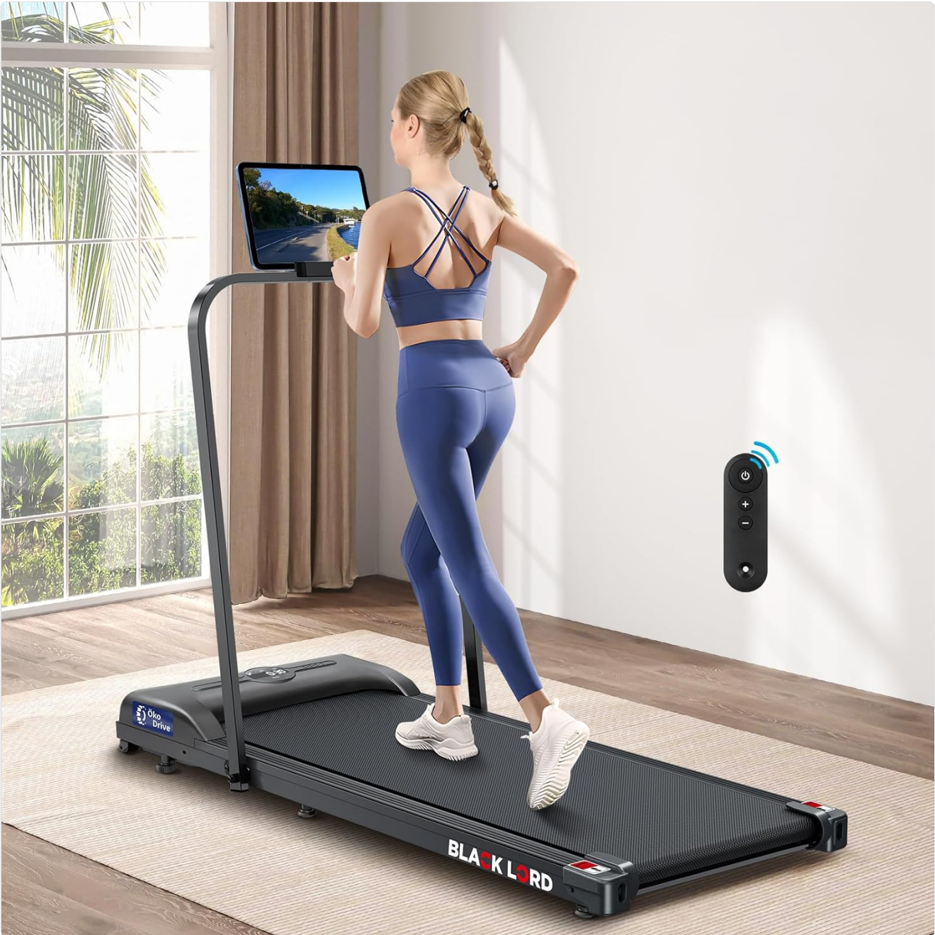
Figure 1: BLACK LORD Walking Pad Treadmill in a home setting, demonstrating its compact design and ease of use for walking or light jogging.

The BLACK LORD Walking Pad Treadmill is designed for home fitness, offering a compact and efficient way to walk, jog, or run.