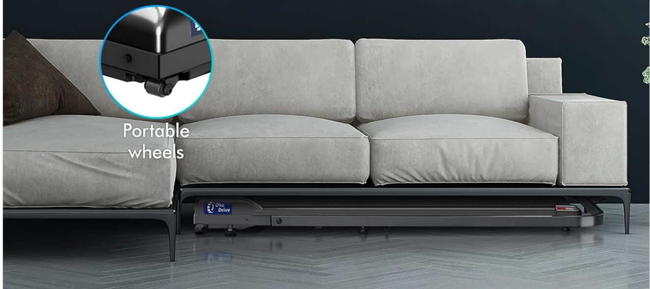
Figure 3: The treadmill's slim design allows for convenient storage under furniture like a sofa or bed, highlighting its portability with integrated wheels.

Under sofa, bed or against the wall in your favor