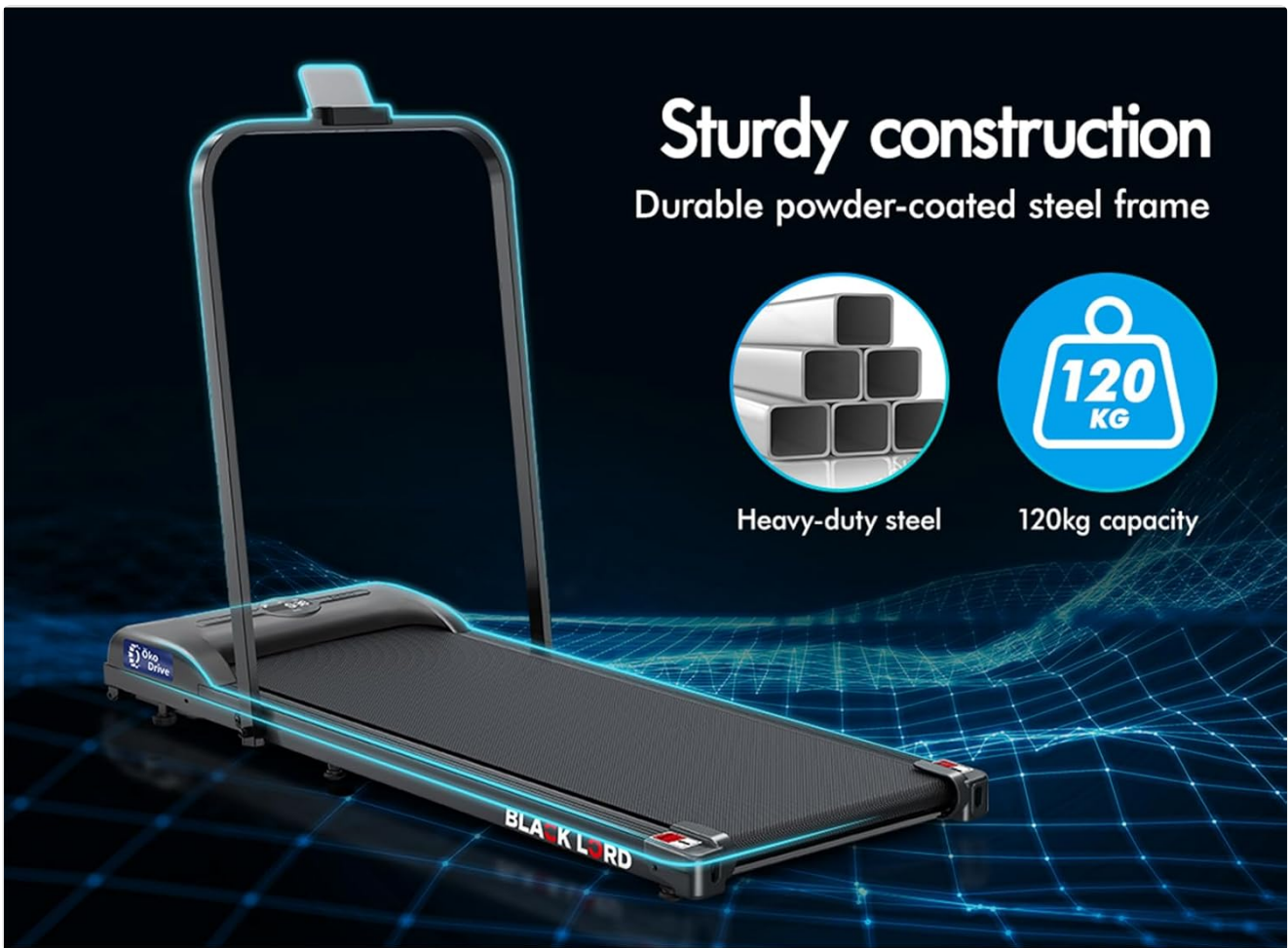
Figure 8: The treadmill features a durable powder-coated steel frame, ensuring sturdy construction and a high weight capacity.