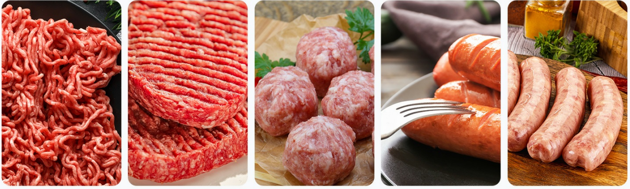
Image: A visual representation of the included 4 cutting plates, 3 grinding blades, and 2 sausage stuffer tubes, along with examples of their output.

Great for preparing fresh burgers, sausages and meatballs to enjoy with your family