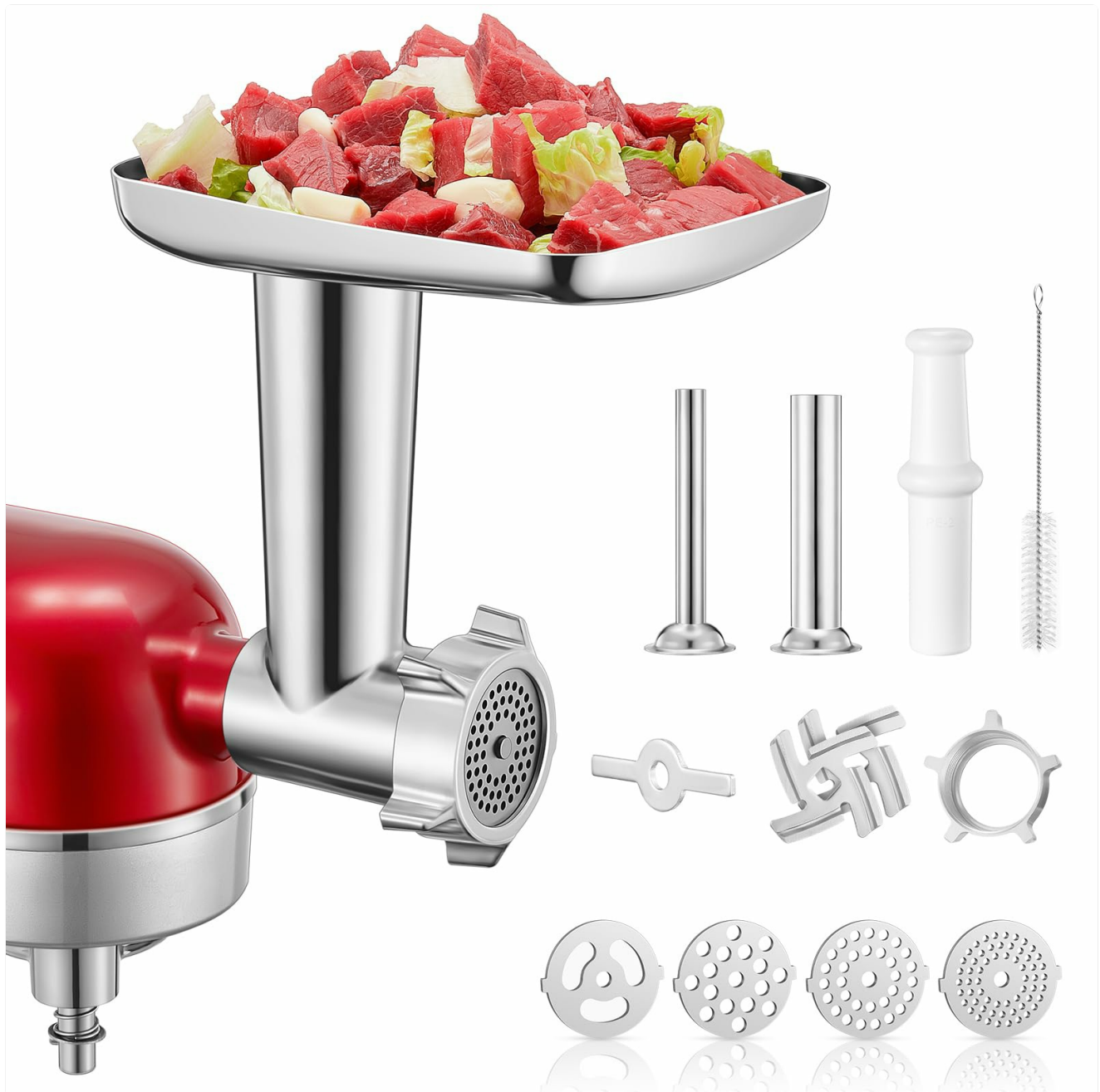
Image: The FOHERE Meat Grinder Attachment, showcasing its main body, food tray, and various grinding plates and sausage stuffer tubes.