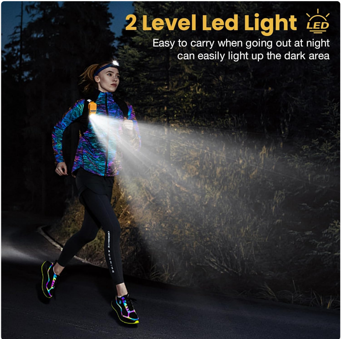
Figure 5: 2-Level LED Light in Use

Easy to carry when going out at night can easily light up the dark area