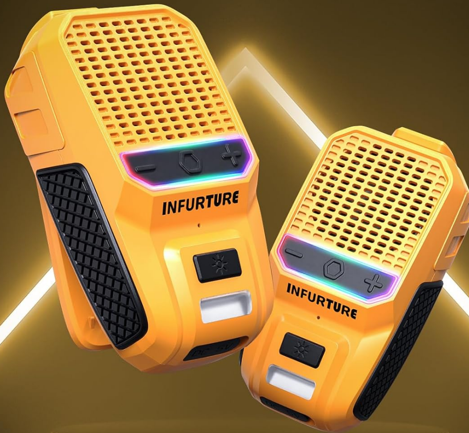
Figure 6: Multi-Color RGB Flashlights

Long press for 2-3 seconds to switch between 2 light modes to enhance your music experience