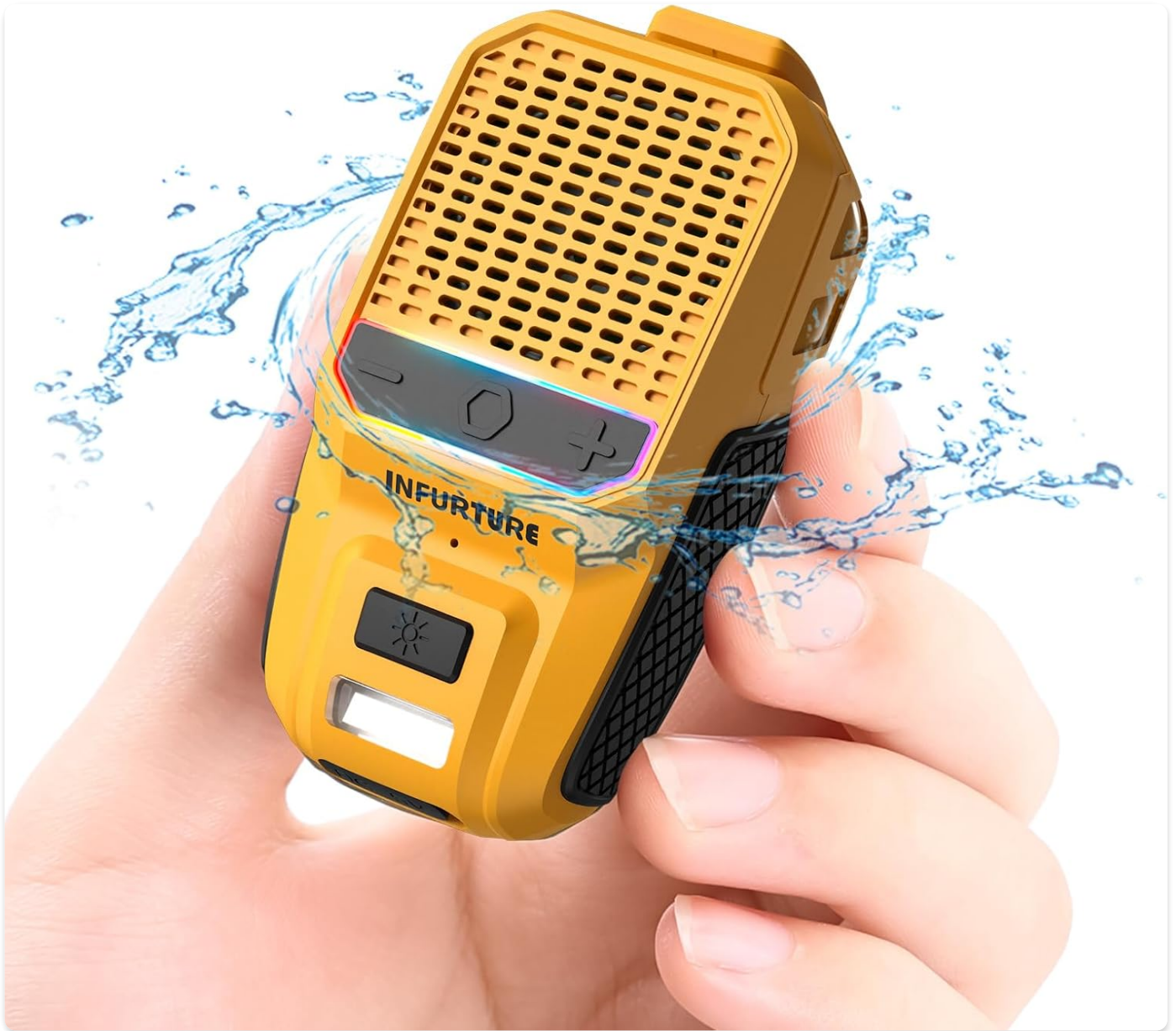
Figure 1: INFUTURE Clip-on Bluetooth Speaker (Yellow)