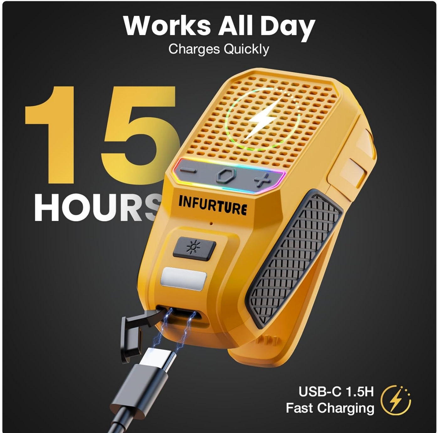
Figure 2: Charging the Speaker

Before first use, fully charge the speaker. Connect the provided USB-C power cable to the charging port on the speaker and the other end to a USB power adapter (not included). The charging indicator light will show the charging status. A full charge takes approximately 1.5 hours and provides over 15 hours of playtime.