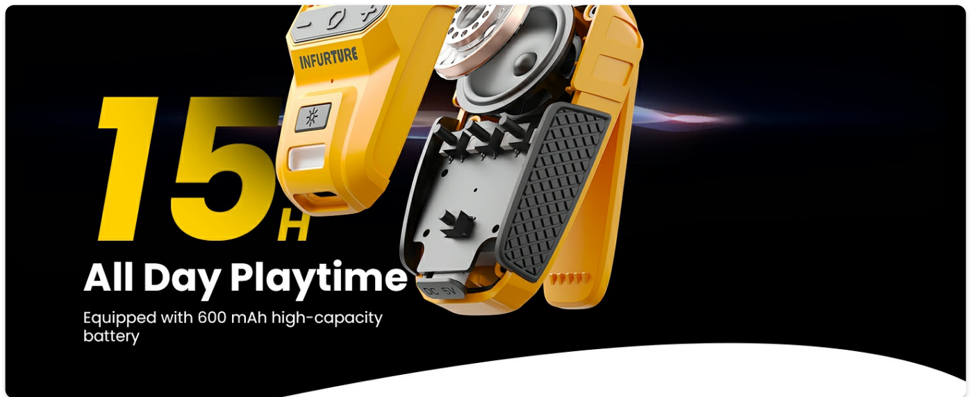
Figure 3: Speaker Controls Overview