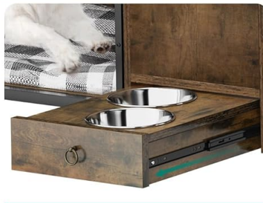
Built-in Dual Food Bowl