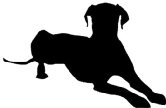
Image: A visual guide on how to accurately measure your dog's length and height to ensure a proper fit within a dog crate.

If you want your dog to stay comfortable, please measure them when laying down and sprawled out like they would normally sleep.