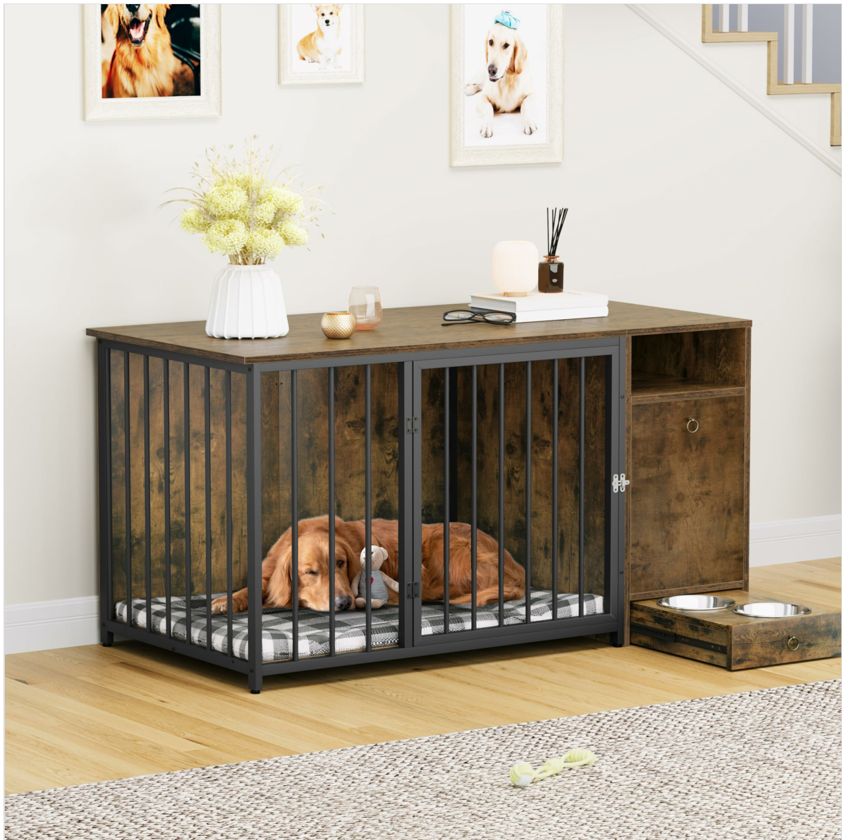
Image: The hidden bucket cabinet is shown open, illustrating its design for discreet storage of pet accessories or other items.