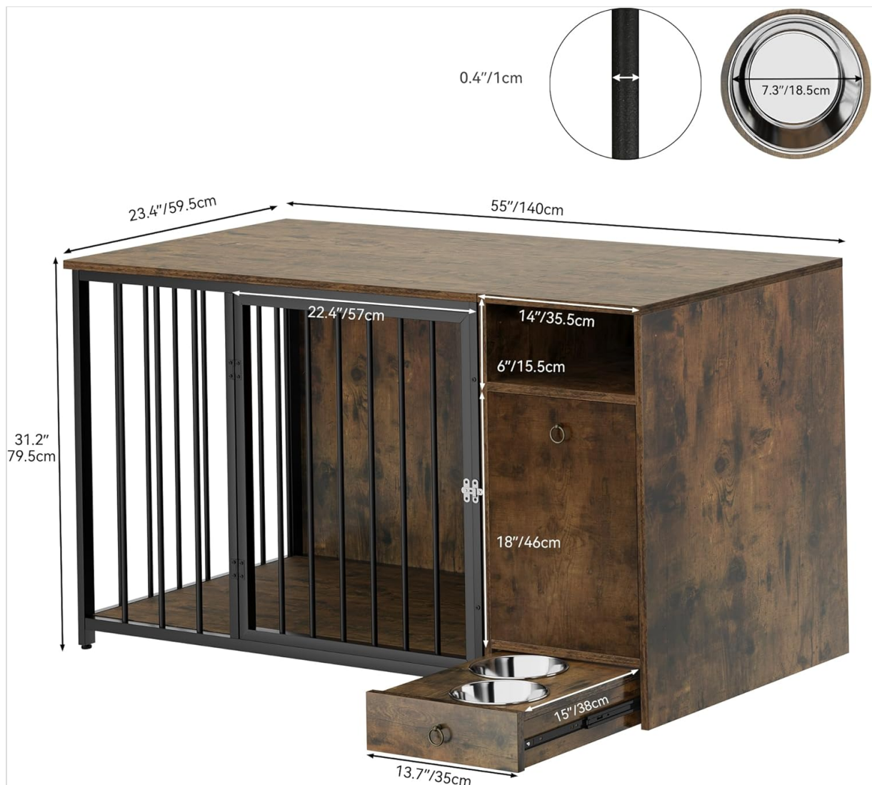
Image: A comprehensive diagram illustrating the dimensions of the dog crate furniture, including the main crate area, the storage compartment, and the pull-out feeder bowl drawer.