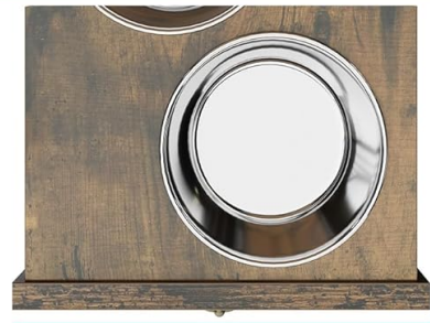
7.3inch Bowl for Larger Dog

Image: This image highlights the lockable sliding door mechanism and the integrated dual food bowls, showing a dog comfortably resting inside the crate.