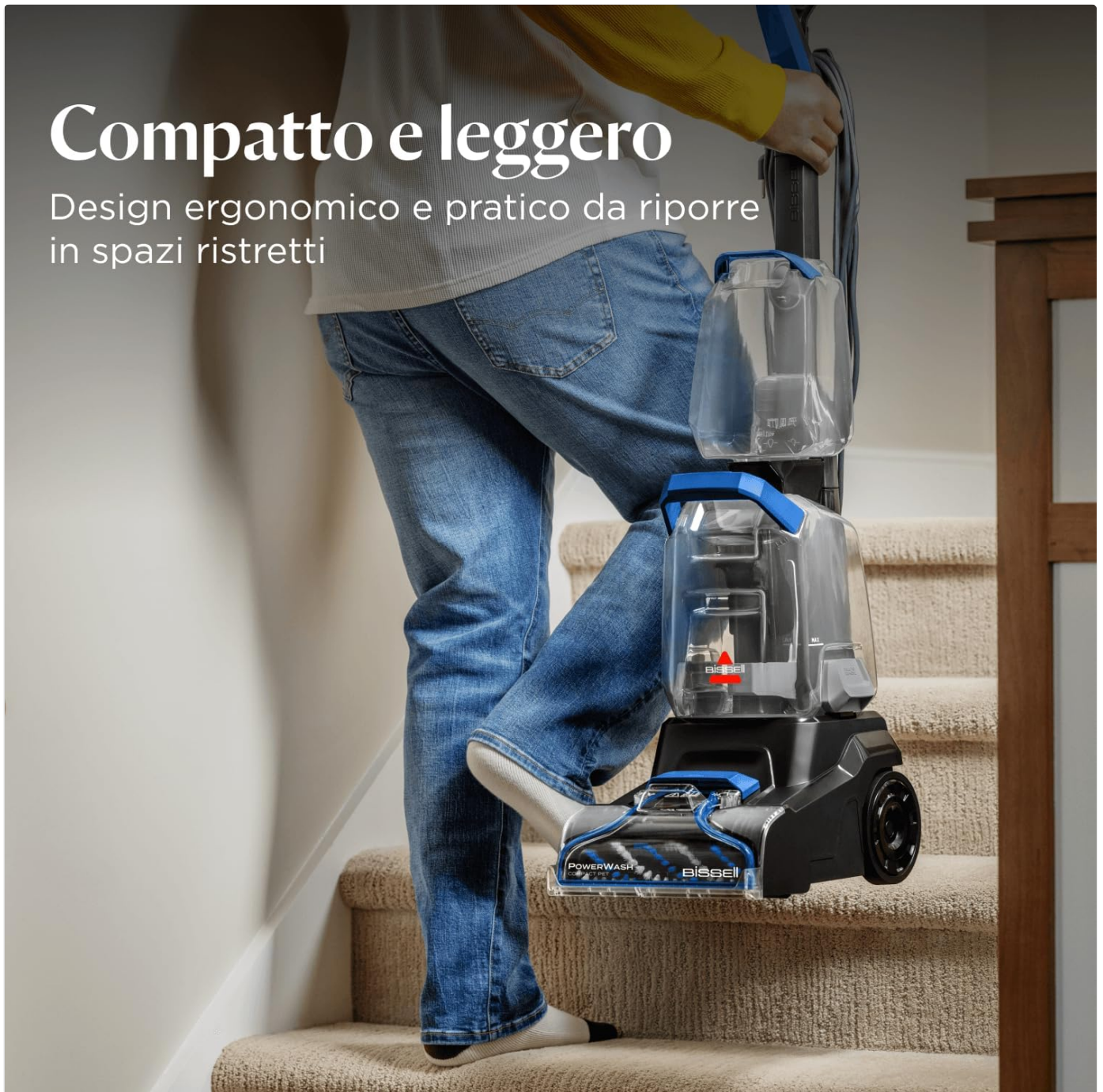
Image: The compact and lightweight design of the cleaner makes it easy to transport and store.

Design ergonomico e pratico da riporre in spazi ristretti