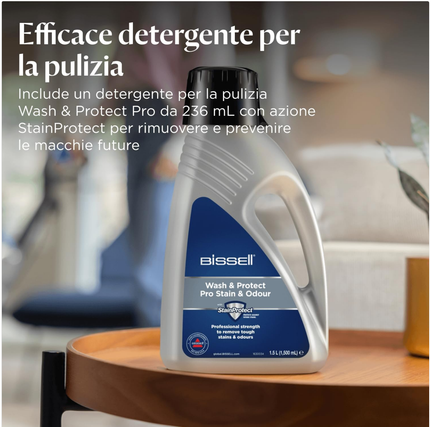
Image: The included BISSELL Wash & Protect Pro Stain & Odour Cleaning Solution bottle.

Include un detergente per la pulizia Wash & Protect Pro da 236 mL con azione StainProtect per rimuovere e prevenire le macchie future