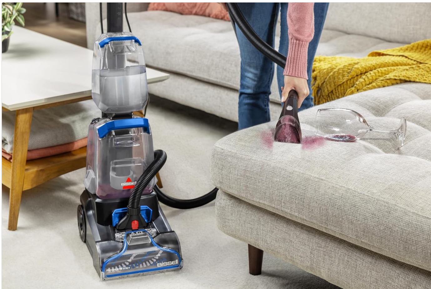
Image: The BISSELL PowerWash Compact Pet being used with its removable hose and Tough Stain Brush Tool to clean upholstery.