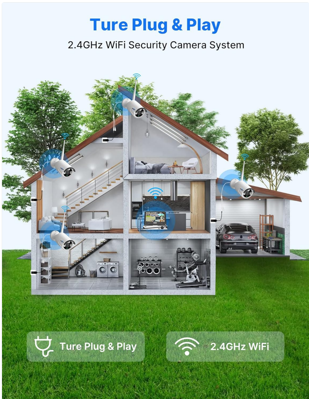
Figure 4.1: Wireless System Plug & Play Setup

This image illustrates the simple plug-and-play setup of the Hiseeu wireless security camera system, showing cameras wirelessly connected to the NVR within a home environment.