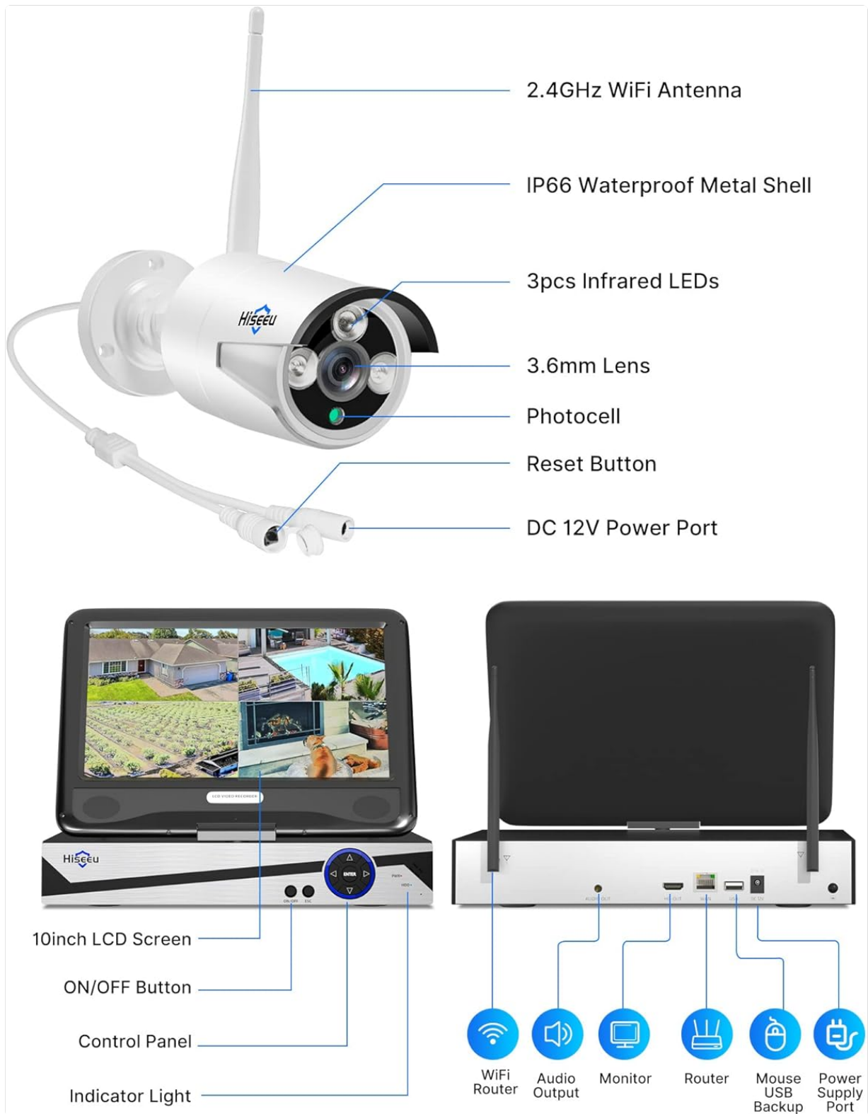
Figure 3.1: Detailed view of camera and NVR interfaces.

This diagram illustrates the various components of the Hiseeu camera and NVR, including the 2.4GHz WiFi Antenna, IP66 Waterproof Metal Shell, 3pcs Infrared LEDs, 3.6mm Lens, Photocell, Reset Button, DC 12V Power Port on the camera, and the 10inch LCD Screen, ON/OFF Button, Control Panel, Indicator Light, WiFi Router, Audio Output, Monitor, Router, Mouse USB Backup, and Power Supply ports on the NVR.