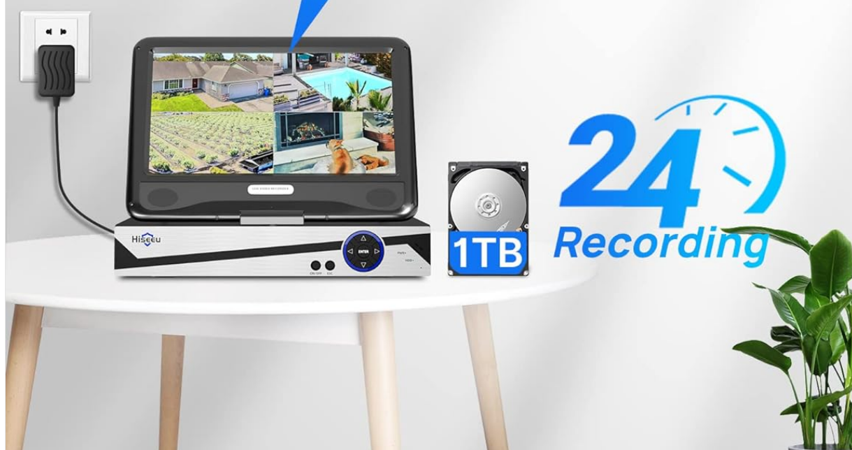
Figure 5.1: 1TB Hard Drive for Continuous Recording

This image highlights the pre-installed 1TB hard drive within the NVR, enabling continuous 24/7 recording for extended periods.