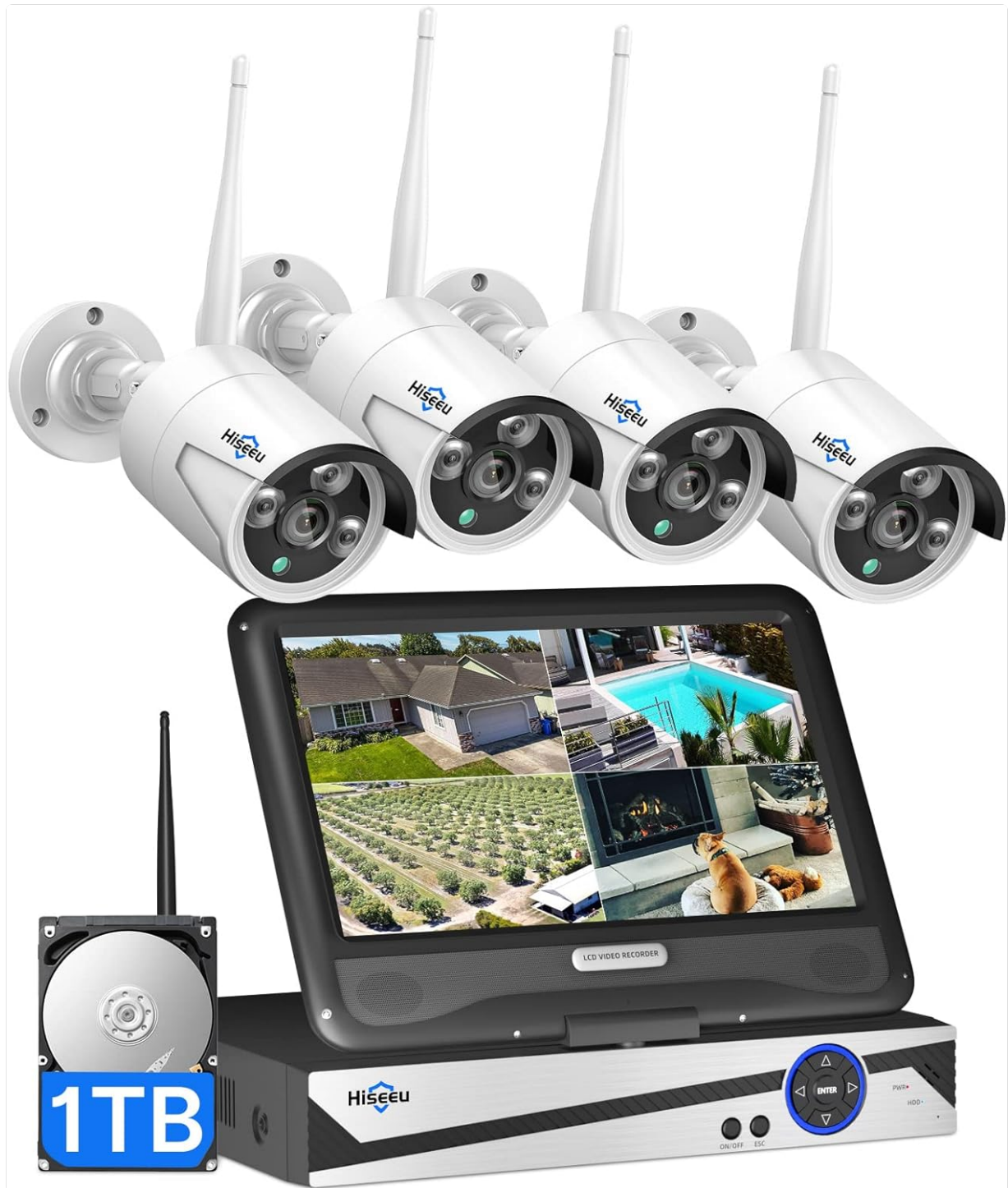
Figure 2.1: System Components Overview