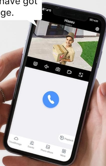
Figure 5.4: Flexible Remote Access & One-Way Audio

This image illustrates the remote access capability and one-way audio feature, allowing users to monitor and listen to activity at their property via the Hiseeu app.