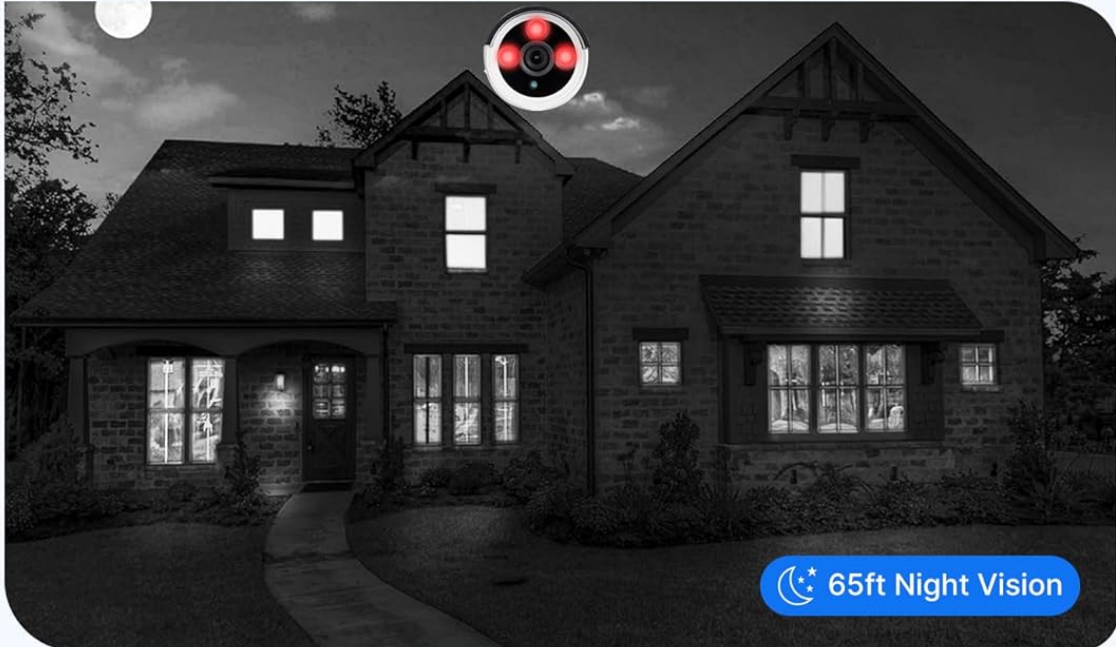
Figure 5.3: Clear Night Vision

This image compares the visual clarity of the Hiseeu 5MP camera during the day and at night, demonstrating its effective 65ft night vision capability.