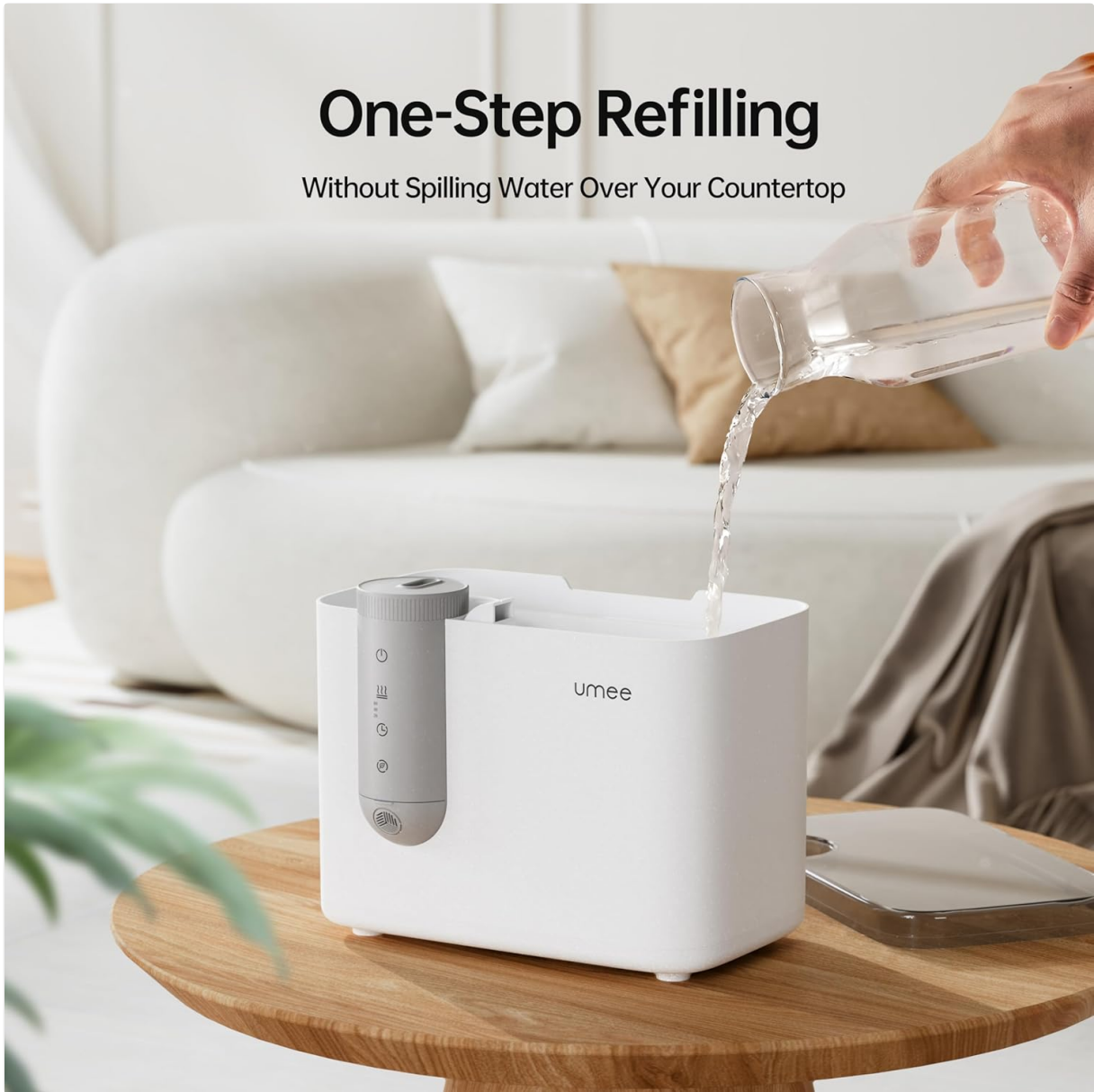
Figure 3.1: User refilling the Luri UM-HHM001 humidifier from the top. The top-fill design simplifies the refilling process.

Without Spilling Water Over Your Countertop