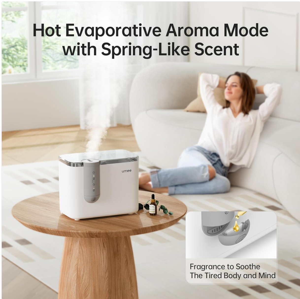
Figure 4.1: Adding essential oils to the aroma box for the aroma function.

Video 4.1: This video demonstrates the easy top-fill feature, quiet operation, and aroma function of the Luri humidifier, highlighting its user-friendly design.