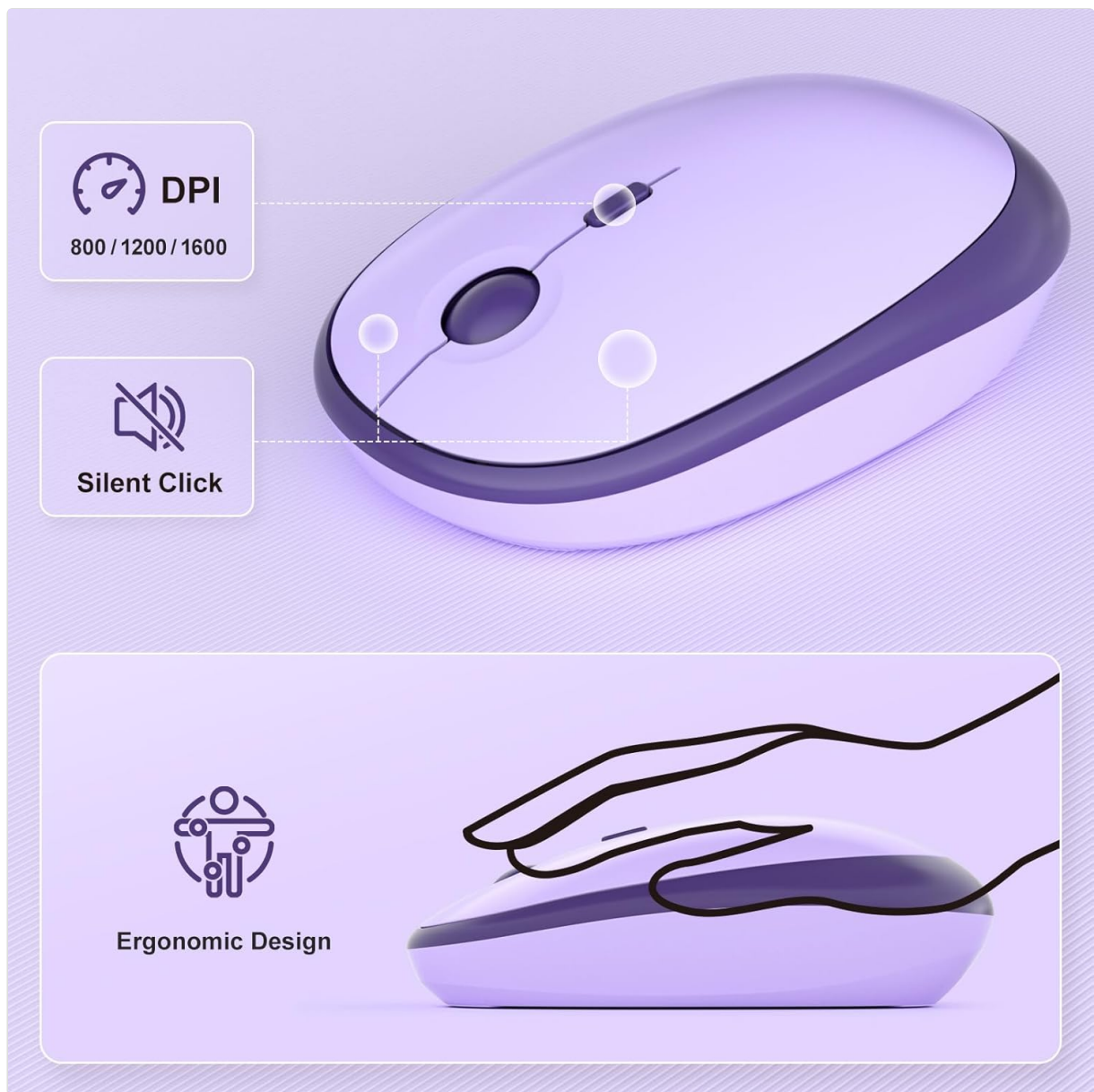
Image: The wireless mouse, highlighting its adjustable DPI settings (800/1200/1600) and silent click feature.