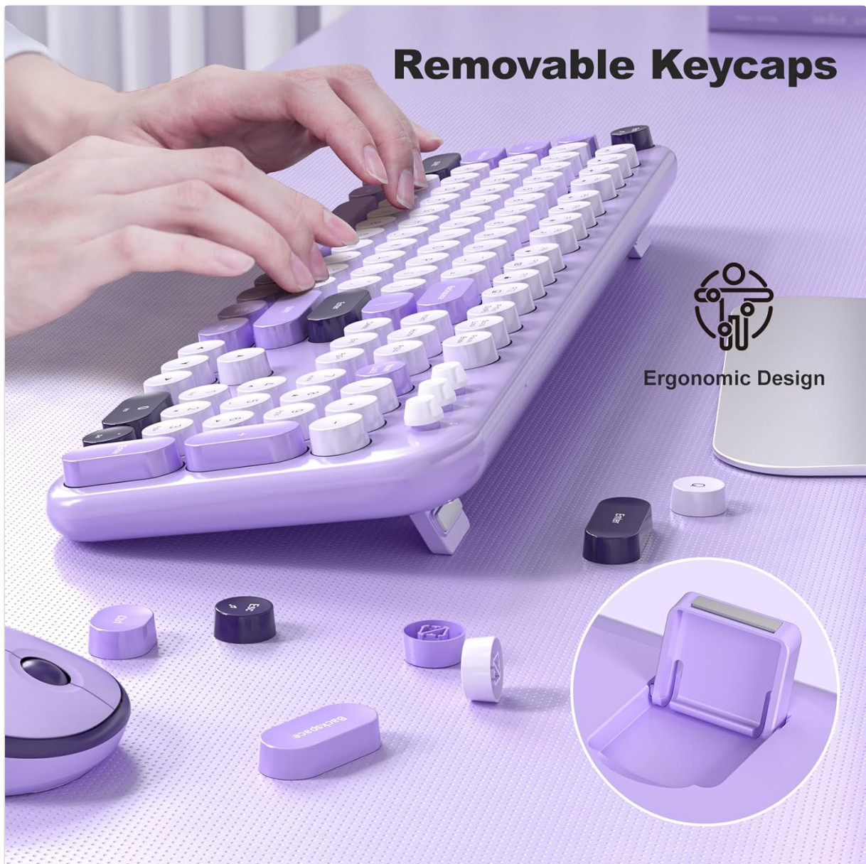
Image: A close-up view of the MOFII wireless keyboard, highlighting its round, retro-style keycaps and full-size layout.