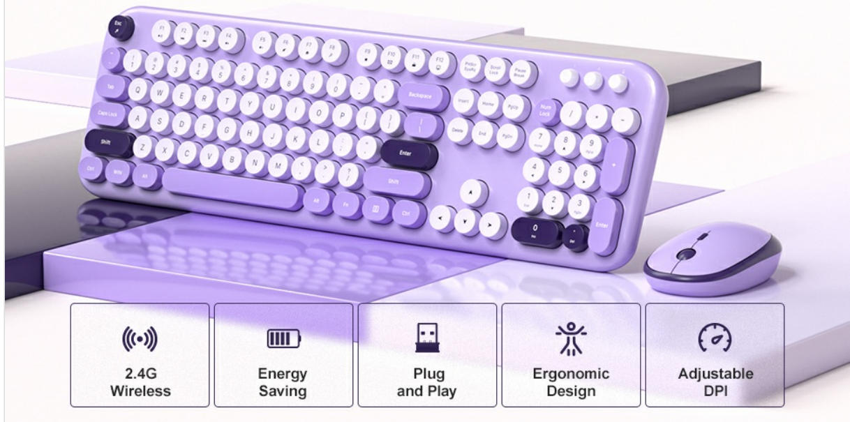
Image: A visual representation of the keyboard's multimedia hotkeys (F1-F12) and their functions.