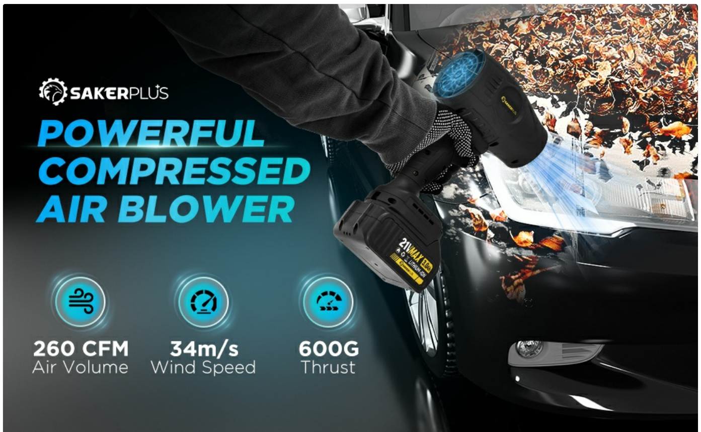
Image: Visual representation of the blower's performance metrics.