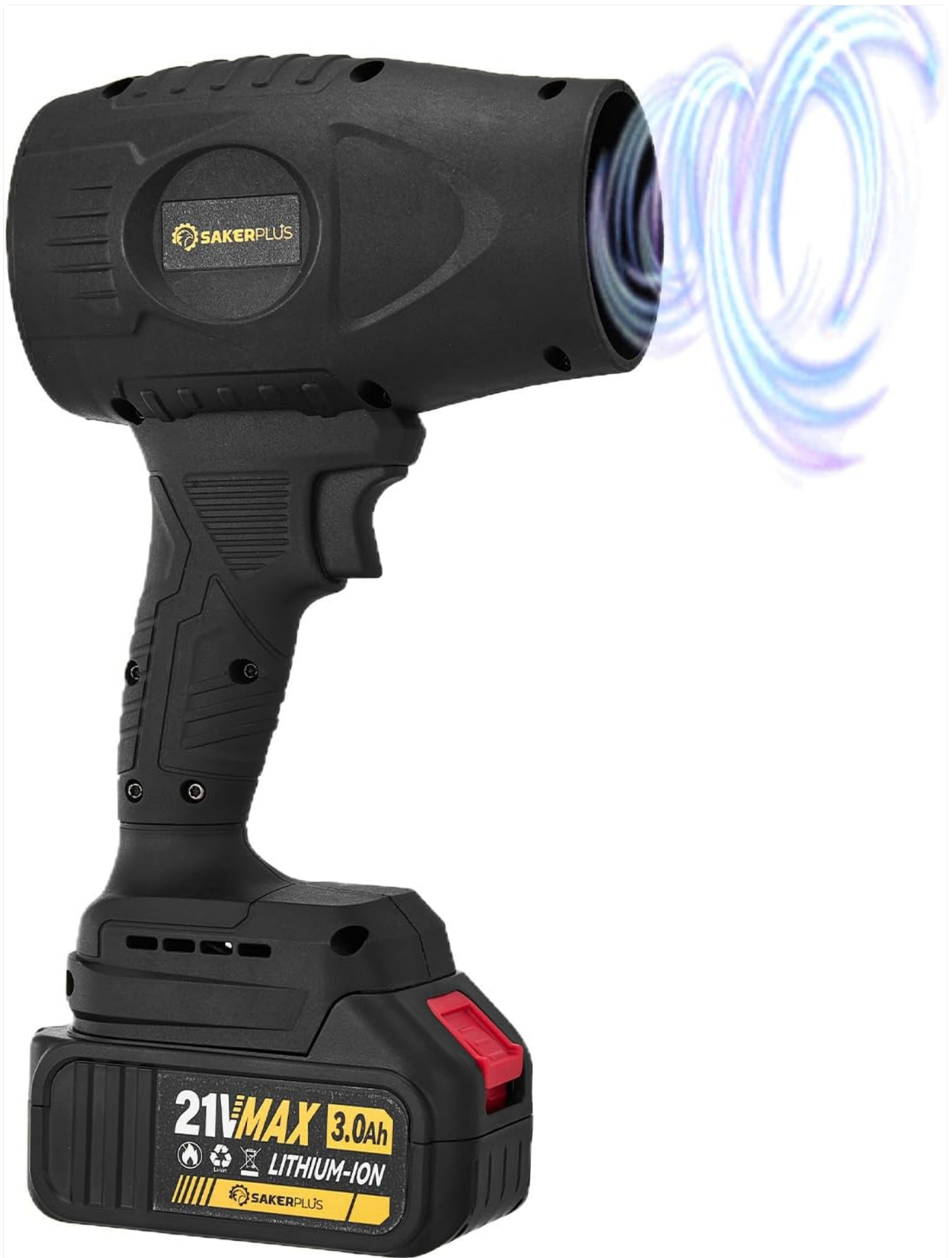
Image: The Sakerplus Portable Dust Cleaner unit with its attached battery.