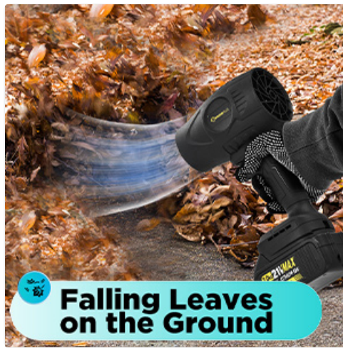
Image: The blower clearing fallen leaves from a ground surface.