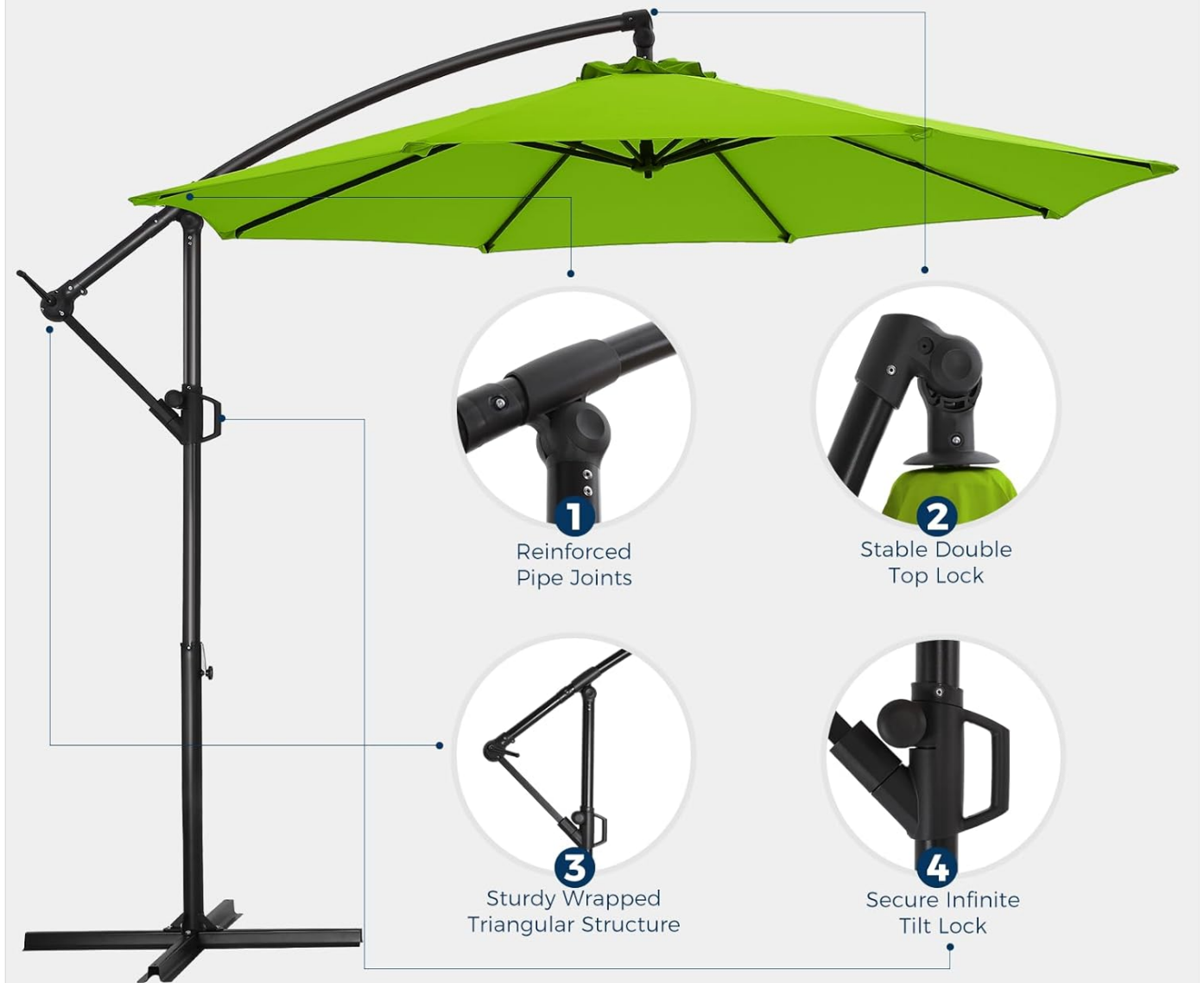
Figure 2: Details of the enhanced structural components for improved stability and durability.

Greatly Improved Stability and Durability