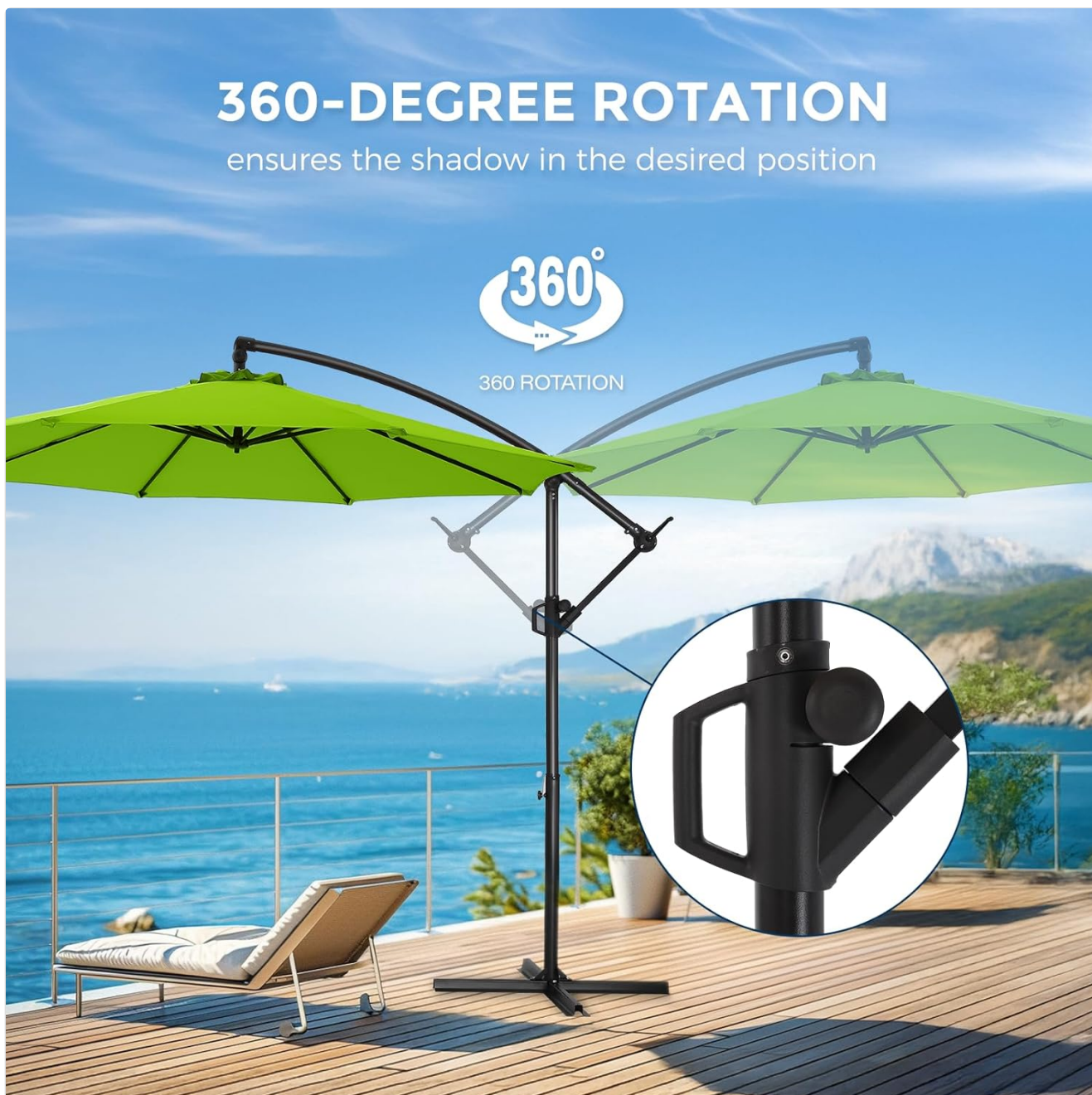
Figure 4: The 360-degree rotation feature ensures continuous shade.