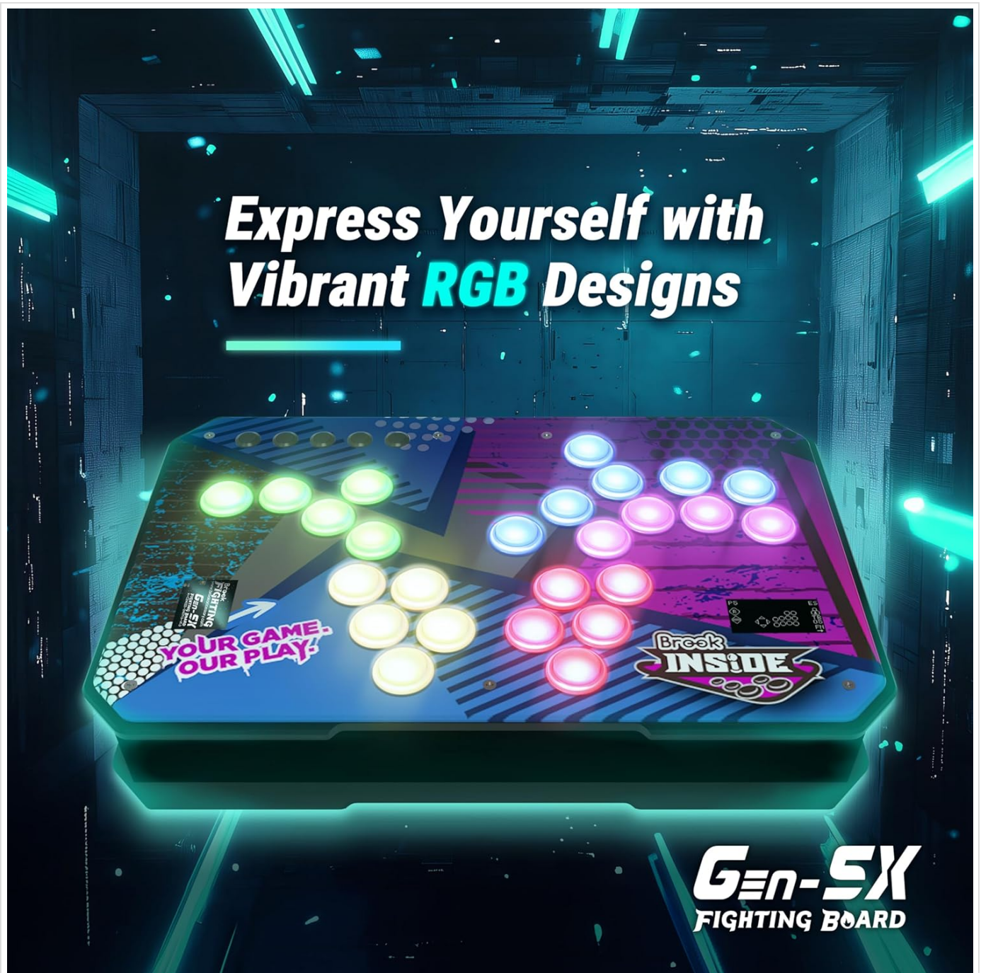
Figure 2.4: A custom fight stick featuring illuminated buttons with vibrant RGB lighting, demonstrating the board's support for customizable lighting effects.