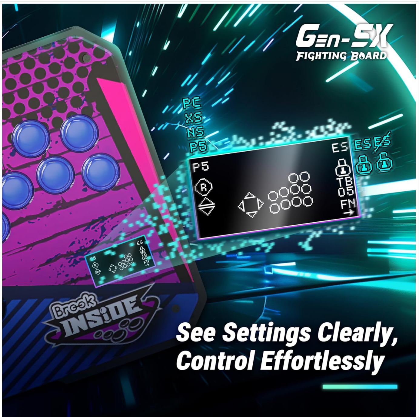
Figure 2.5: A custom fight stick integrated with an OLED display, which allows users to clearly view and control various settings and configurations.