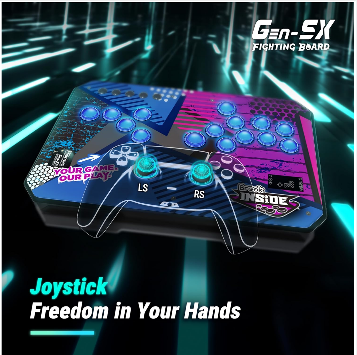
Figure 2.6: A custom fight stick with a transparent overlay of a traditional joystick, highlighting the board's flexibility in supporting various input methods, including joystick control.