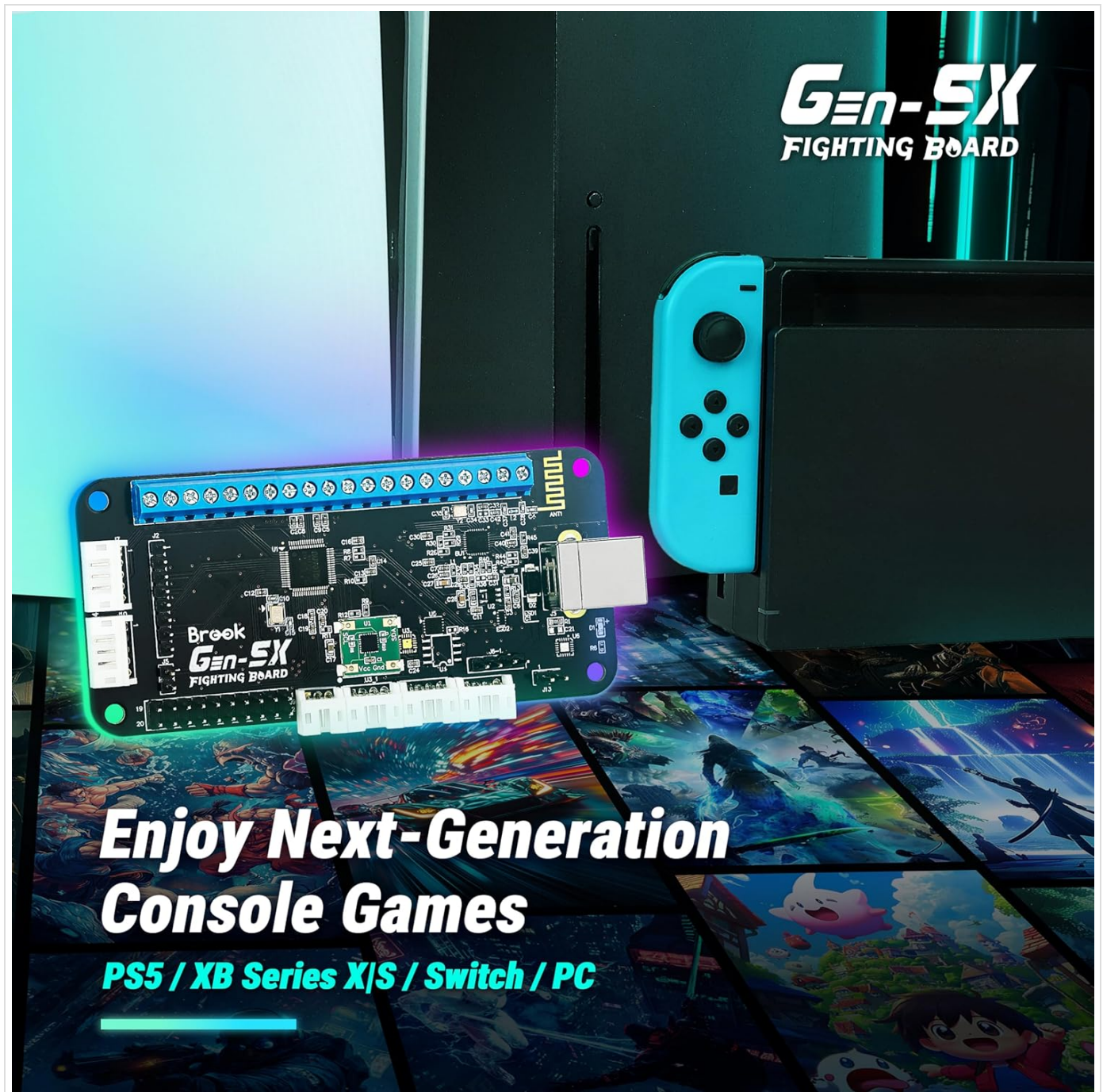
Figure 2.3: The Gen5X Fighting Board shown alongside various gaming consoles, illustrating its broad compatibility with PS5, Xbox Series X|S, Nintendo Switch, and PC.