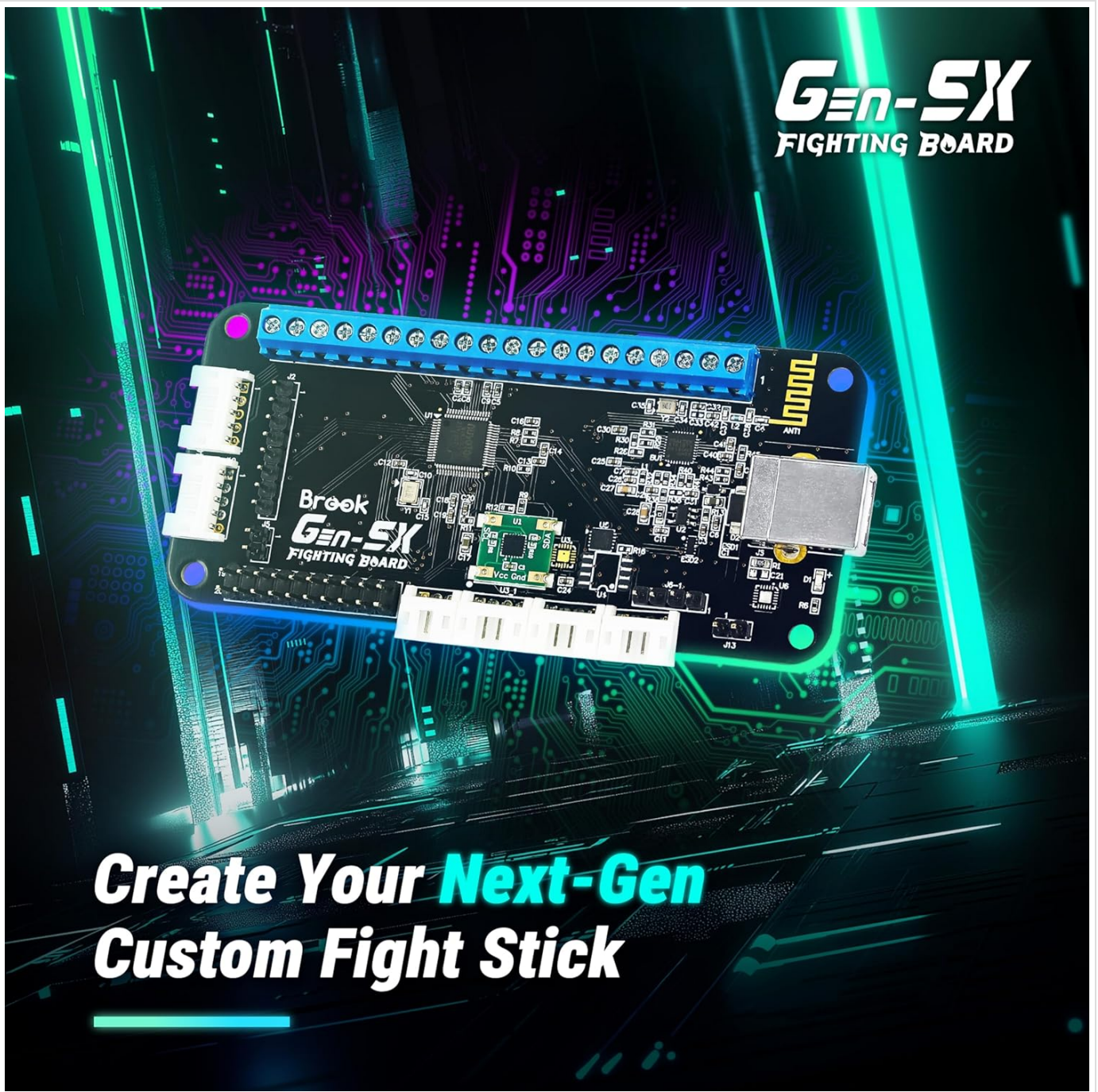
Figure 2.2: The Gen5X Fighting Board positioned against a circuit board background, emphasizing its role in creating custom fight sticks for next-generation gaming.