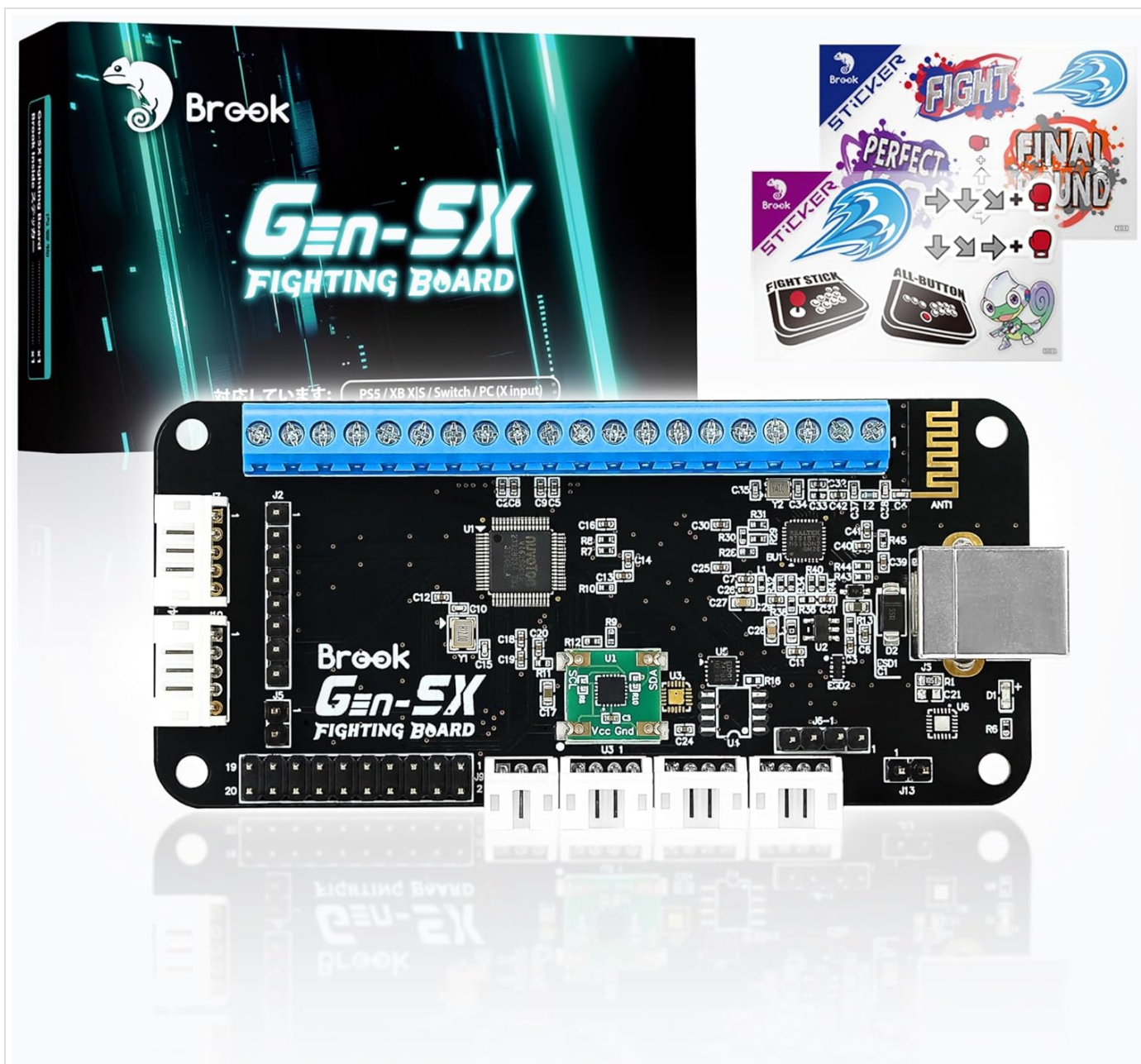
Figure 2.1: The Brook Gaming Gen5X Fighting Board, including its packaging and accompanying stickers. This image displays the main components of the board and its overall presentation.