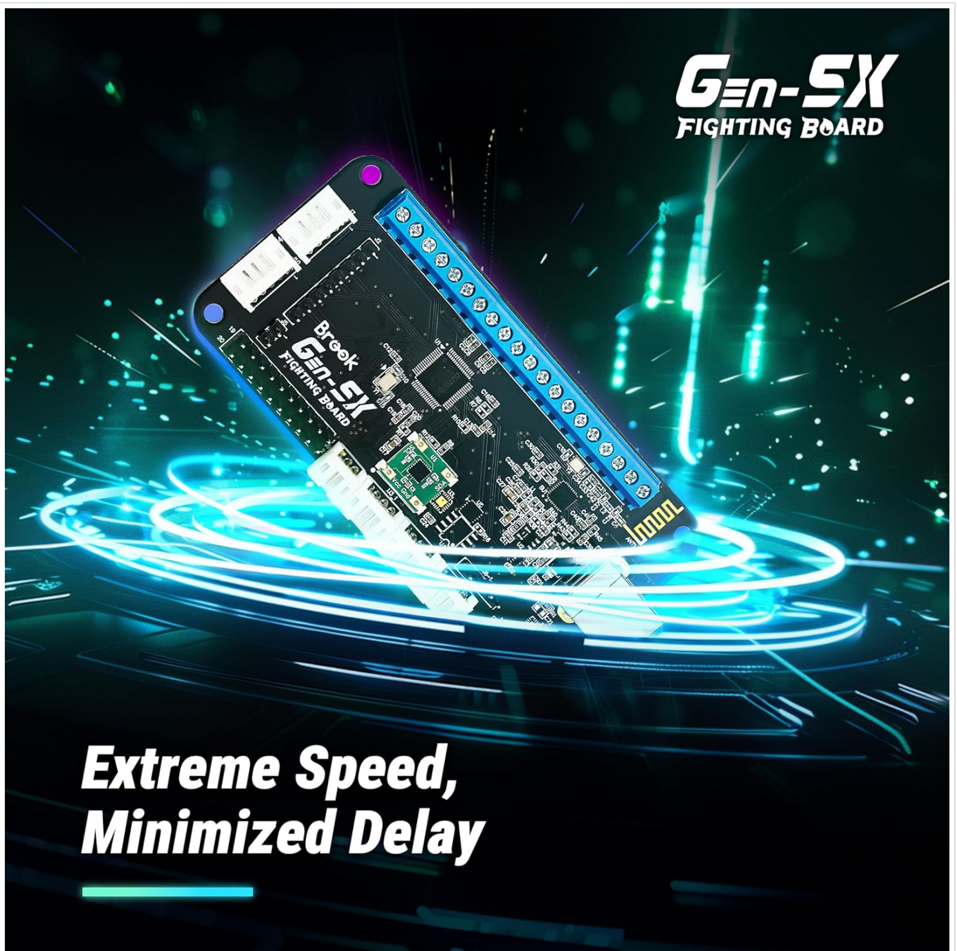
Figure 2.7: The Gen5X Fighting Board depicted with abstract speed lines, symbolizing its capability for extreme speed and minimized input delay in gaming.