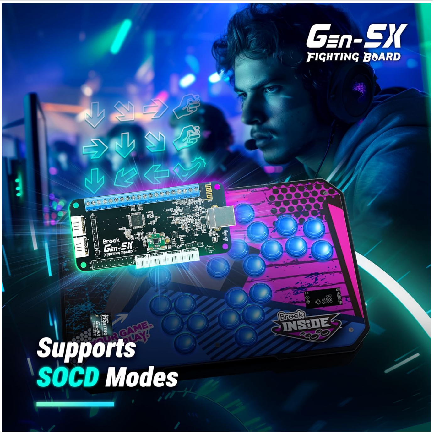
Figure 2.8: A custom fight stick with an overlay illustrating different SOCD (Simultaneous Opposing Cardinal Directions) cleaning modes, indicating the board's support for precise input handling in fighting games.