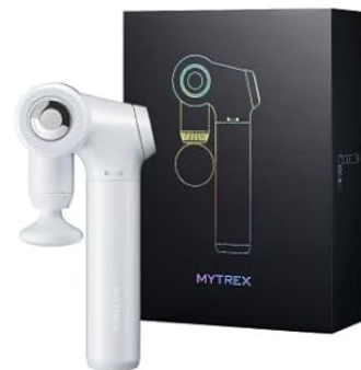
Image: Contents of the MYTREX REBIVE EX FIT package, showing the massage gun, various attachments, charging cable, and storage pouch.