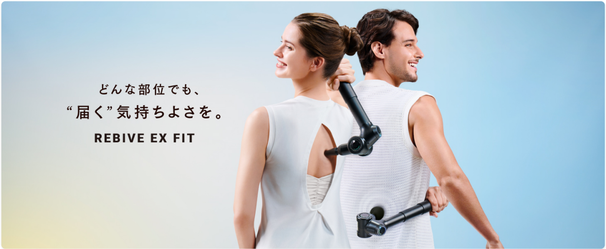
Image: Two individuals using the MYTREX REBIVE EX FIT on their upper and lower backs, showcasing the device's ability to reach various body parts.

Image: A user demonstrating the MYTREX REBIVE EX FIT being used on the shoulder and neck area, highlighting its ergonomic design.