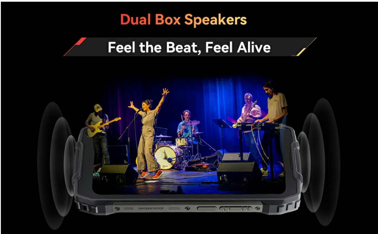
Figure 9: Image depicting the Blackview BV7300 with sound waves emanating from its dual box speakers, illustrating its audio capabilities.