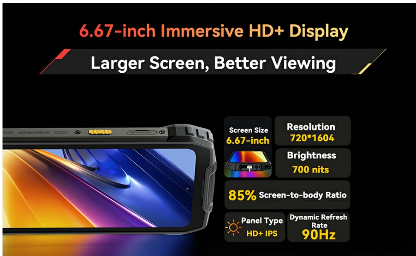
Figure 2: Details of the 6.67-inch HD+ IPS display, showing resolution, brightness, screen-to-body ratio, panel type, and dynamic refresh rate.

The 6.67-inch HD+ IPS display offers a resolution of 1280x720 pixels and a 90Hz dynamic refresh rate for smooth visuals. Navigate the Android 14 operating system using touch gestures.