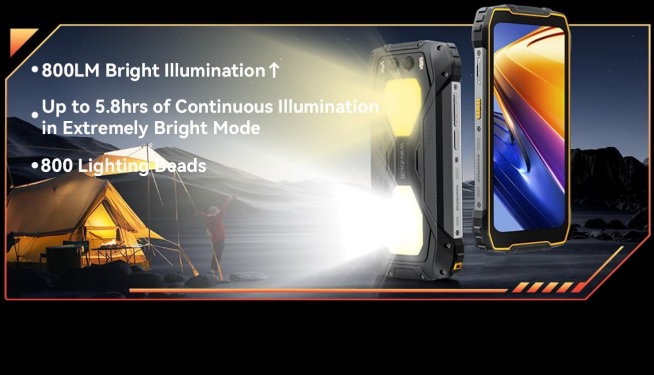
Figure 5: The Blackview BV7300 with its dual 800 lumen camping lights activated, providing strong illumination.

Featuring two built-in camping lights with 800 lighting beads, BV7300 redefines clarity and illumination. Whether you're setting up camp or navigating the dark, BV7300 always lights up your way ahead.