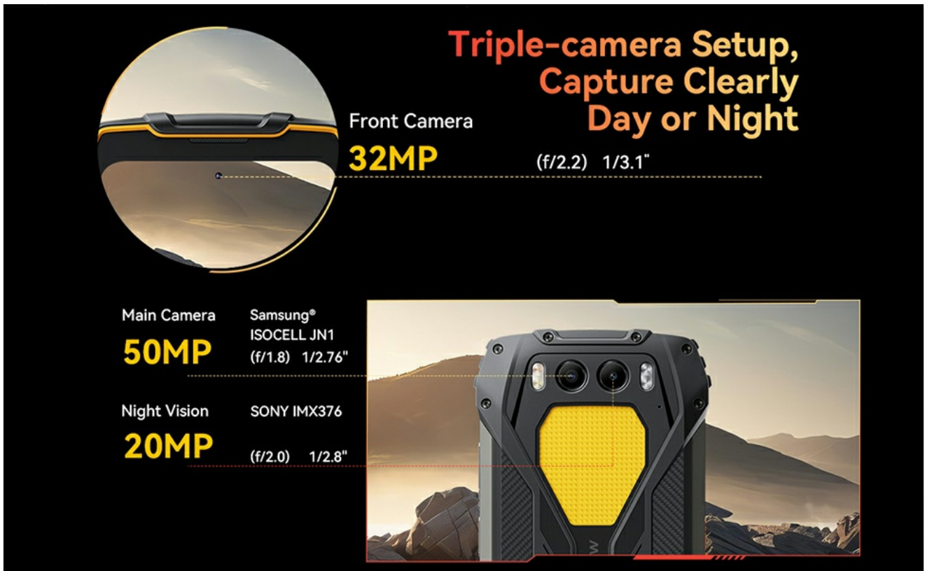
Figure 4: Diagram illustrating the Blackview BV7300's triple camera setup, including 32MP front, 50MP main, and 20MP night vision cameras.