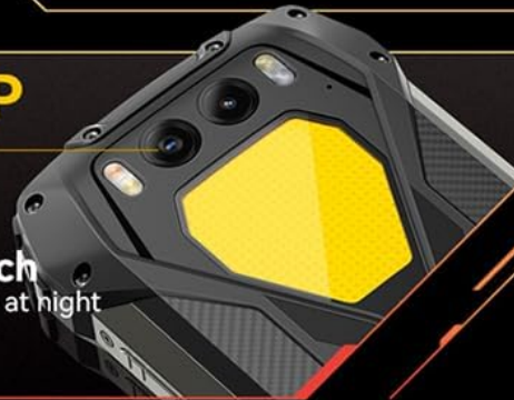
Figure 3: Close-up of the Blackview BV7300's rear camera module, featuring the 50MP main camera.