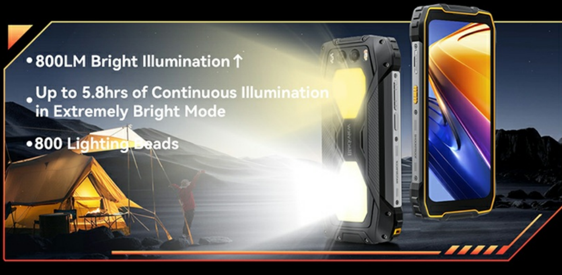
Figure 6: Illustration detailing the dual super-bright camping lights, highlighting 800LM brightness, up to 5.8 hours of continuous illumination in extremely bright mode, and 800 lighting beads.

The BV7300 features two powerful 800 lumen LED camping lights on its rear. These lights offer three lighting modes and three brightness levels. To activate and adjust the lights, use the dedicated function button or access the quick settings panel.