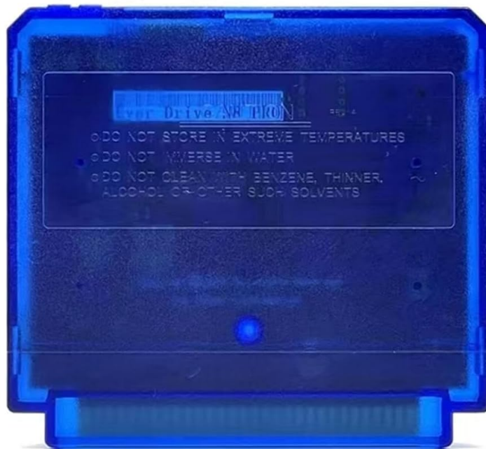
Image: Back of the N8 Plus FC Game Cartridge with caution text.

To clean the cartridge, gently wipe the exterior with a soft, dry cloth. For the connector pins, use a cotton swab lightly dampened with isopropyl alcohol, then allow to dry completely before reinserting into the console.