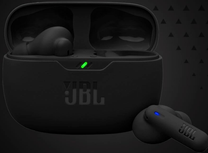
Figure 6: Earbuds with 4 Mics for Clear Calls