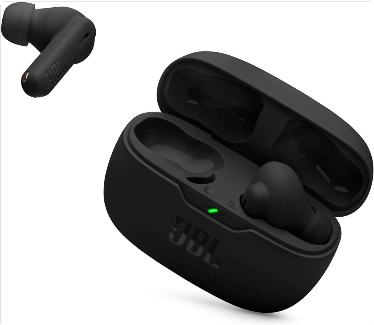
Figure 1: JBL Vibe Beam 2 Earbuds and Charging Case (Black)