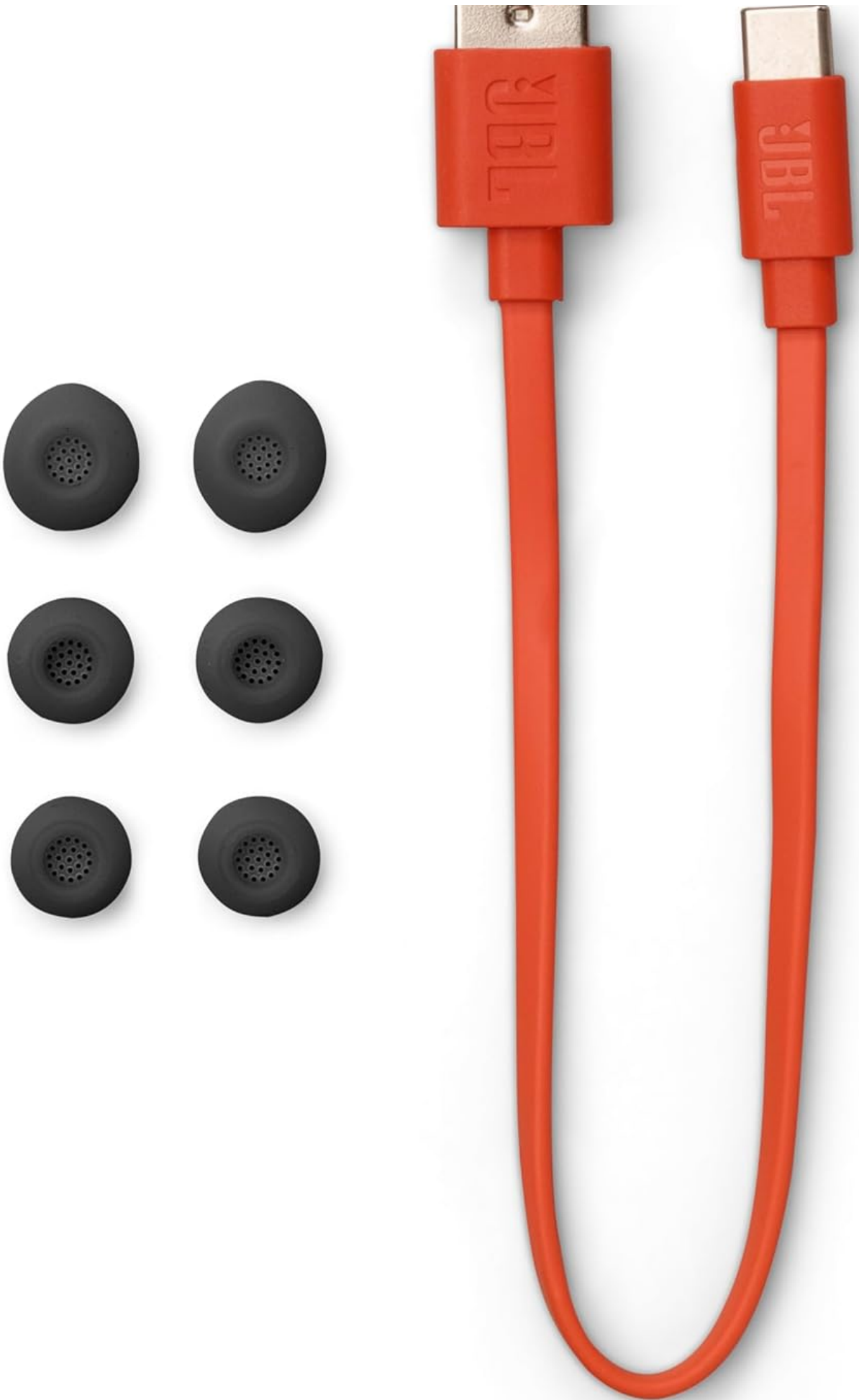
Figure 3: Included Accessories (USB-C Cable and Ear Tips)