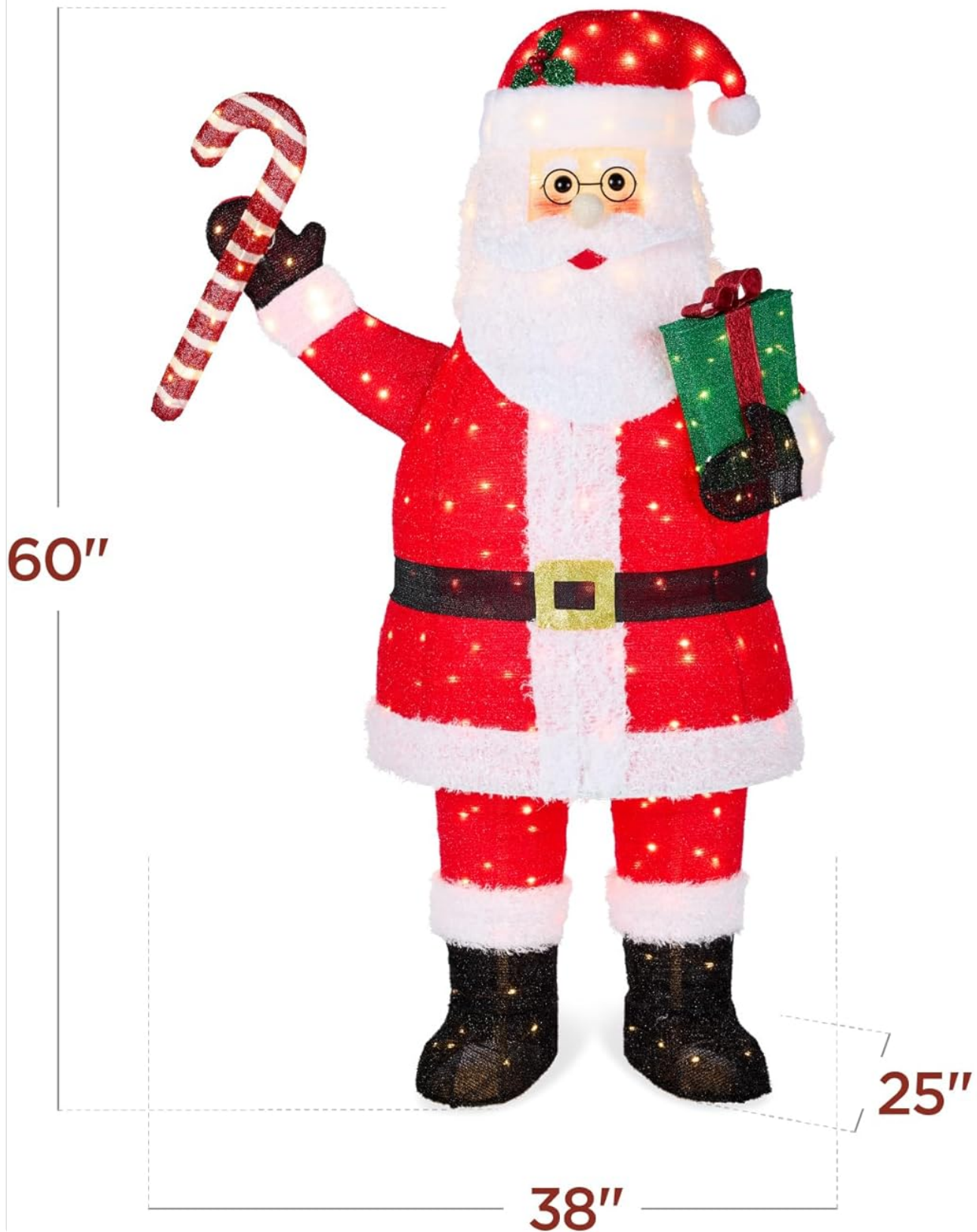
Image: Visual representation of the Santa's dimensions.