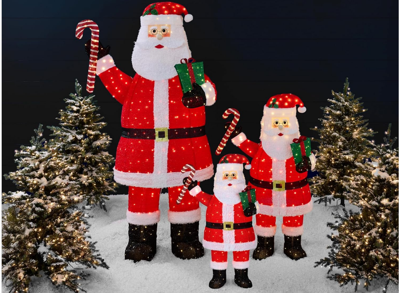
Image: Details on the 250 LED lights, including twinkling features on the candy cane and gift.

These jolly gentlemen, available in 3ft, 5ft, or 8ft sizes, will brighten your holiday home