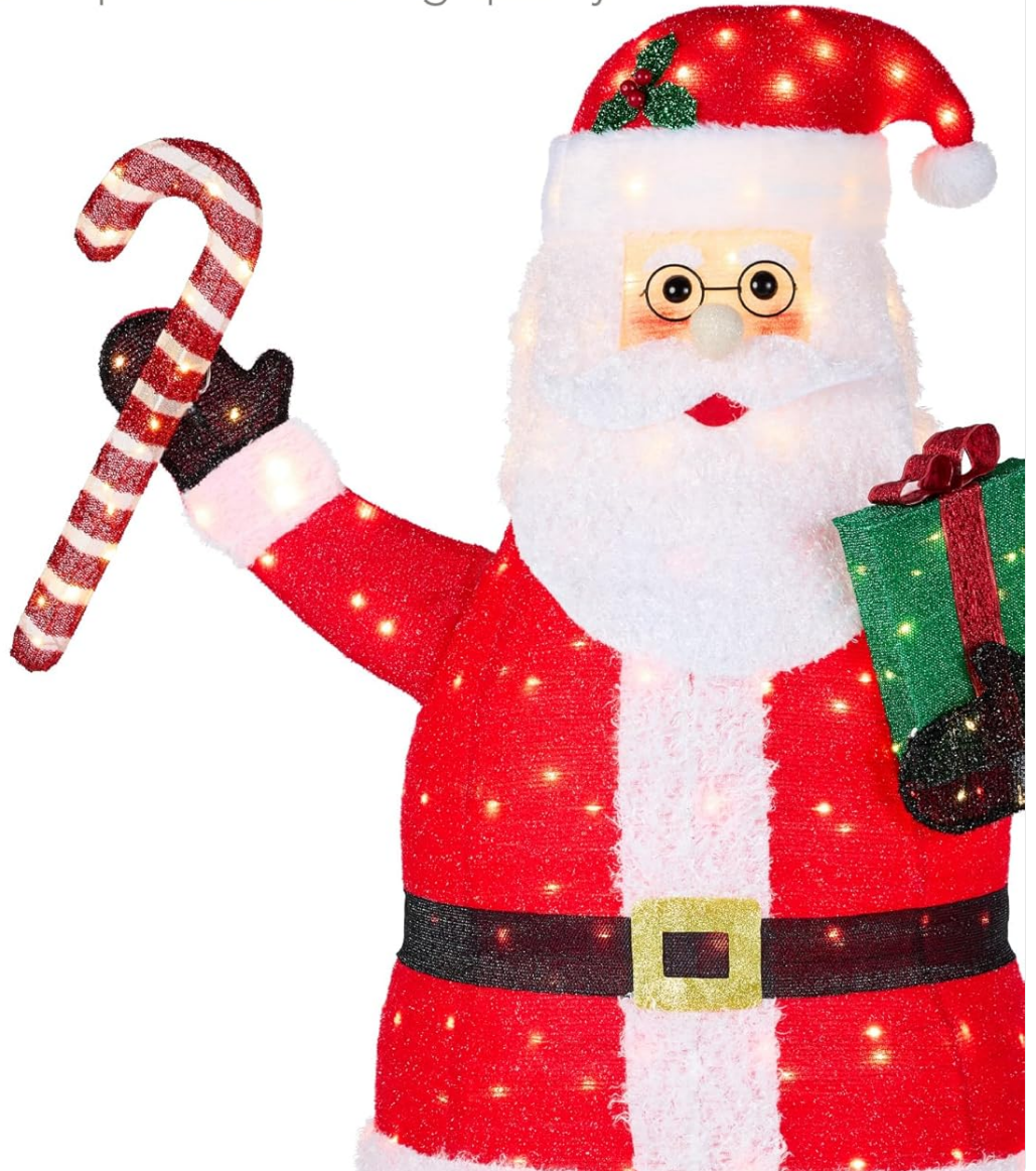
Image: Close-up of the Santa's classic details, including wire-frame glasses and a holly leaf accent.