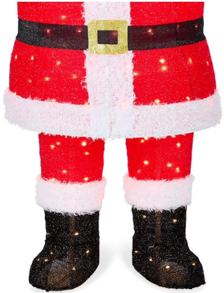
Image: The 5ft Lighted Pop-Up Santa, showcasing its illuminated design with a candy cane and gift box.