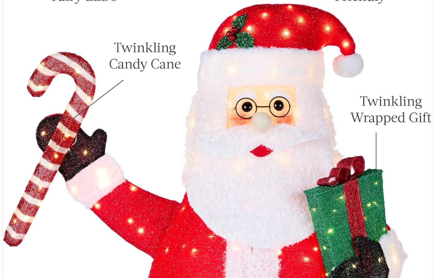
Image: Information on the weather-friendly design and durable materials.