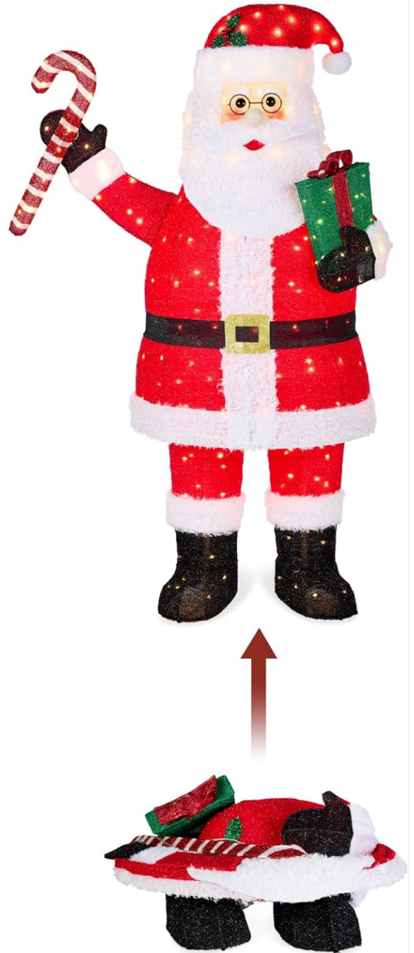
Image: Visual guide for the assembly process, illustrating the three main steps.

Attach the candy cane, giftbox, and glasses