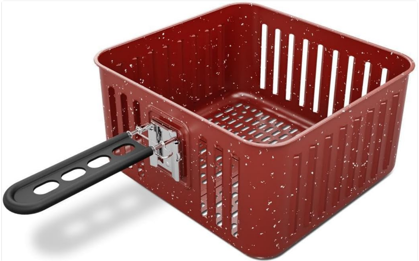
Figure 3: A red non-stick air fryer basket with a black handle, designed for optimal air circulation during cooking. This accessory is dishwasher safe for easy cleaning.