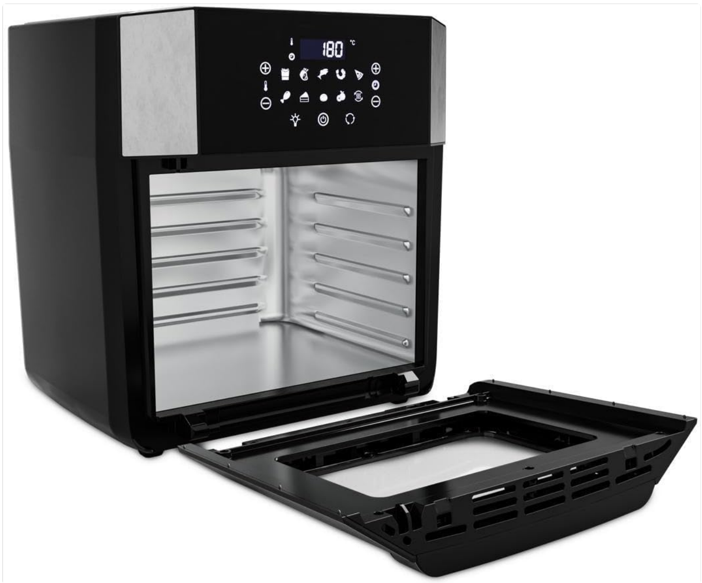
Figure 1: Britânia BAF16A Air Fryer Oven with its removable door detached, showcasing the interior and rack slots. This view highlights the ease of access for cleaning and loading.