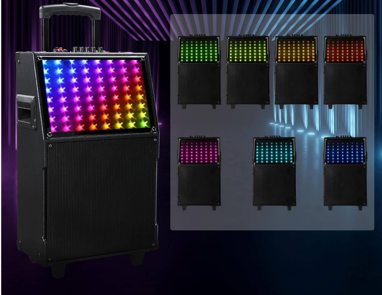
Image: The Ktaxon Karaoke Machine showcasing several dynamic LED lighting effects.

With dynamic lighting effects for an enhanced audio experience