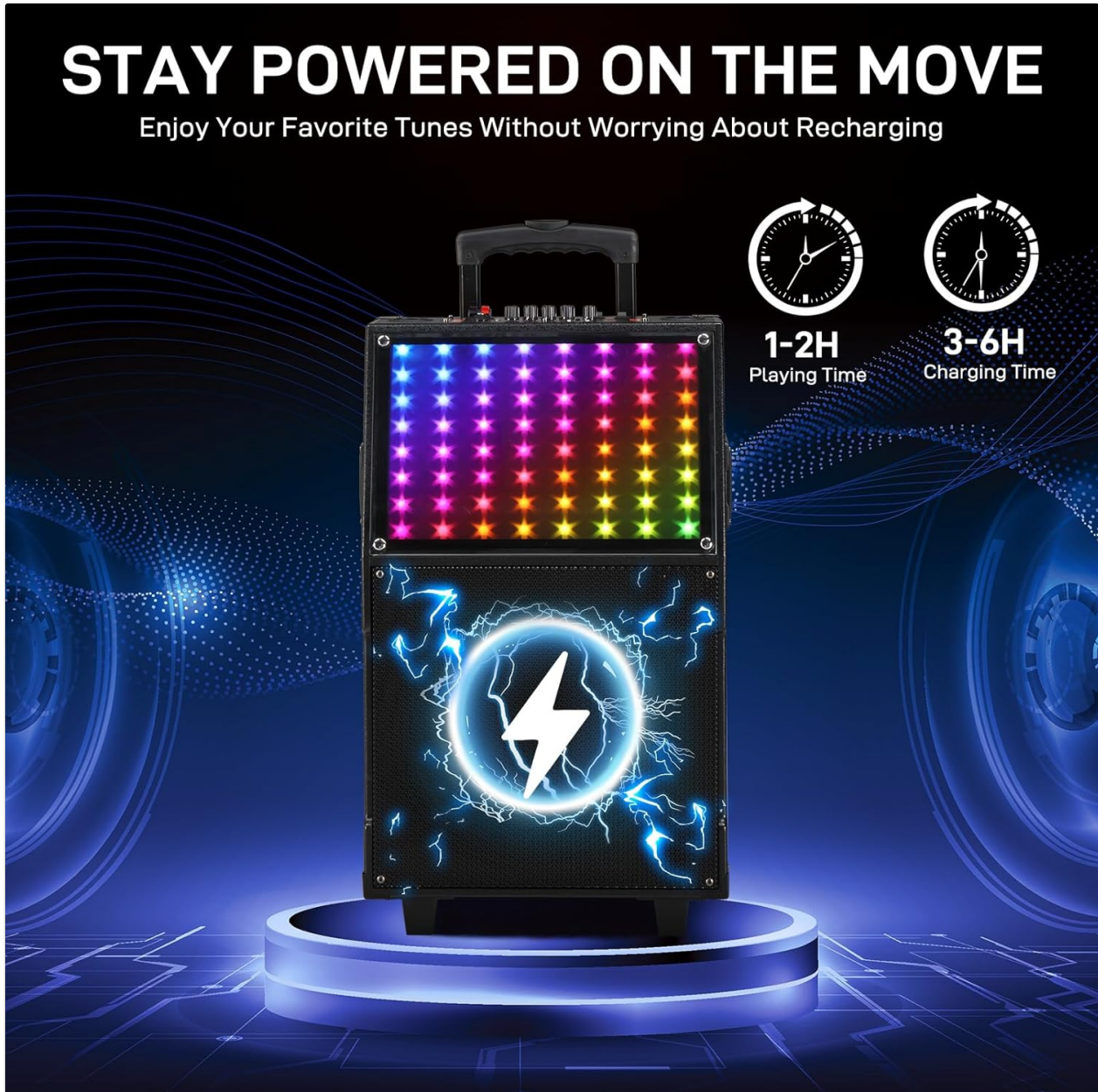
Image: Visual representation of charging and playing times for the Ktaxon Karaoke Machine.

Before first use, fully charge the karaoke machine. Connect the power cord to the unit's power input and then to a standard electrical outlet. The charging indicator will illuminate. A full charge typically takes 3-6 hours and provides approximately 1-2 hours of playback time.