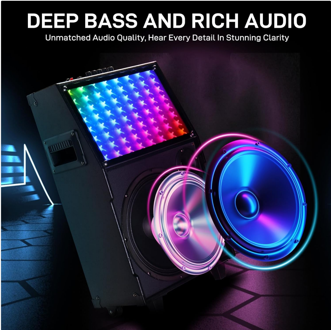
Image: Front view of the Ktaxon Karaoke Machine highlighting the speaker and LED light display.

The front panel features the main speaker grille and dynamic LED lights that enhance the audio experience.