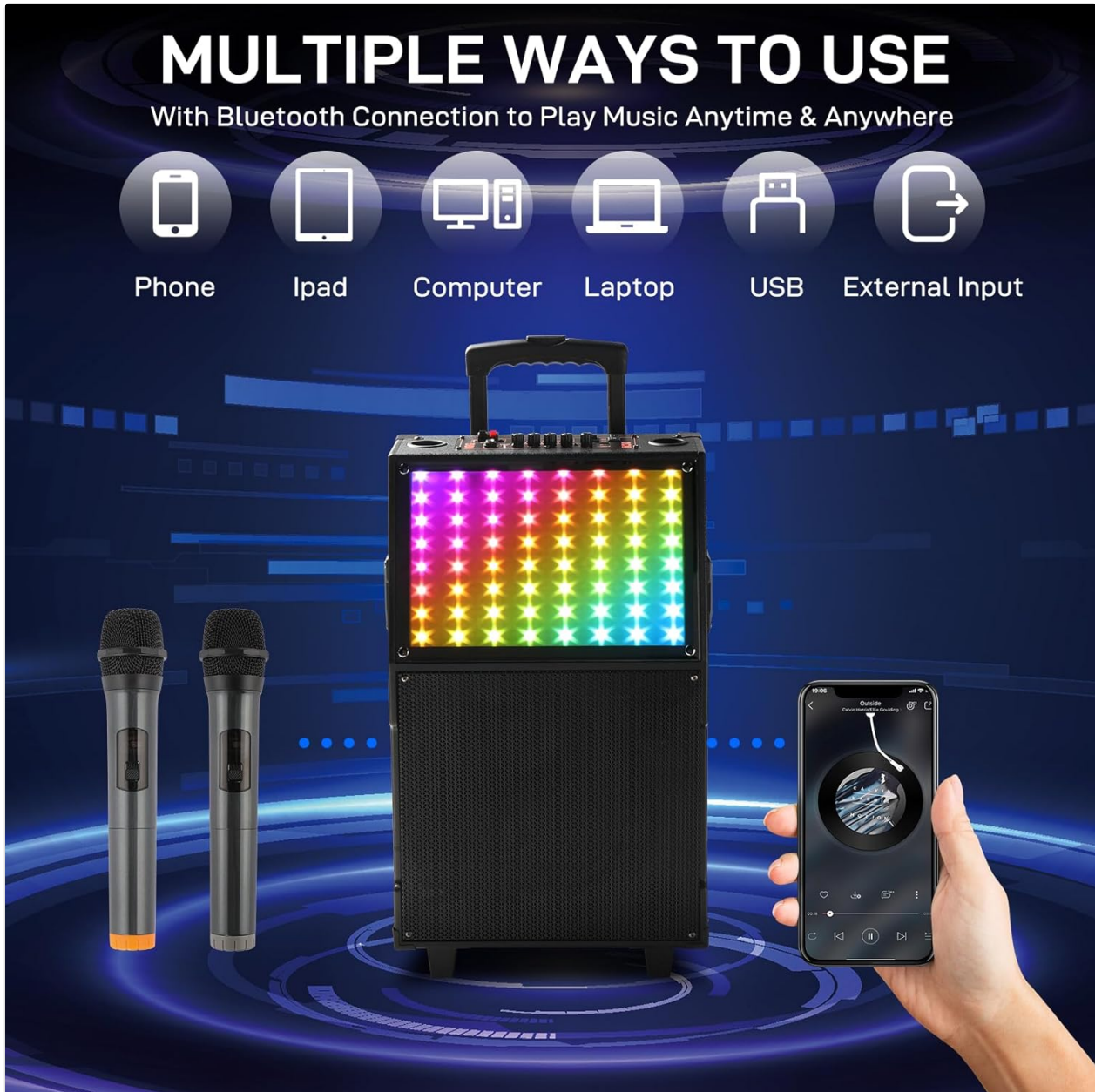
Image: Diagram illustrating multiple ways to connect to the Ktaxon Karaoke Machine, including Bluetooth, USB, and AUX.