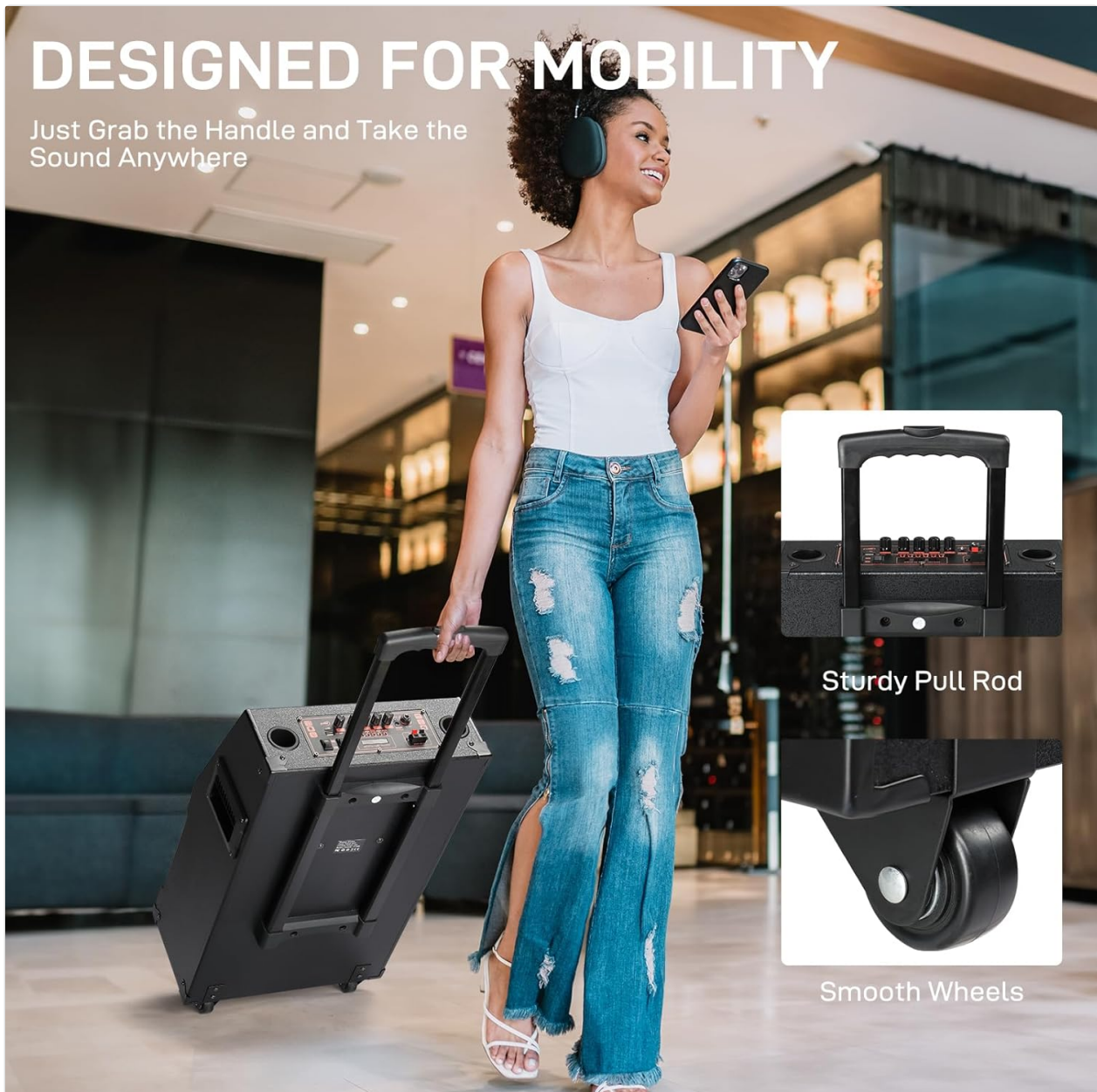
Image: A person demonstrating the portability of the Ktaxon Karaoke Machine, utilizing its retractable handle

The unit is designed for easy transport with a retractable handle and durable wheels.