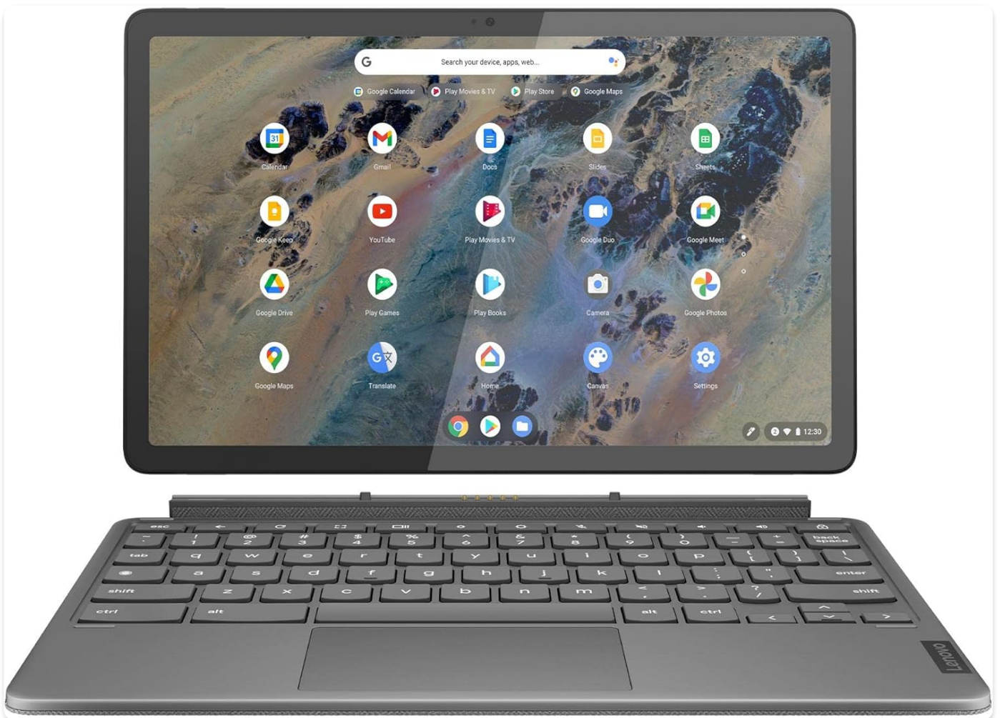
Image: Front view of the Lenovo IP Duet 3 Chromebook with the detachable keyboard attached, displaying the Chrome OS desktop.