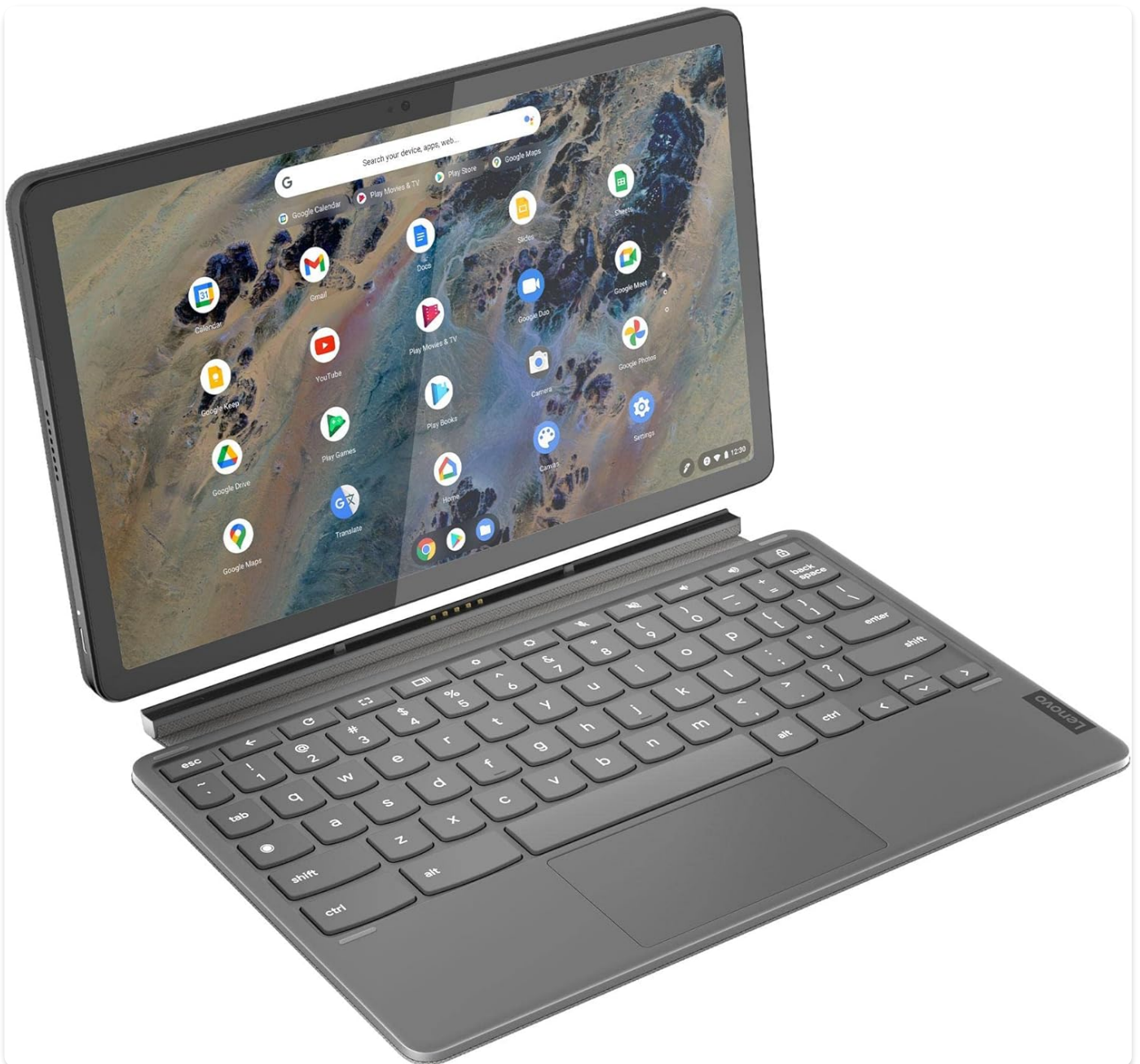
Image: Angled view of the Lenovo IP Duet 3 Chromebook with the detachable keyboard attached, showcasing its laptop-like configuration.