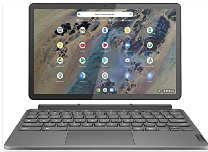
Image: Front view of the Lenovo IP Duet 3 Chromebook in tablet mode, without the keyboard, displaying the Chrome OS interface.