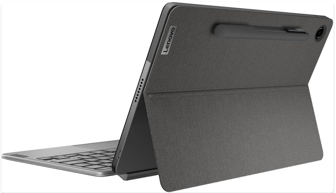
Image: Side view of the Lenovo IP Duet 3 Chromebook, highlighting the USB-C ports and the kickstand mechanism.