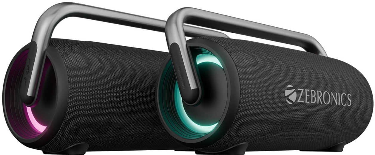
Image: Two ZEBRONICS AXON 100 speakers demonstrating the True Wireless Stereo (TWS) function, providing a wider soundstage.