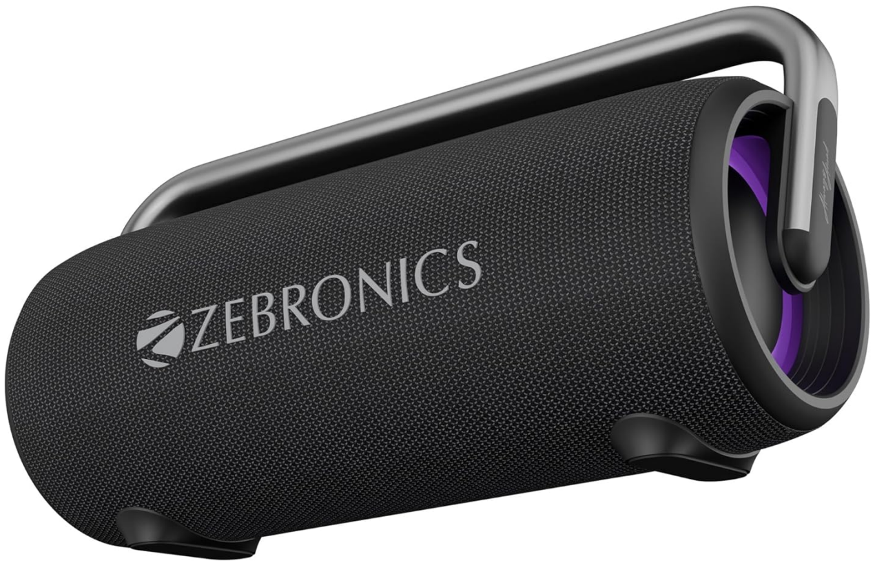
Image: The ZEBRONICS AXON 100 Portable Party Bluetooth Speaker, showcasing its sleek design and integrated carry handle.