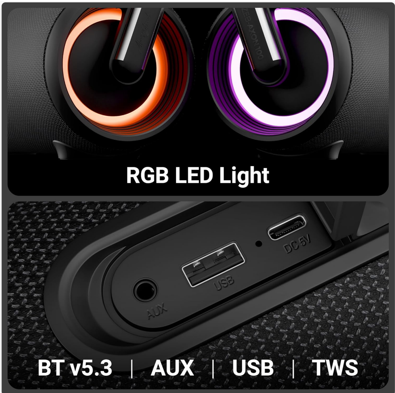
Image: A close-up view of the speaker's control buttons and connectivity ports, including Bluetooth v5.3, AUX, USB, and TWS functionality.

Familiarize yourself with the buttons for power, volume, media playback, EQ modes, and RGB light control. The rear panel houses the AUX, USB, and DC 5V charging ports.