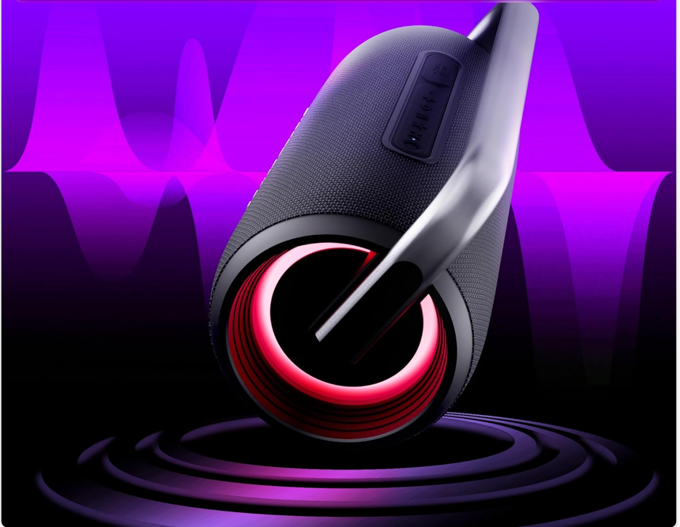
Image: The speaker displaying its RGB lights, with text indicating the three available EQ modes: Sound Monster, Equalizer Mode, and Vocal Enhance.

Sound Monster | Equalizer Mode | Vocal Enhance