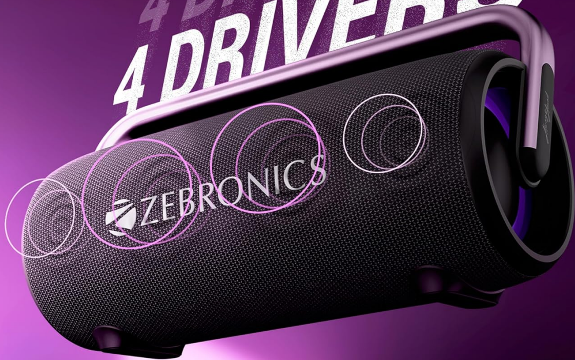
Image: Diagram illustrating the speaker's internal configuration with two 7.62cm full-range drivers and two 3.81cm tweeters.