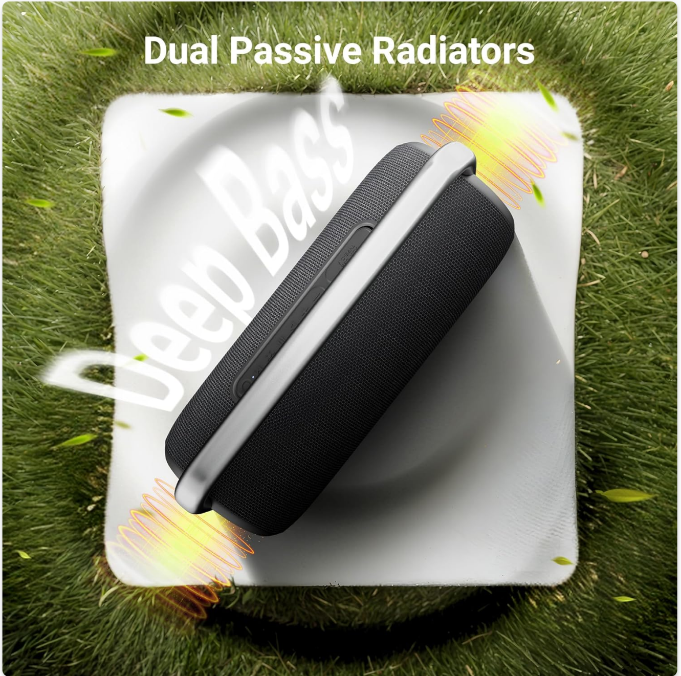
Image: The speaker positioned to highlight its dual passive radiators, which contribute to enhanced deep bass.

Enhance your audio experience with 3 EQ modes: