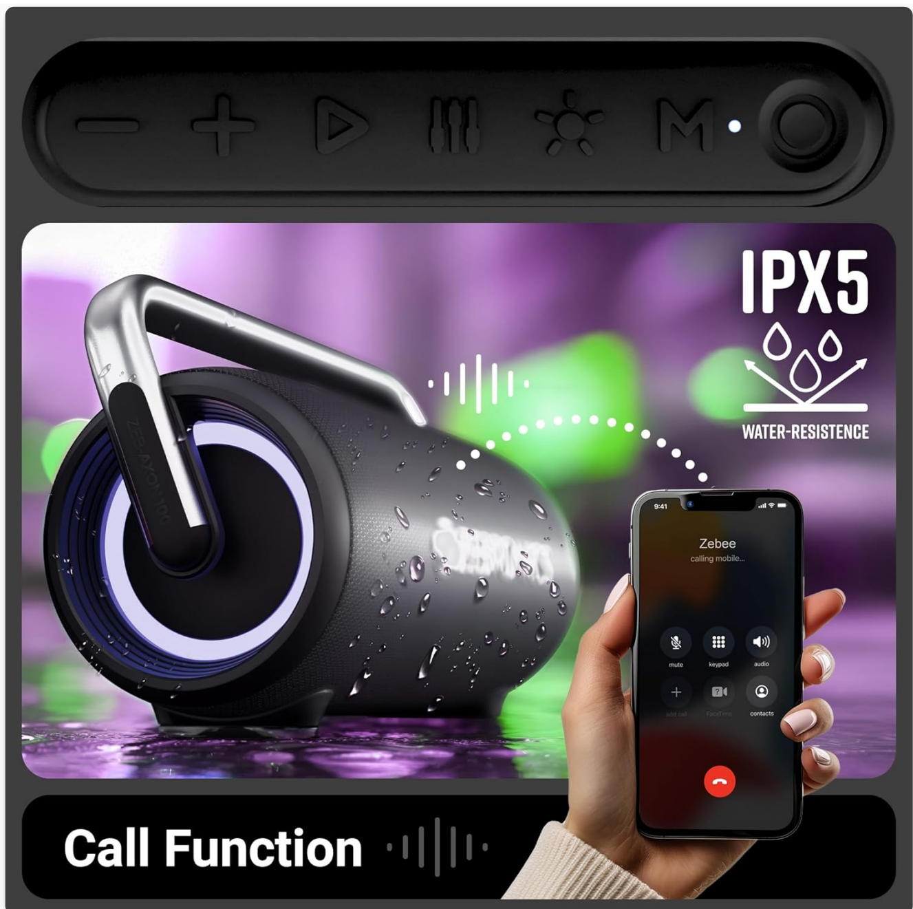
Image: The speaker next to a smartphone displaying an incoming call, illustrating its call function and highlighting its IPX5 water-resistance rating.