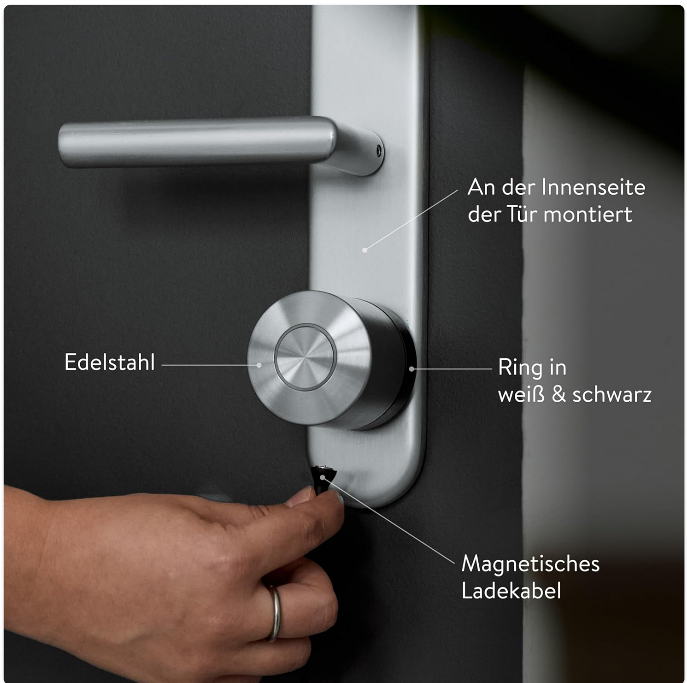
Image: The Nuki Smart Lock Ultra mounted on the inside of a door, with a hand connecting the magnetic charging cable to the bottom of the device. Labels indicate the stainless steel finish, the white and black ring, and the magnetic charging cable.