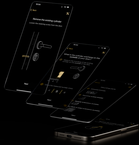
Image: Screenshots of the Nuki app demonstrating the step-by-step installation guide for the Universal Cylinder and Smart Lock Ultra, highlighting the ease of self-installation.

Die Nuki App führt Schritt-für-Schritt durch die Installation des Universal Cylinder und des Smart Lock Ultra und ermöglicht dadurch einfache Installation in weniger als 15 Minuten.