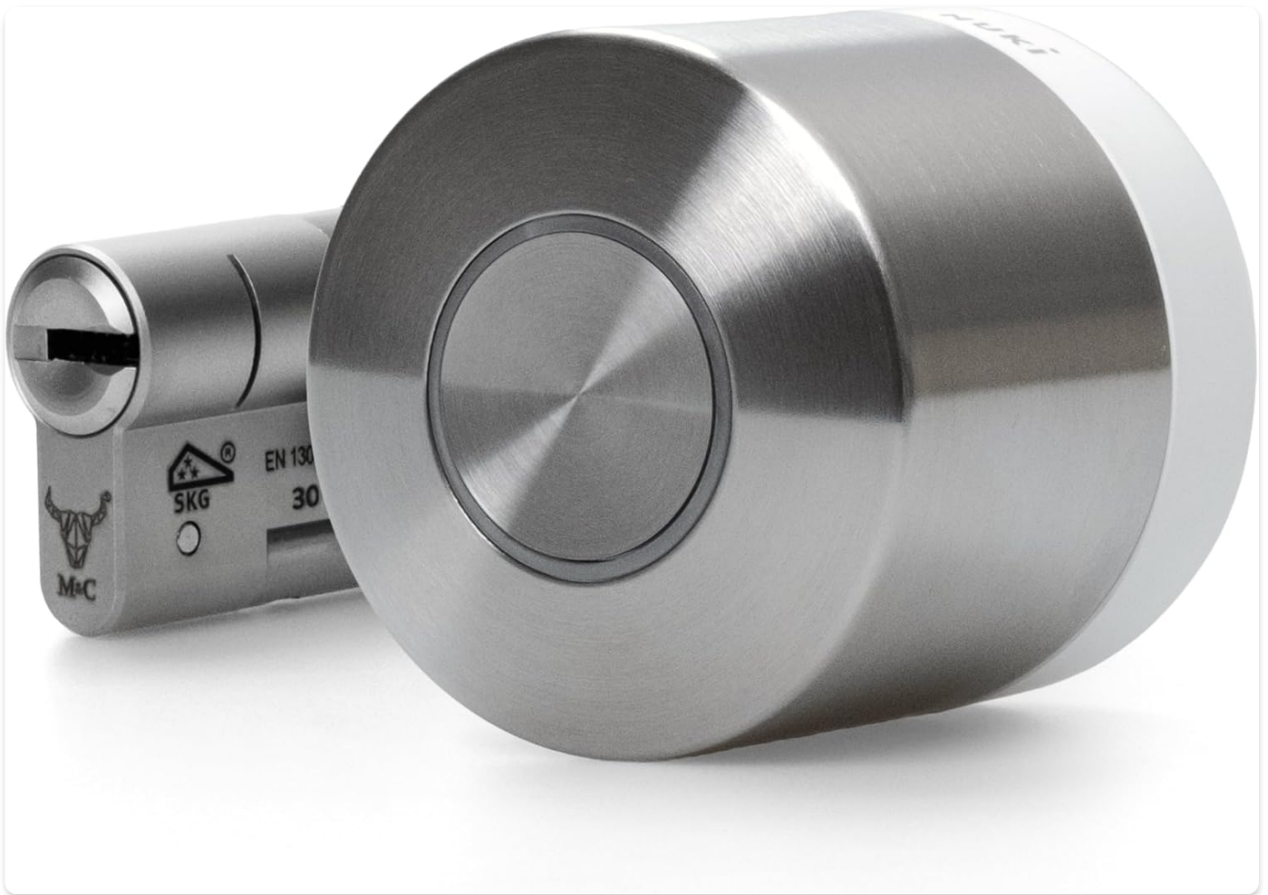
Image: The Nuki Smart Lock Ultra, a sleek, cylindrical device, shown alongside its universal security cylinder. The lock features a brushed metal finish and a clean, modern design.