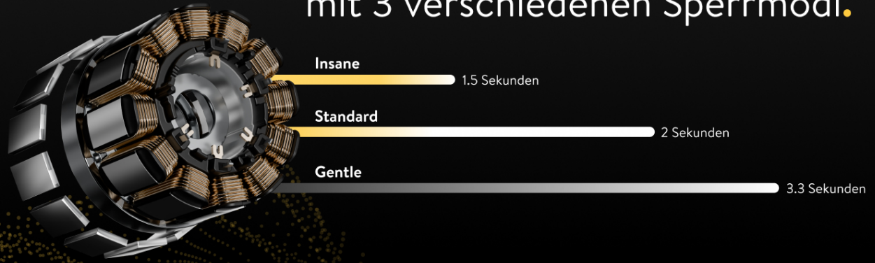
Image: A diagram illustrating the Nuki brushless motor and its three distinct locking speed modes: Insane (1.5 seconds), Standard (2 seconds), and Gentle (3.3 seconds).