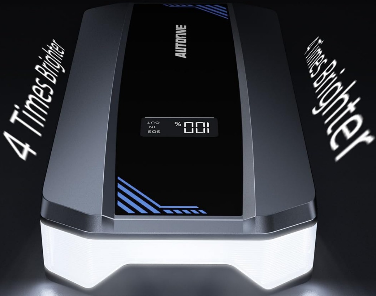
Image: The AUTOONE jump starter displaying its charge percentage on the LCD screen, indicating readiness for use or charging status.