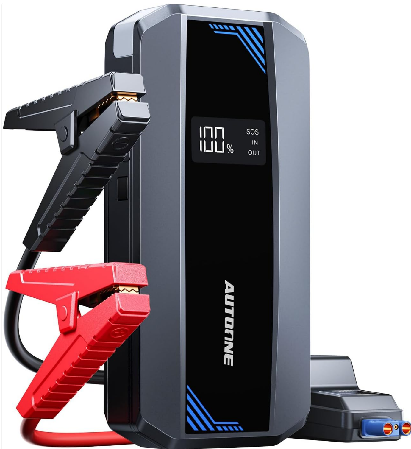
Image: The AUTOONE Car Jump Starter JS1M unit with its smart jumper cables, showcasing its compact design and ready-to-use appearance.