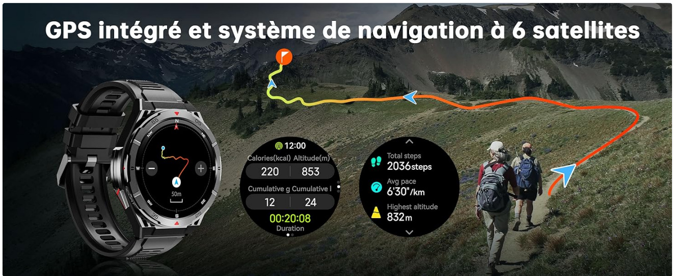
Image: The OUKITEL BT12 smartwatch showing GPS tracking and route mapping for outdoor adventures.

Equipped with a Dual-Band-6-Satellite positioning system, the BT12 provides precise GPS tracking and route guidance for outdoor activities. It also includes a built-in compass, altimeter, and barometer for comprehensive navigation data.