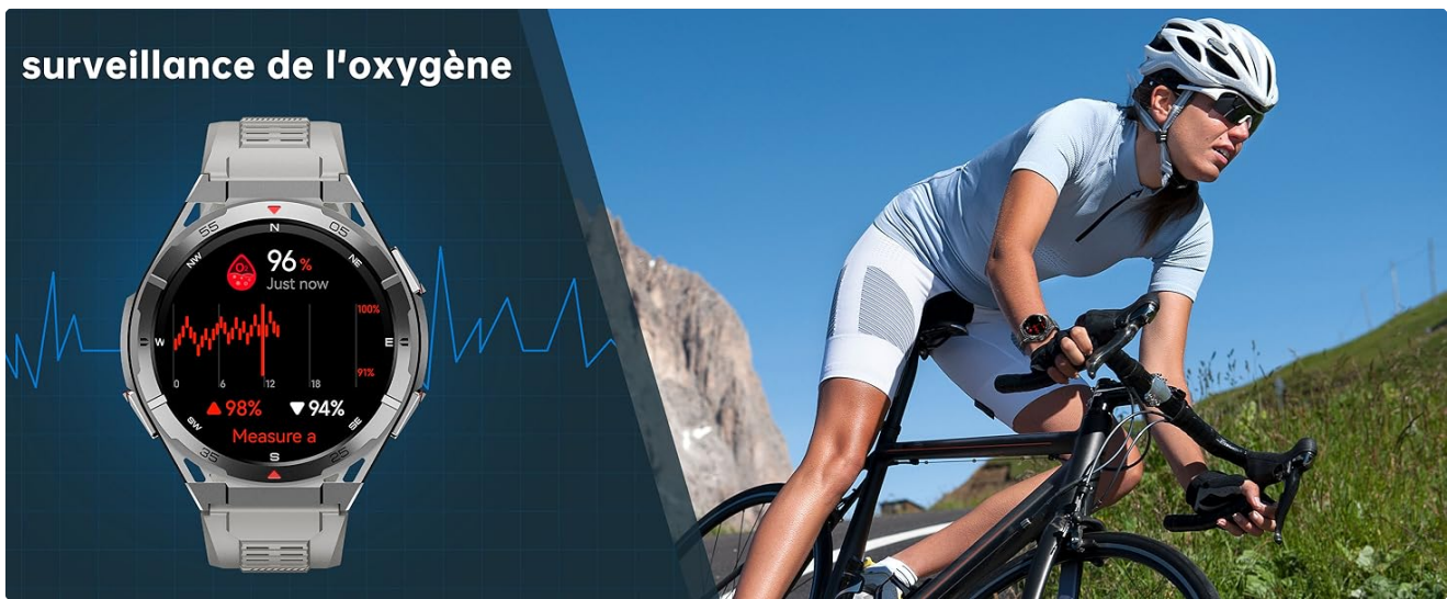
Image: The OUKITEL BT12 smartwatch showing blood oxygen saturation (SpO2) monitoring.