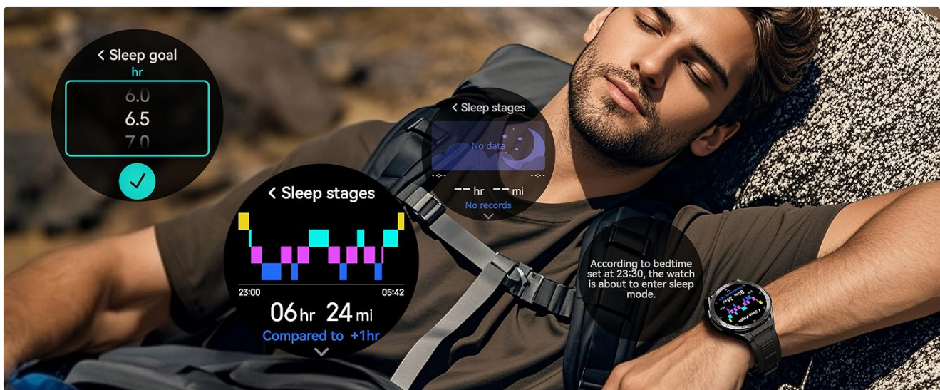
Image: The OUKITEL BT12 smartwatch providing detailed sleep stage analysis.