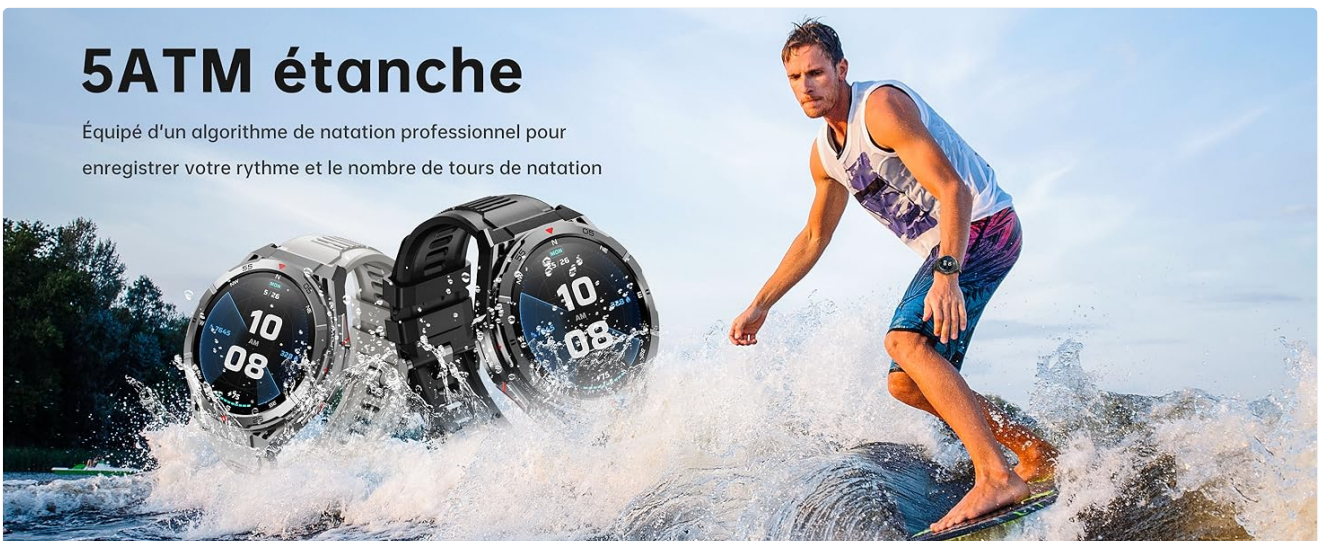
Image: The OUKITEL BT12 smartwatch demonstrating its 5ATM water resistance, suitable for swimming.

Équipé d'un algorithme de natation professionnel pour enregistrer votre rythme et le nombre de tours de natation