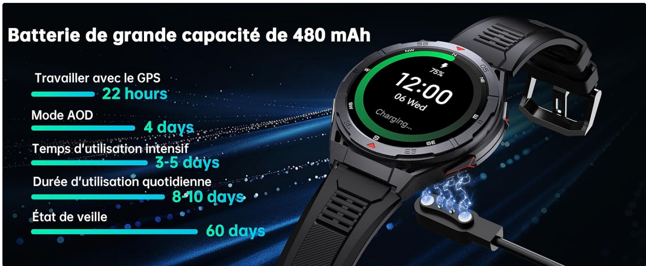
Image: The OUKITEL BT12 smartwatch illustrating its impressive battery life under different operating conditions.

With a 480 mAh battery, the watch offers extended usage: up to 22 hours with GPS, 4 days in Always-On Display (AOD) mode, 3-5 days with intensive use, 8-10 days with daily use, and up to 60 days on standby.