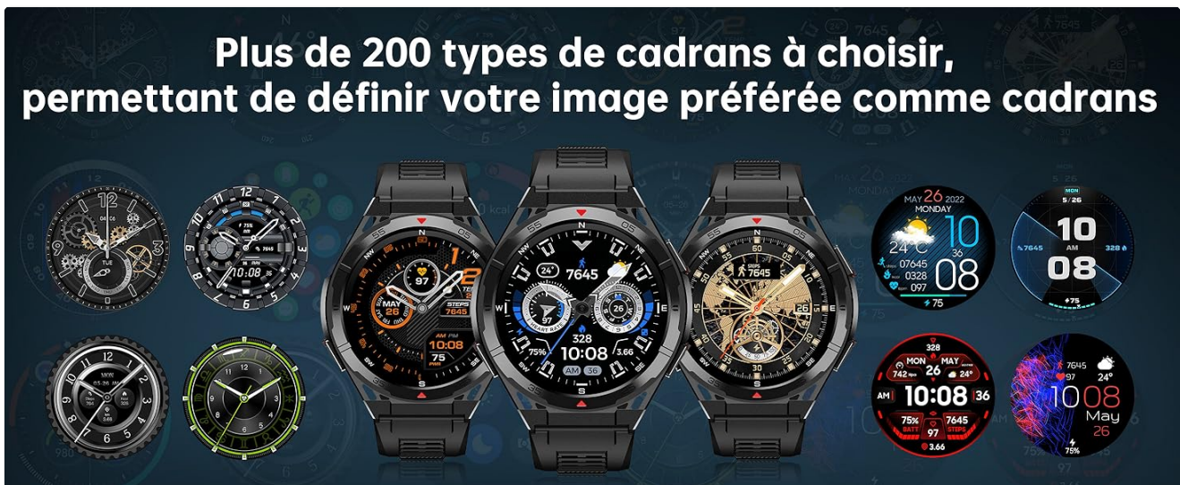
Image: The OUKITEL BT12 smartwatch showcasing a selection of its customizable watch faces.

Choose from over 200 pre-installed watch faces or create your own custom faces using photos from your smartphone via the companion app.