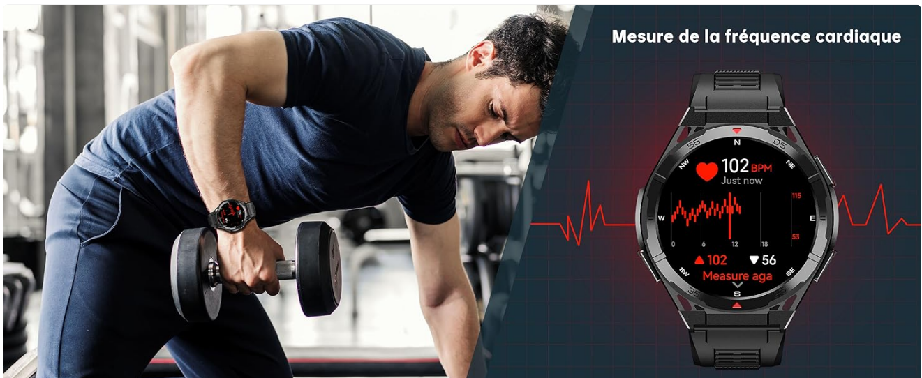
Image: The OUKITEL BT12 smartwatch displaying real-time heart rate monitoring during a workout.

The smartwatch offers 24-hour health monitoring, including heart rate, blood oxygen (SpO2), and sleep tracking. It supports over 150 sports modes for detailed fitness data.