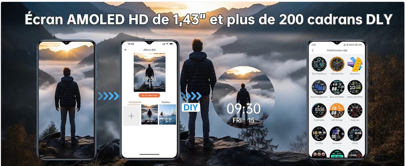
Image: The OUKITEL BT12 smartwatch showcasing its 1.43-inch AMOLED HD display and options for DIY watch faces.