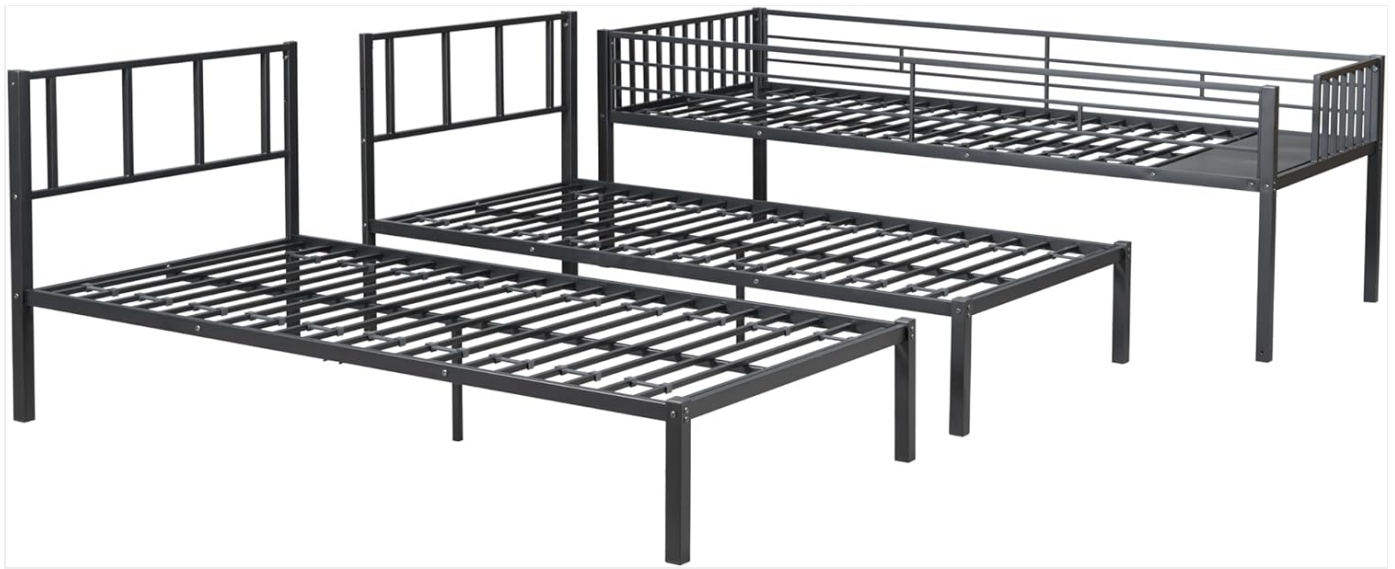
Image 5.2: The PVWIİK bunk bed reconfigured into three separate twin platform beds.