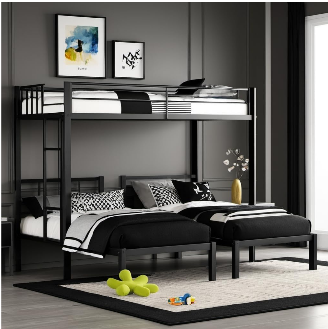
Image 1.1: The PVWIIK Metal Twin Triple Bunk Bed fully assembled, showcasing its space-saving design.