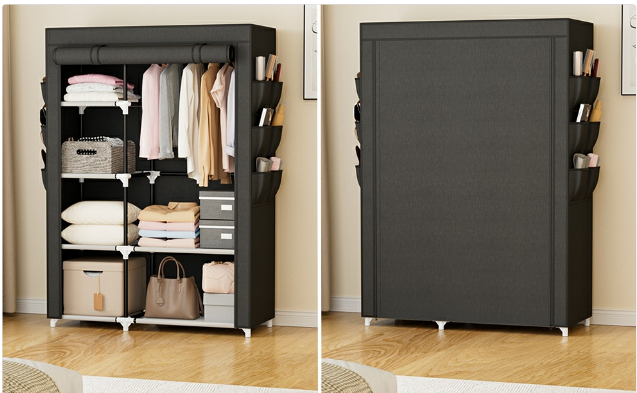
Figure 2: Installation of the fabric cover onto the wardrobe frame.