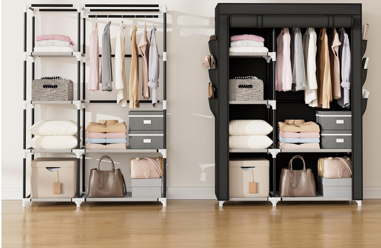
Figure 6: VTRIN's enhanced durability features.