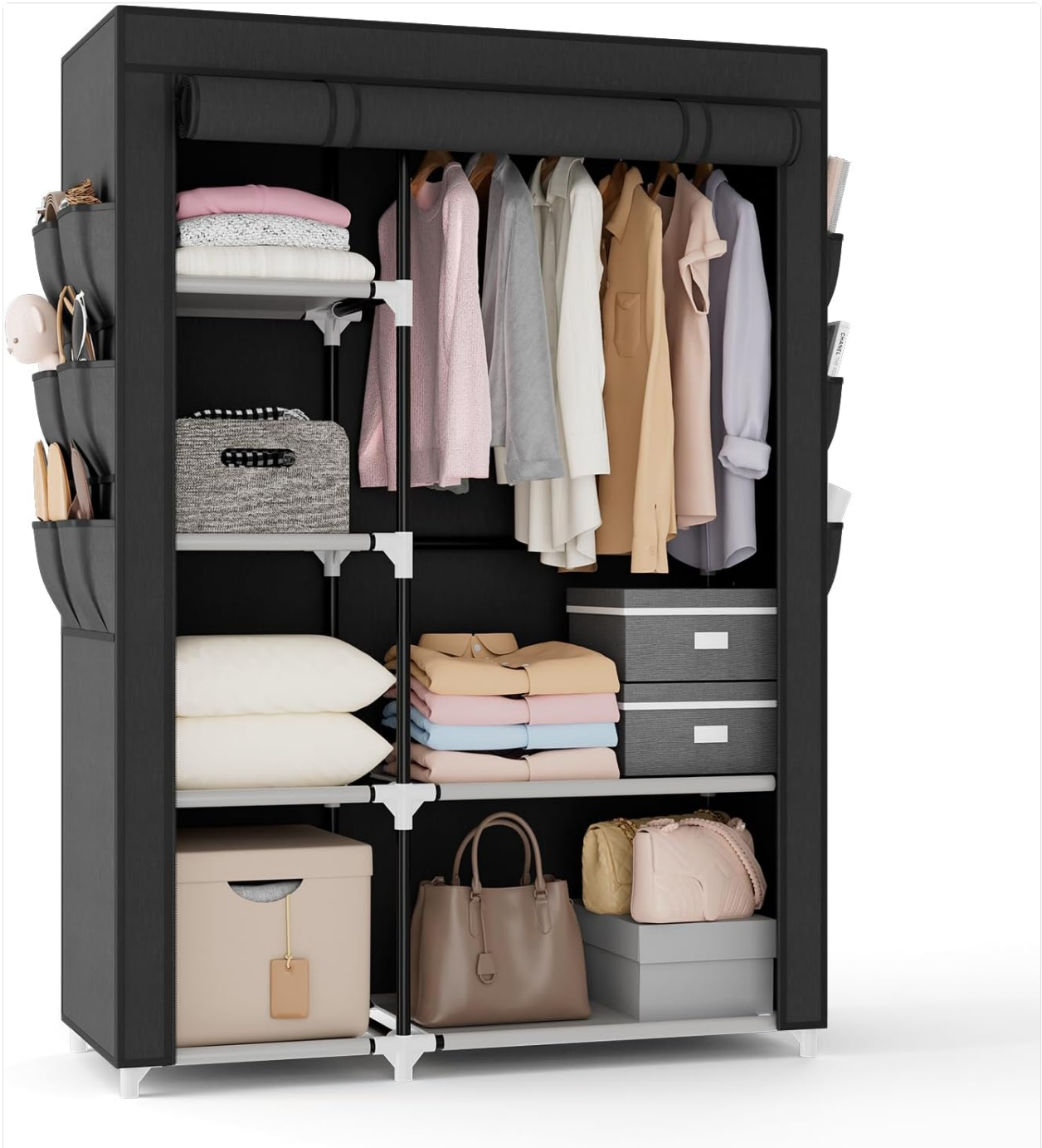
Figure 3: Fully assembled wardrobe showcasing internal storage capacity.