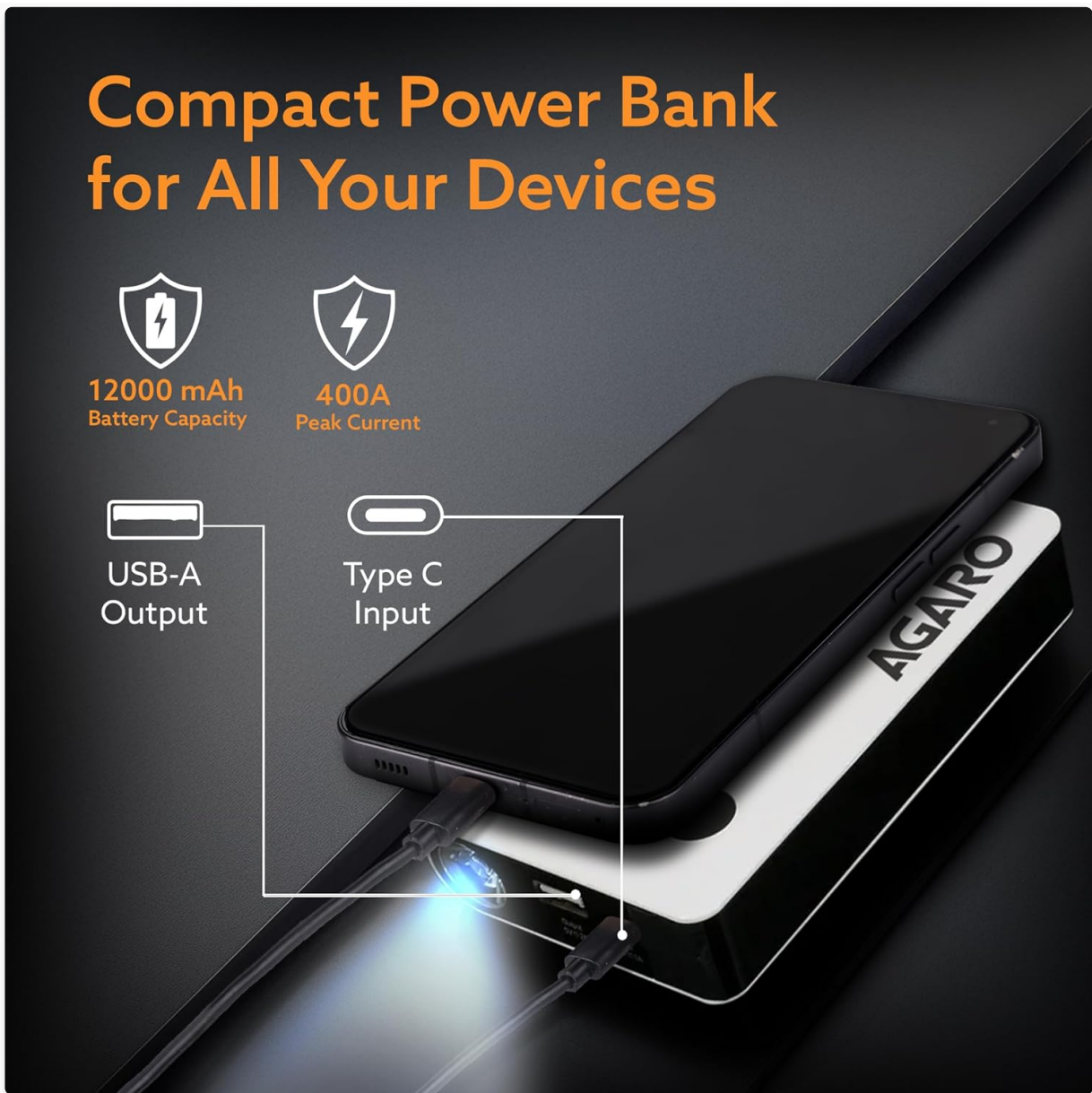
Image: The AGARO Primo Jump Starter connected via its USB-A output port to charge a smartphone, demonstrating its power bank functionality.