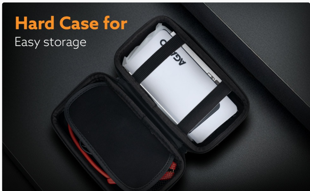
Image: The AGARO Primo Jump Starter and its accessories neatly stored within its durable hard carrying case, emphasizing ease of storage and protection.