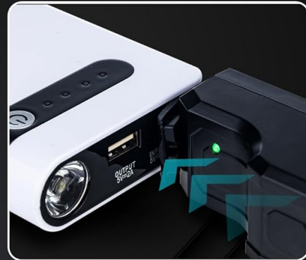
Step 2: Plug the cord of jumper cable into the jump start socket