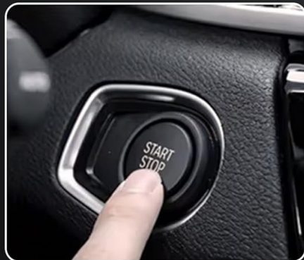
Step 3: Start the vehicle