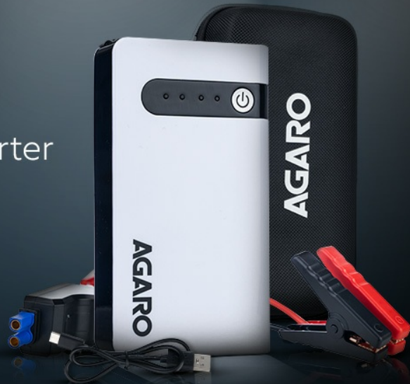
Image: The AGARO Primo Jump Starter unit, showcasing its compact design and various ports and indicators.