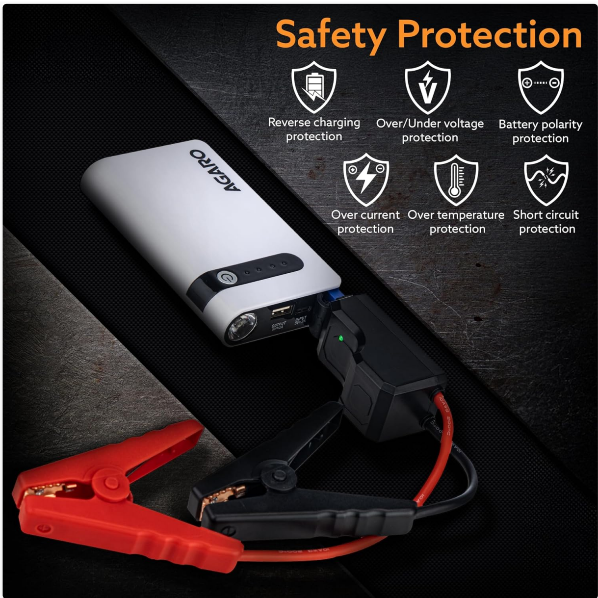
Image: Icons illustrating various safety protections built into the AGARO Primo Jump Starter, such as reverse charging, over/under voltage, battery polarity, over current, over temperature, and short circuit protection.