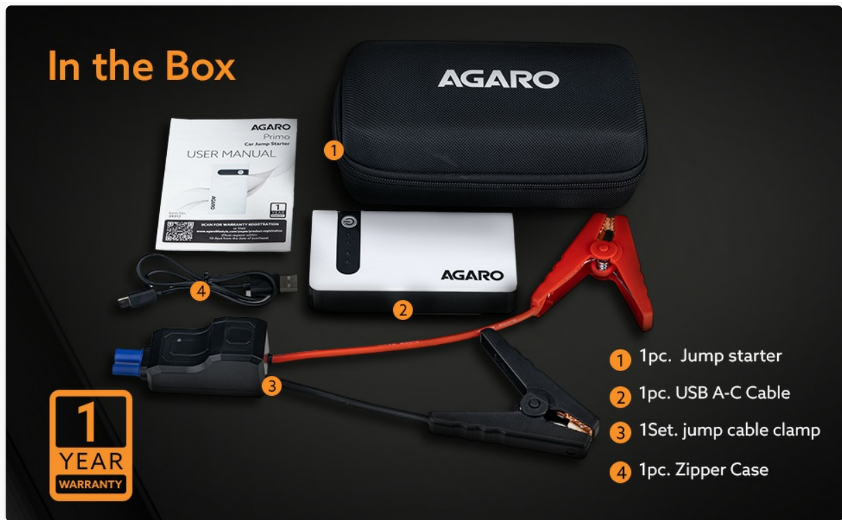
Image: A detailed view of all items included in the AGARO Primo Jump Starter package, neatly arranged.