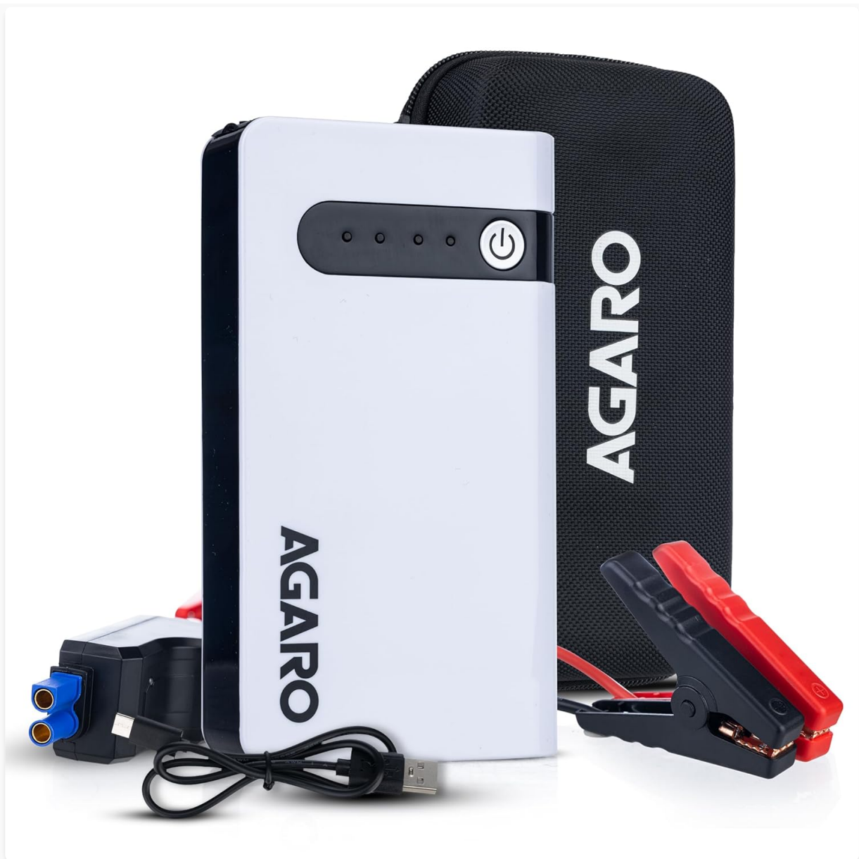
Image: AGARO Primo Portable Jump Starter with its included accessories, including the jump starter unit, smart clamps, and charging cable.