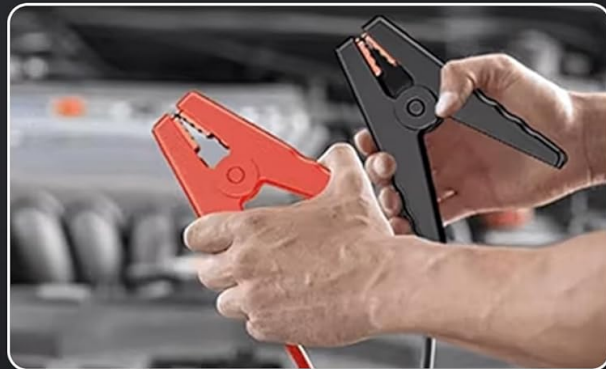
Step 4: Remove the jumper cable from the battery within 30 second