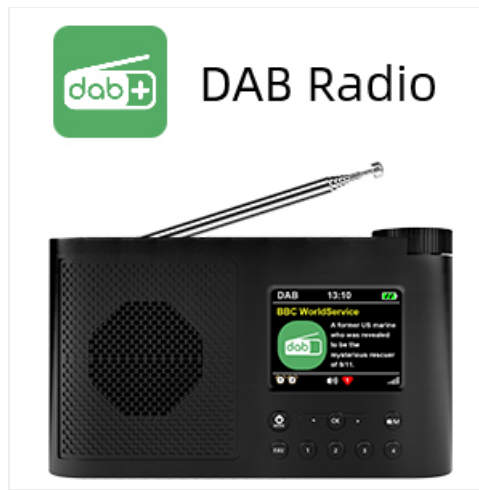
Image: Close-up of the radio's display showing DAB+ mode and current station information.