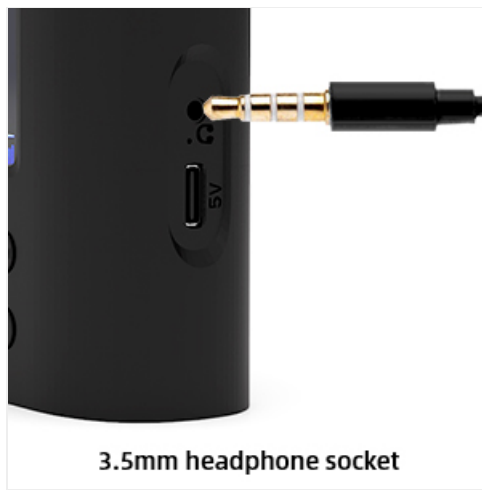
Image: Close-up view of the 3.5mm headphone socket on the side of the radio.