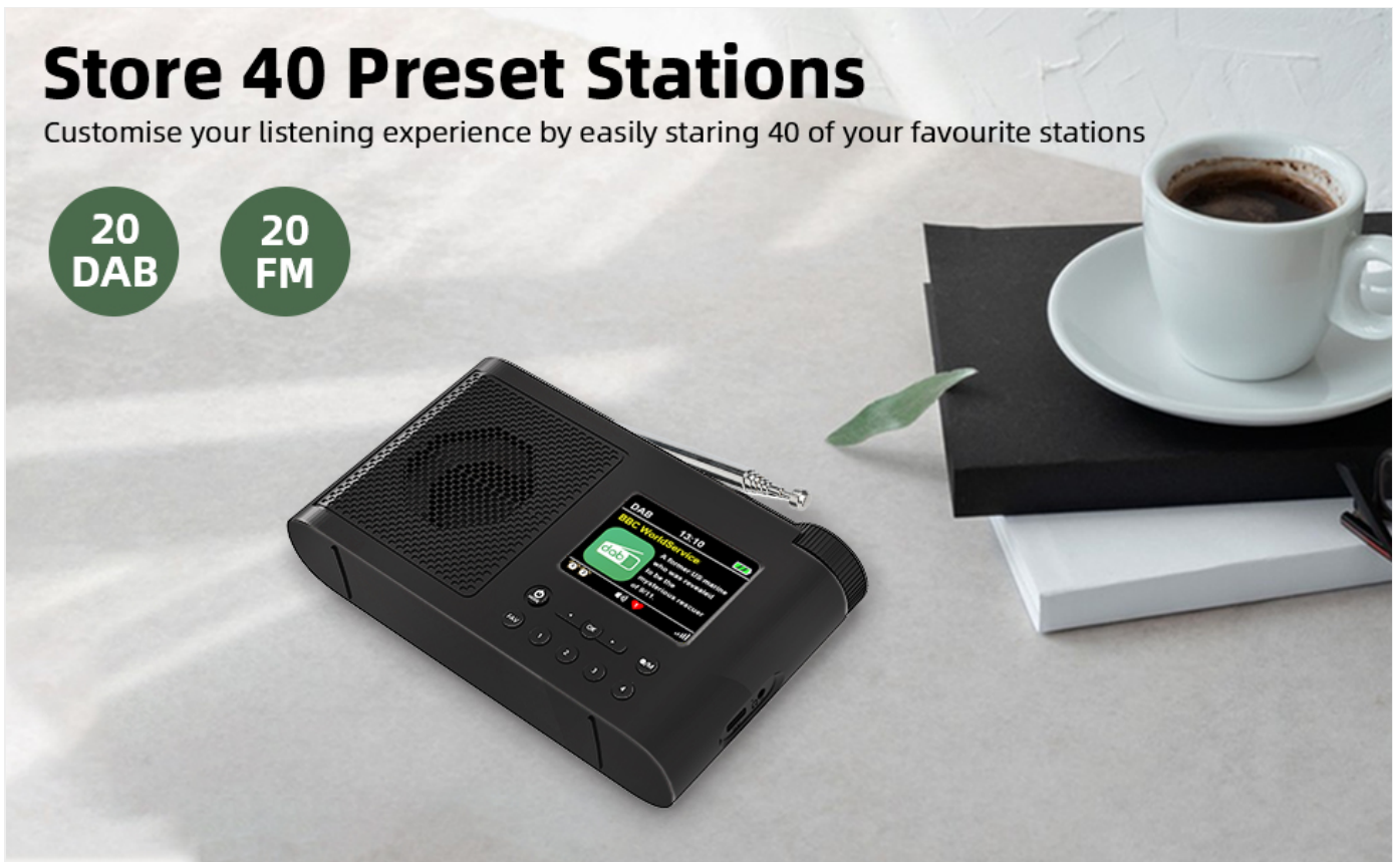
Image: The radio display indicating the ability to store 40 preset stations for both DAB and FM.