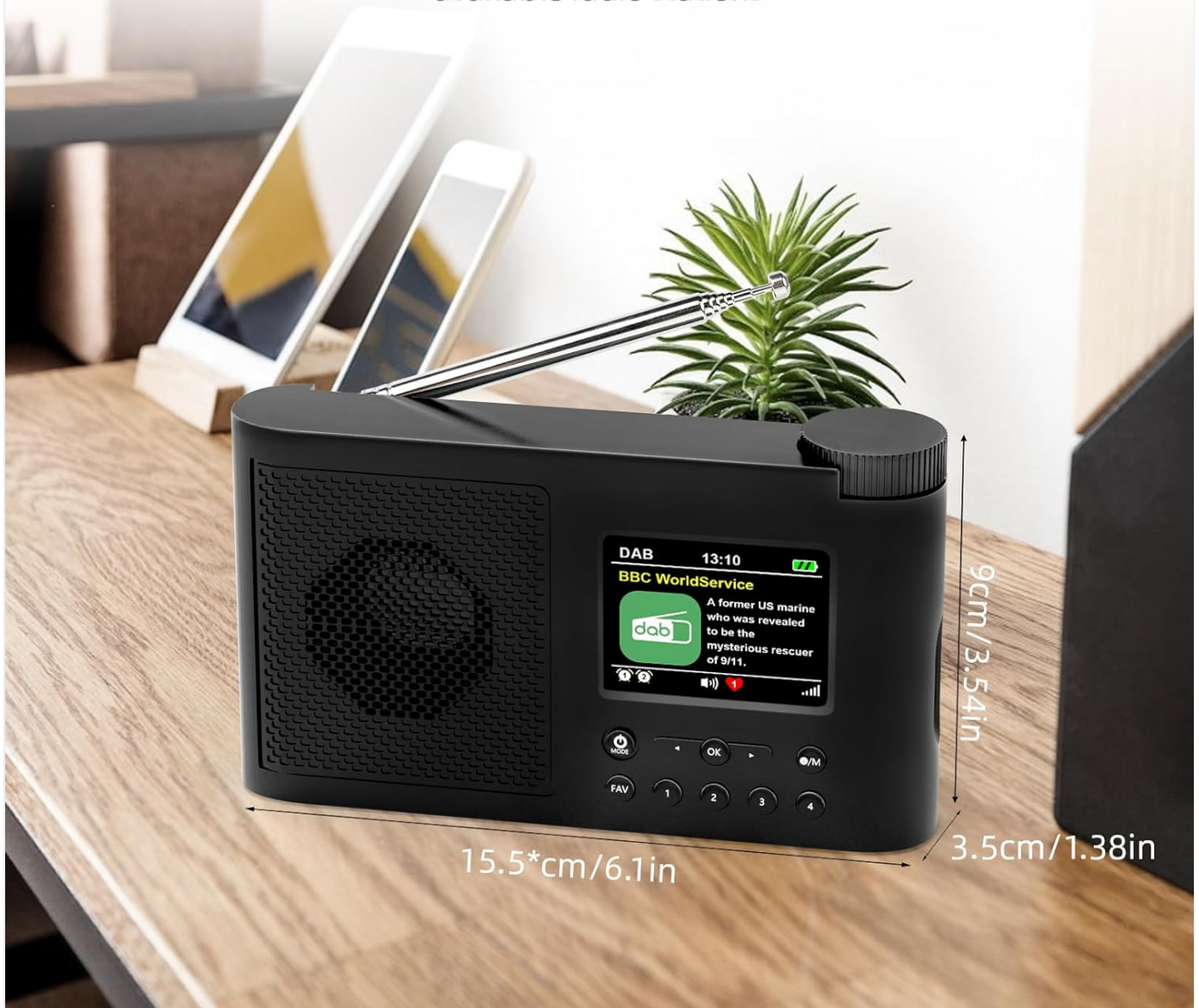
Image: The radio shown with its physical dimensions labeled.

Crisp and clear audio quality, and automatically searches for all your available radio stations