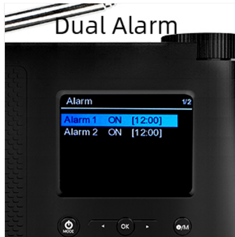
Image: The radio's display showing options for setting two separate alarms.