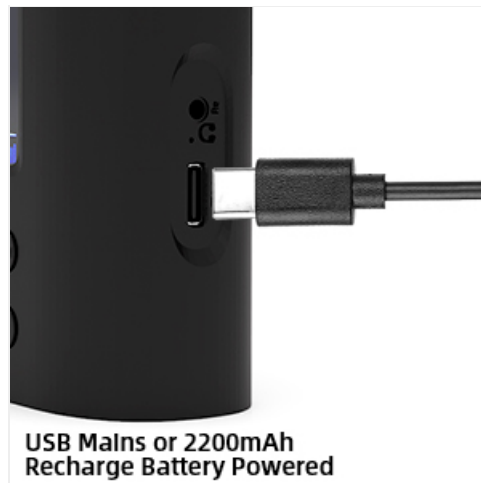
Image: Close-up view of the USB Type-C charging port on the side of the radio.