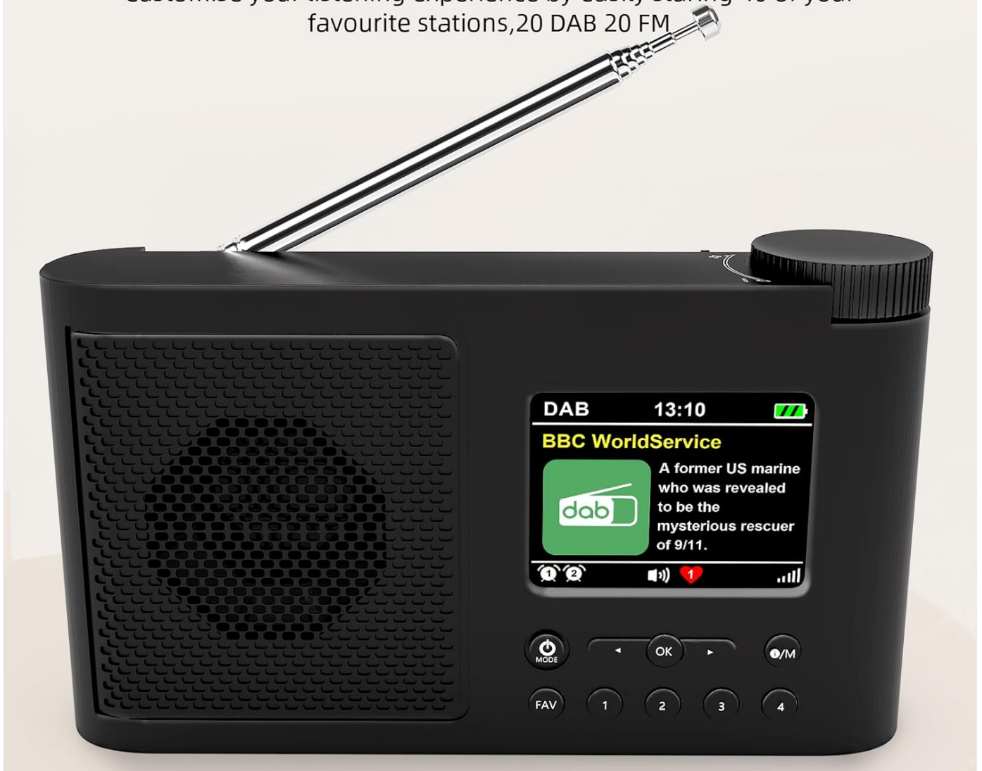
Image: Front view of the WOVTE DAB Portable Digital Radio, showcasing its display and control buttons.

Customise your listening experience by easily storing 40 of your favourite stations, 20 DAB 20 FM