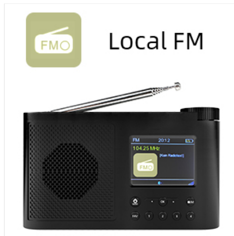
Image: The radio shown with its telescopic antenna fully extended.

Extend the telescopic antenna fully for optimal radio signal reception, especially in DAB/DAB+ and FM modes.