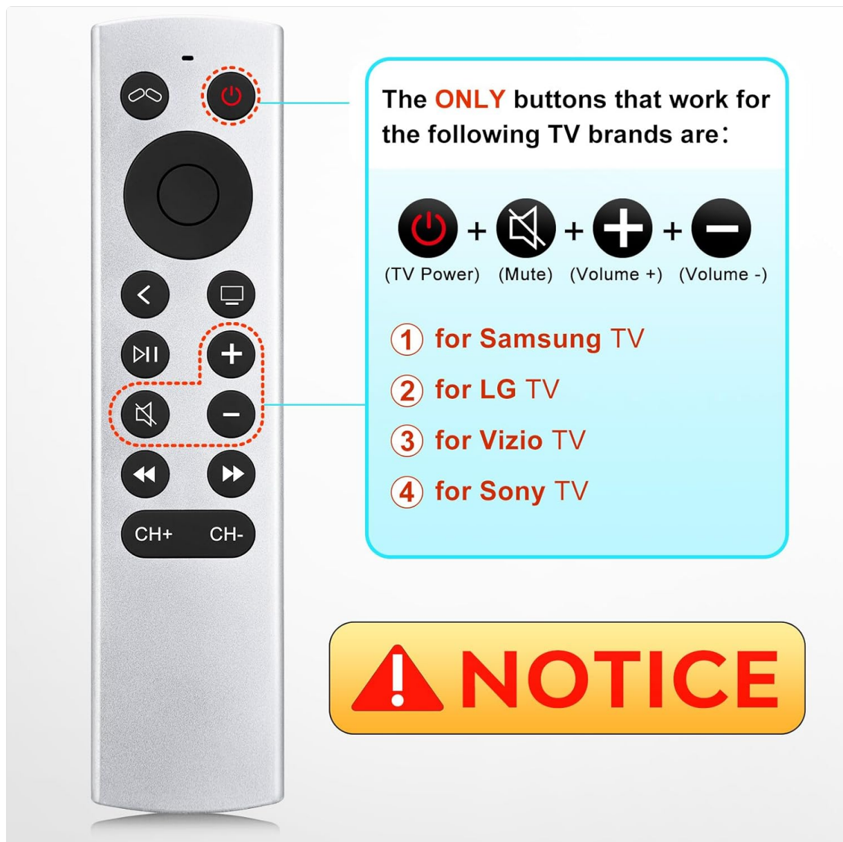
Image 4.2: Remote control highlighting TV brand compatibility for power, volume, and mute buttons. This image visually indicates which buttons control TV power, mute, and volume, and lists the TV brands they are compatible with.

Important: Before using this remote, you must "UNLOCK" your old device with its original remote. Failure to do so may prevent this remote from connecting to your device.