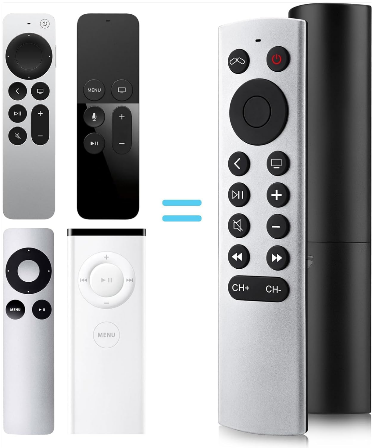
Image 3.1: LOUTOC Replacement Remote Control for Apple TV 4K/HD. This image displays the sleek, silver-colored remote control with its black buttons, designed to replace the original Apple TV remote.