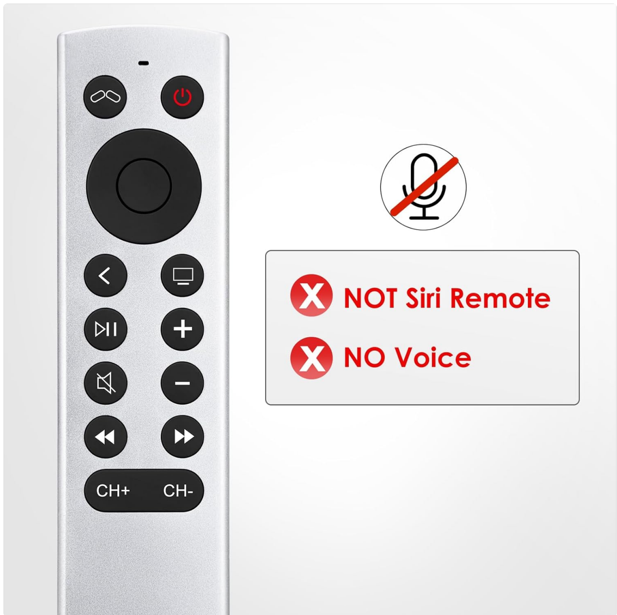
Image 3.3: Remote control indicating no Siri or Voice function. This image clearly shows a microphone icon with a cross through it, emphasizing that the remote does not support Siri or voice commands.