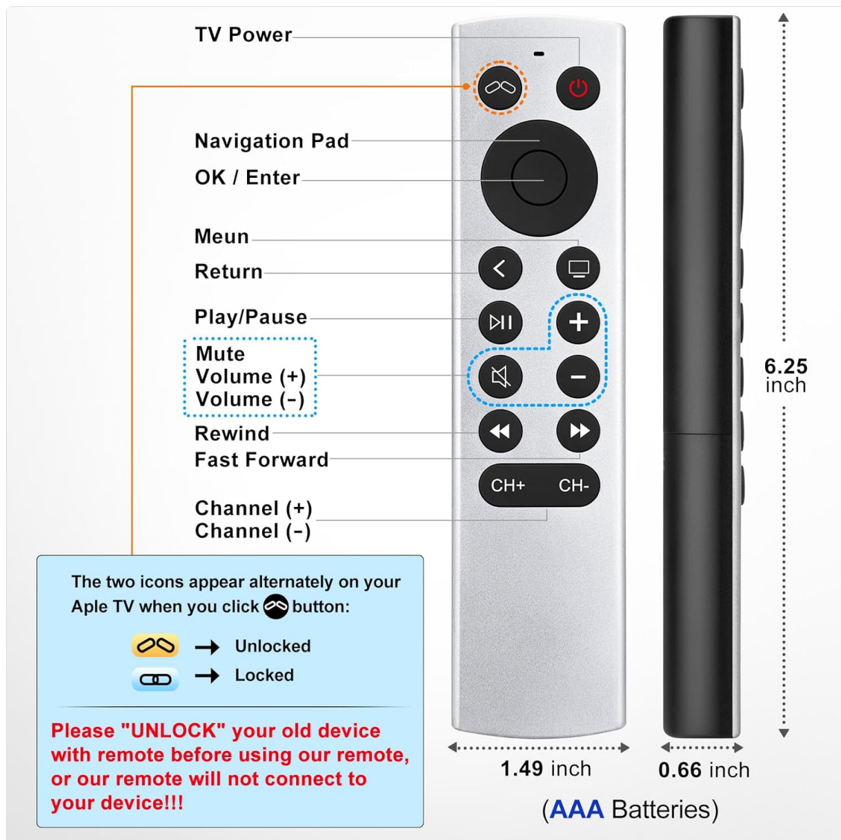
Image 3.2: Labeled buttons of the LOUTOC Replacement Remote Control. This image highlights the various buttons on the remote, including TV Power, Navigation Pad, OK/Enter, Menu, Return, Play/Pause, Mute, Volume (+/-), Rewind, Fast Forward, and Channel (+/-).