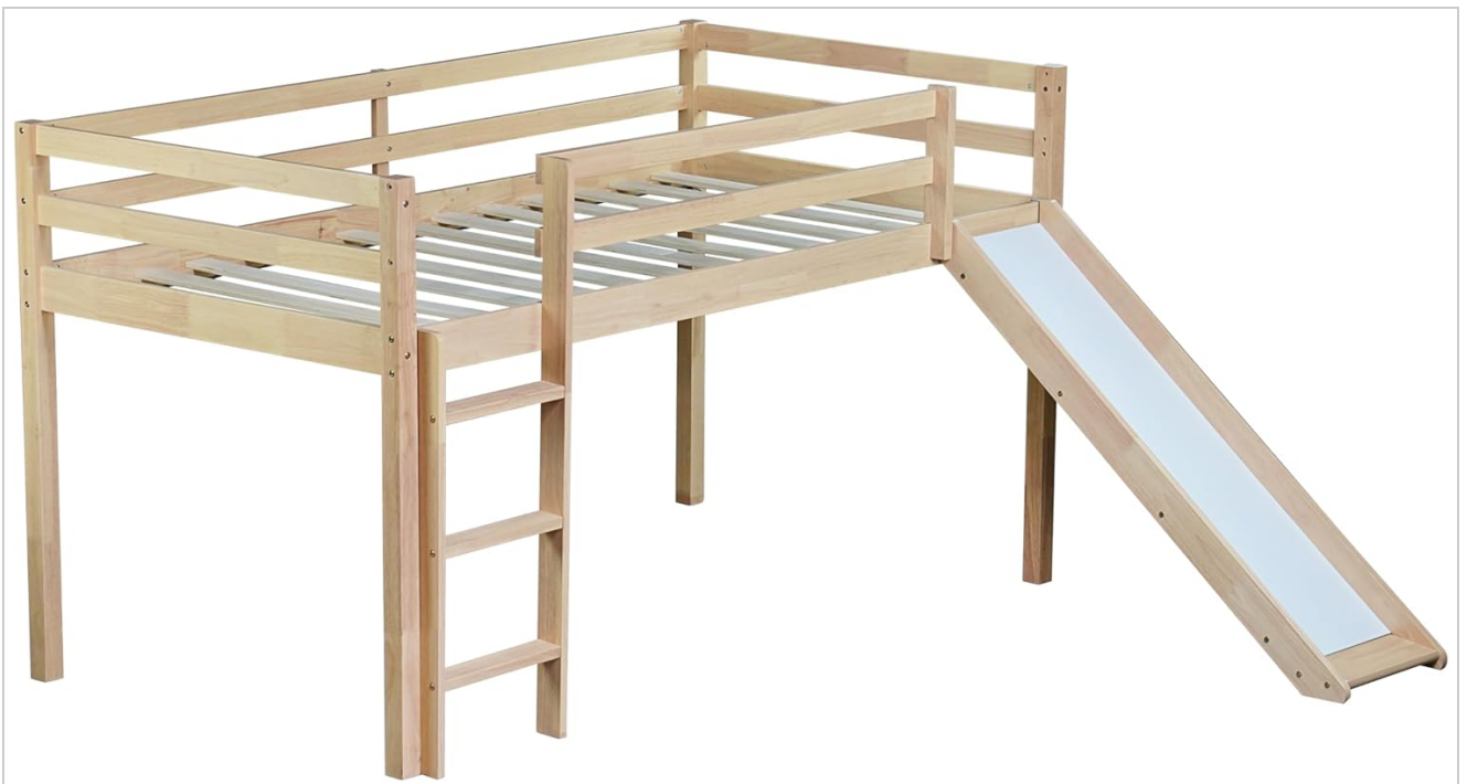
Image 2: Bed frame with slats installed, illustrating the base structure for the mattress.