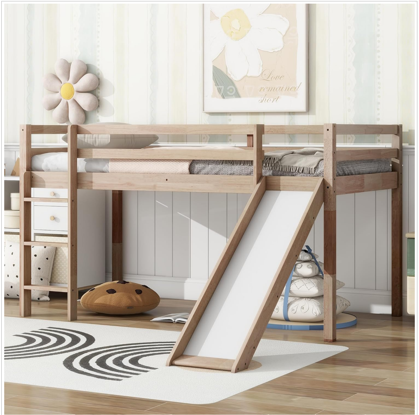
Image 1: Fully assembled PVWIIK Twin Loft Bed with Slide, showcasing its design and functionality within a bedroom setting.