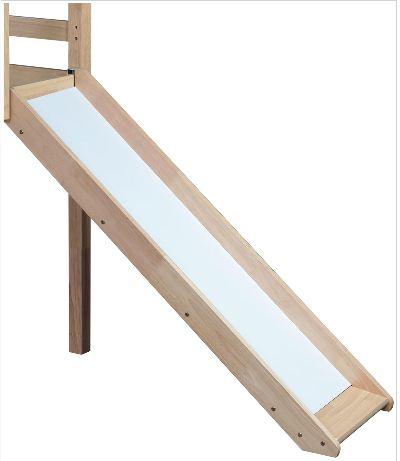
Image 5: Detailed view of the slide, highlighting its construction and smooth surface.