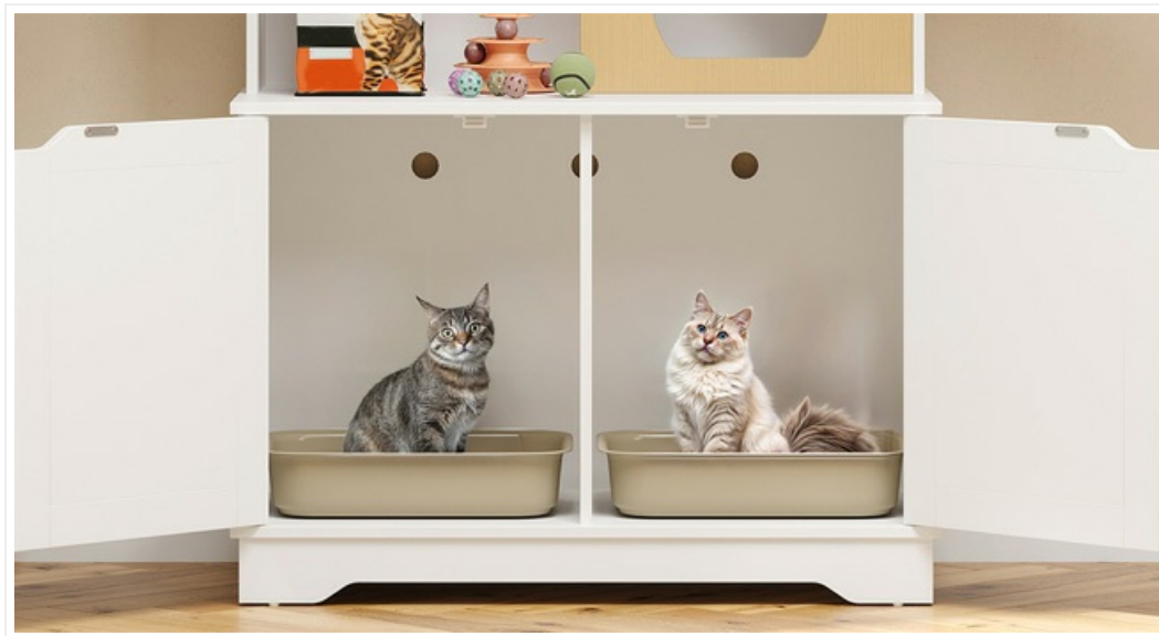
Figure 5.1: The lower section accommodates two litter boxes, providing privacy for your cats.

Open the lower cabinet doors. Place standard-sized litter boxes into the two designated compartments. The internal dimensions of each compartment are approximately 16.7" L x 18.1" W x 19.7" H. Ensure there is enough space for your cat to comfortably enter and exit through the side arched openings.