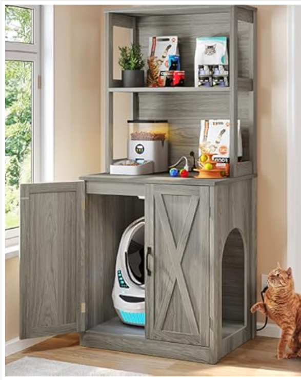
Figure 5.3: The integrated cat bed offers a cozy resting spot.