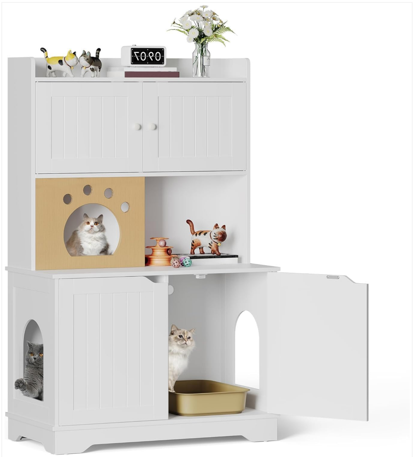
Figure 1.1: The DWVO Cat Litter Box Enclosure with Shelves, featuring a hidden litter box area and upper storage.