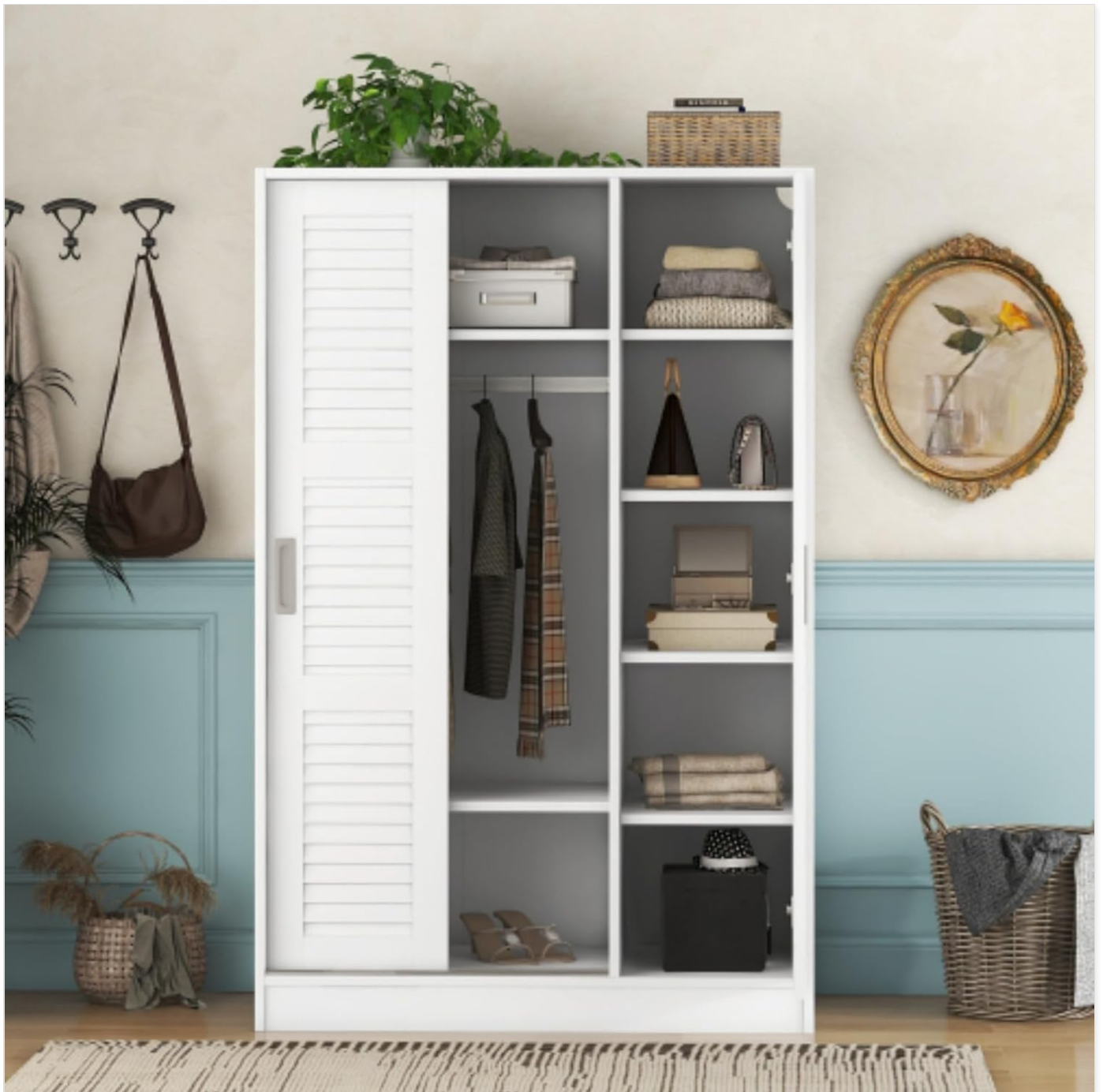
Image: The YIZEMEIJIA 3-Door Shutter Wardrobe, showcasing its design and internal storage capabilities with one door slid open. The wardrobe is white with louvered doors and silver handles, fitting into a modern room setting.

This manual provides essential information for the assembly, operation, maintenance, and troubleshooting of your new wardrobe. Please read it thoroughly before beginning assembly or use.