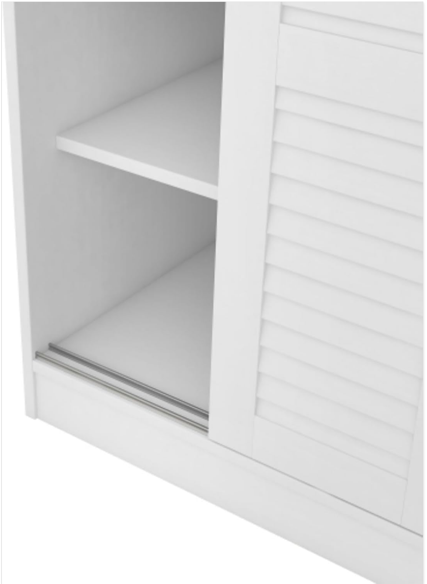
Image: A close-up of the sliding door track, essential for the smooth operation of the louvered doors.