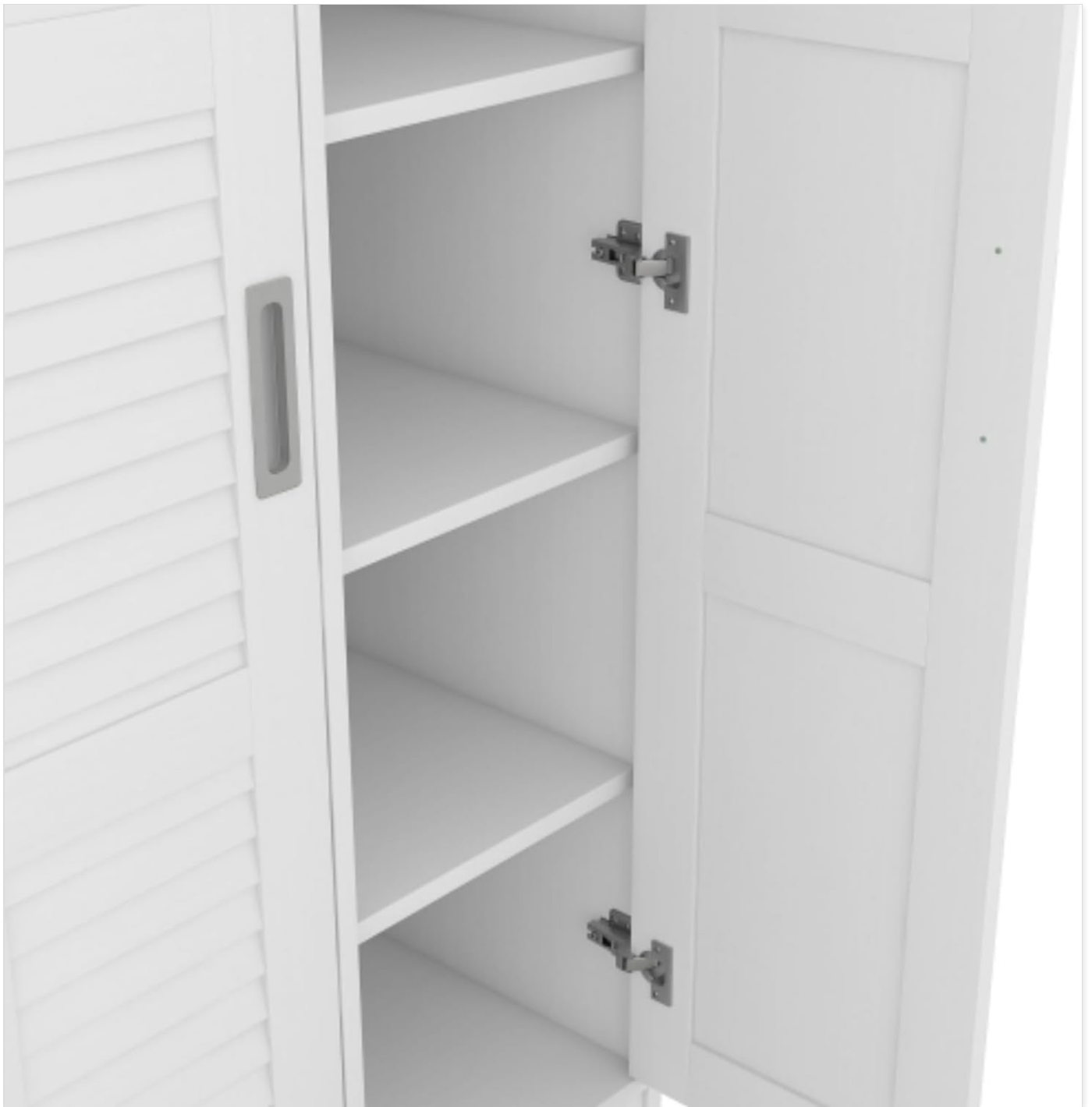
Image: A detailed view of the internal shelving and hinge mechanism, illustrating the construction and component integration during assembly.