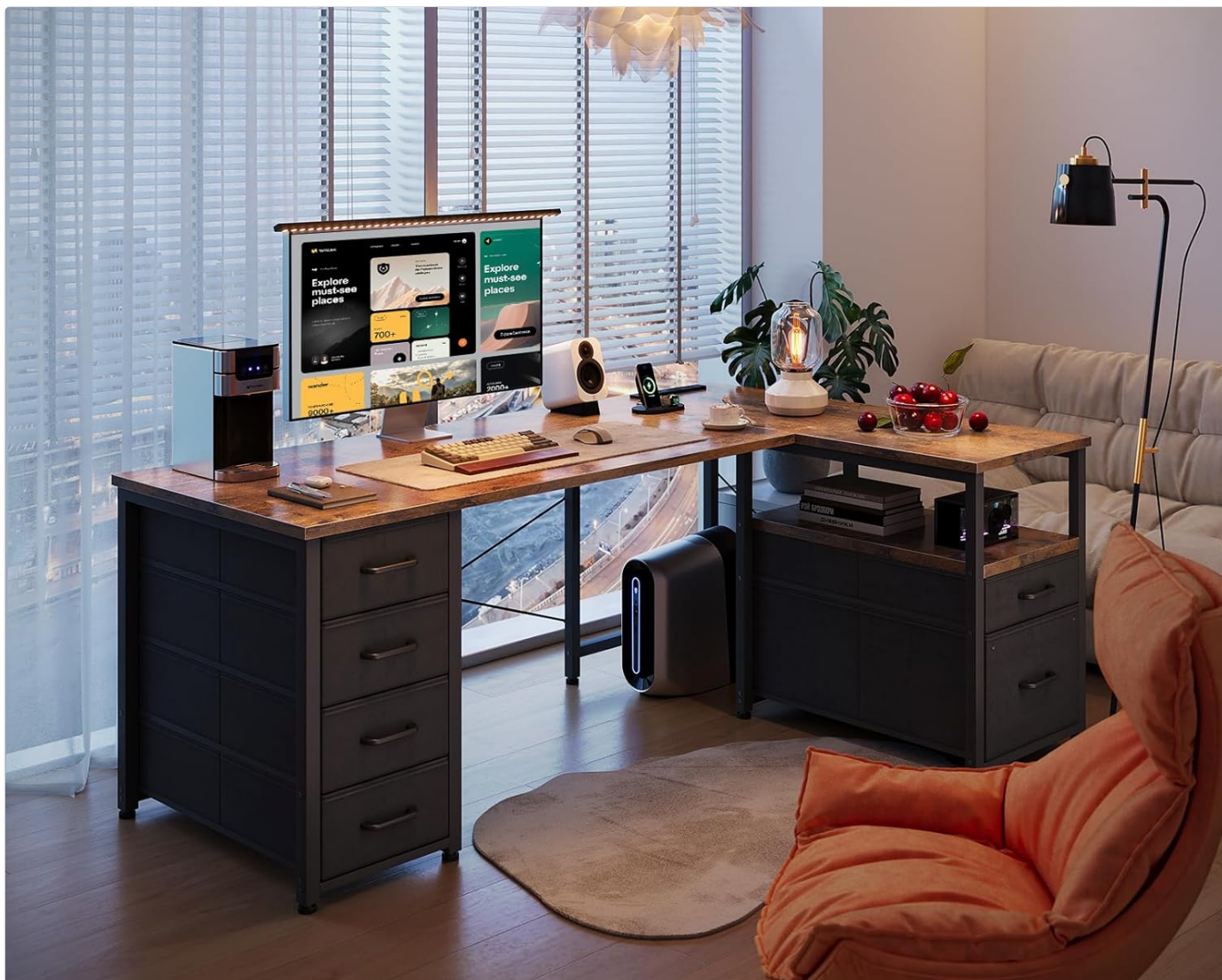
Image: The AODK L-shaped computer desk provides a spacious and organized workspace.