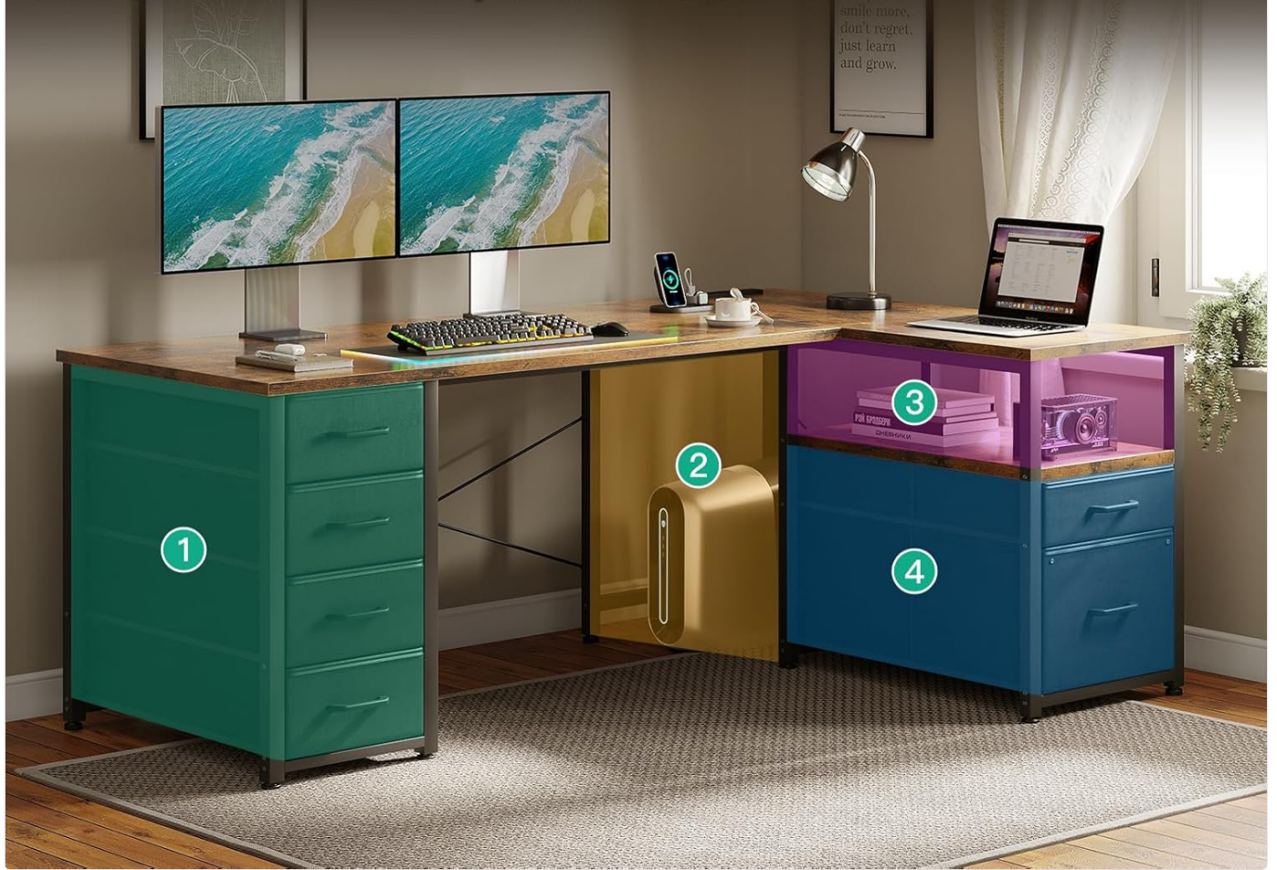
Image: The desk offers versatile storage solutions with drawers and open racks.