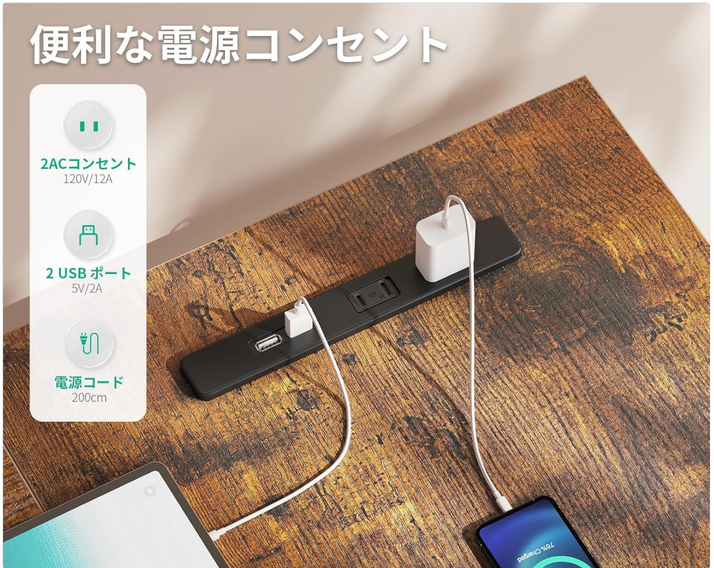
Image: The integrated power outlet provides convenient charging for multiple devices.

allows for easy charging of your computer, smartphone, and other electronic devices directly from your workspace. Simply plug the desk's power cord into a wall outlet, then connect your devices to the integrated outlets.