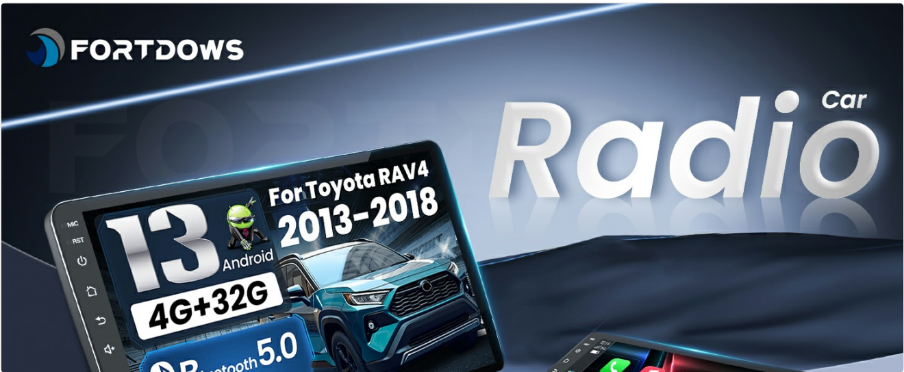
Image: Apple CarPlay and Android Auto interfaces displayed on the Fortdows car stereo.

Connect your smartphone wirelessly to access navigation, make calls, send messages, and enjoy music through the large touchscreen. The unit supports both Apple CarPlay and Android Auto for seamless integration.