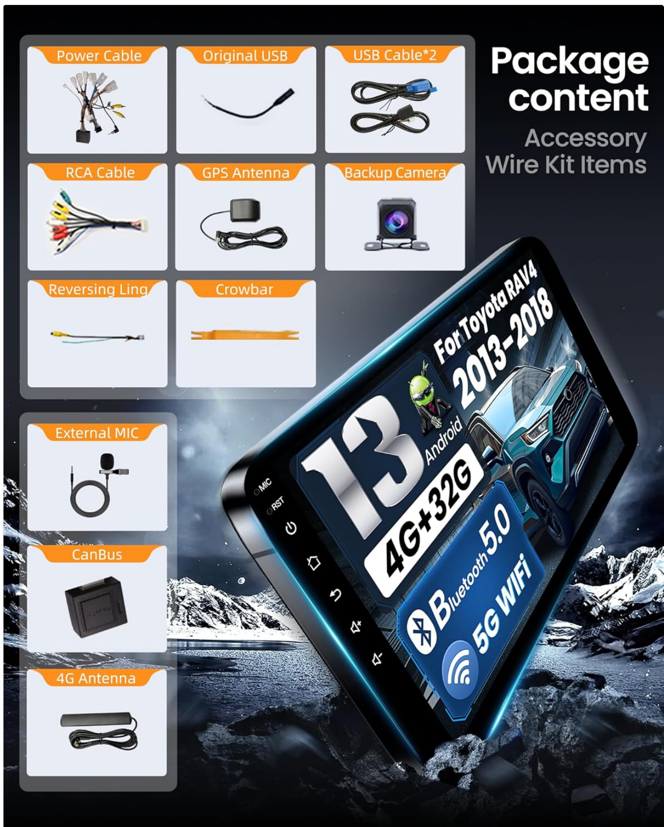
Image: All components included in the Fortdows car stereo package.