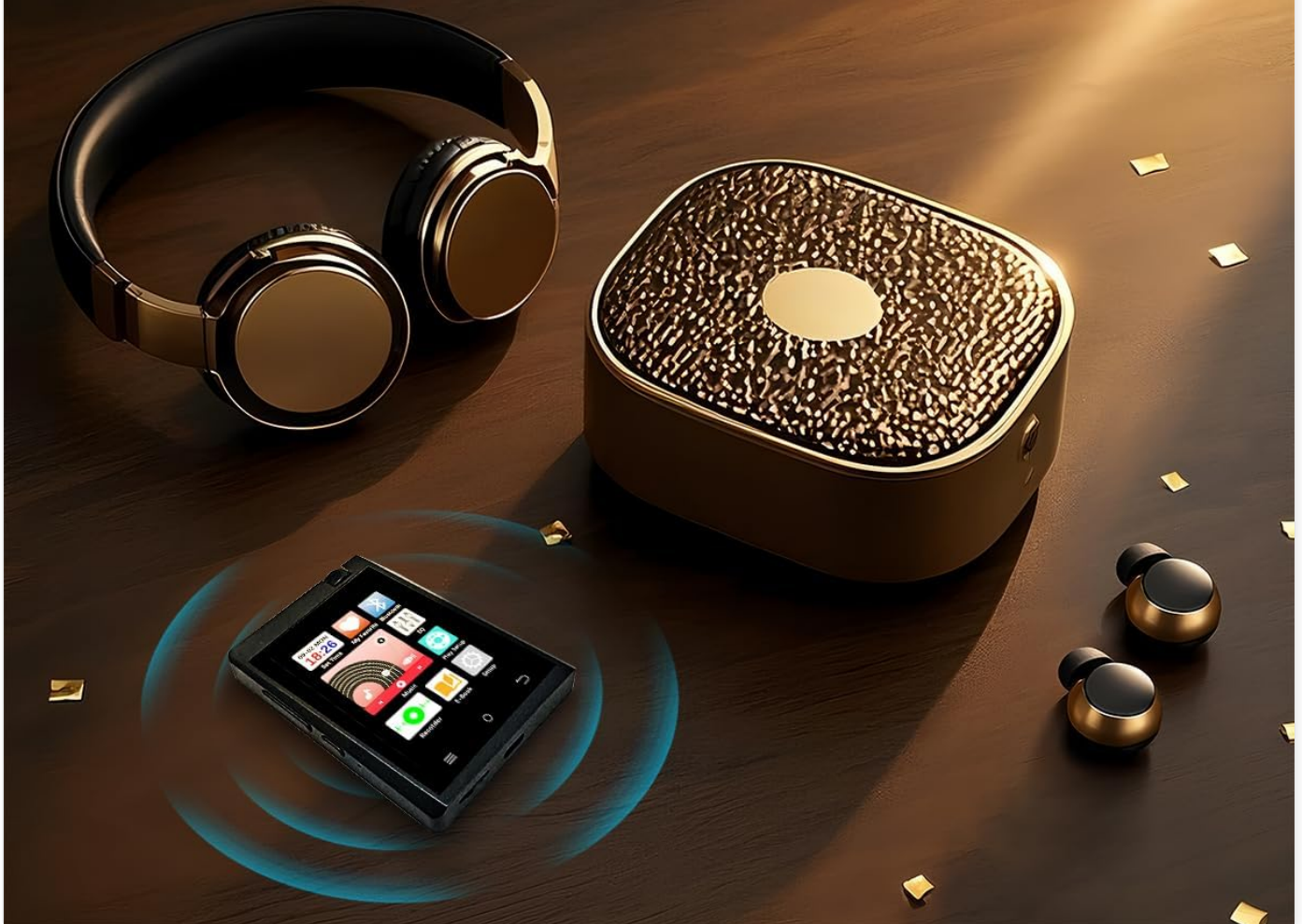
Figure 4.2: The CCHKFEI M22 MP3 Player utilizes Bluetooth 5.3 technology for stable wireless connections to compatible audio devices such as earbuds, headphones, external speakers, and car audio systems.