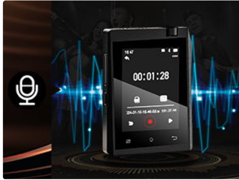
Figure 4.3: The voice recorder interface on the M22 MP3 Player, allowing users to capture audio recordings.