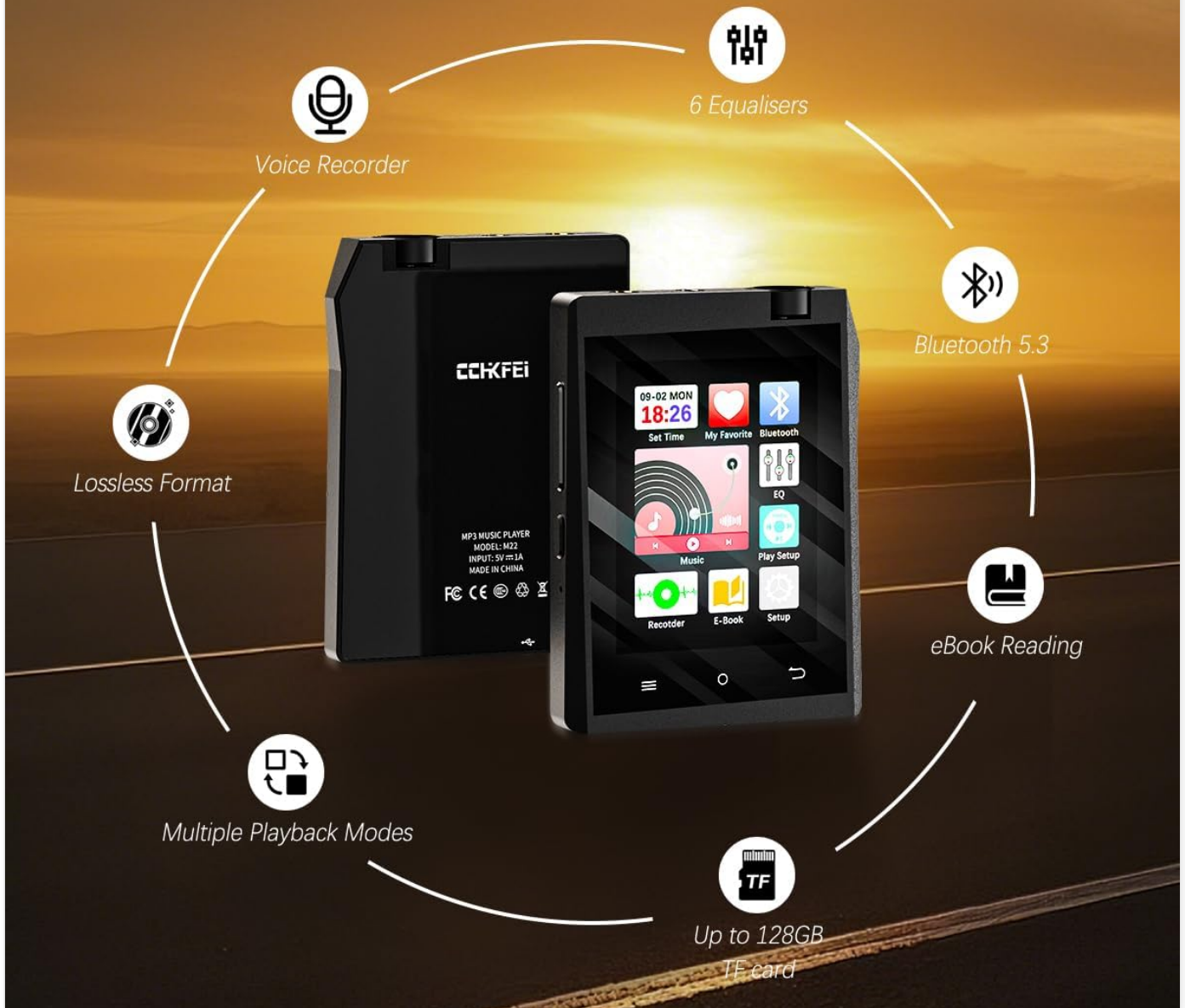
Figure 4.5: An overview of the CCHKFEI M22 MP3 Player's multi-functional capabilities, including voice recording, support for various lossless audio formats, multiple playback modes, expandable memory up to 128GB, e-book reading, Bluetooth 5.3, and six equalizer settings.