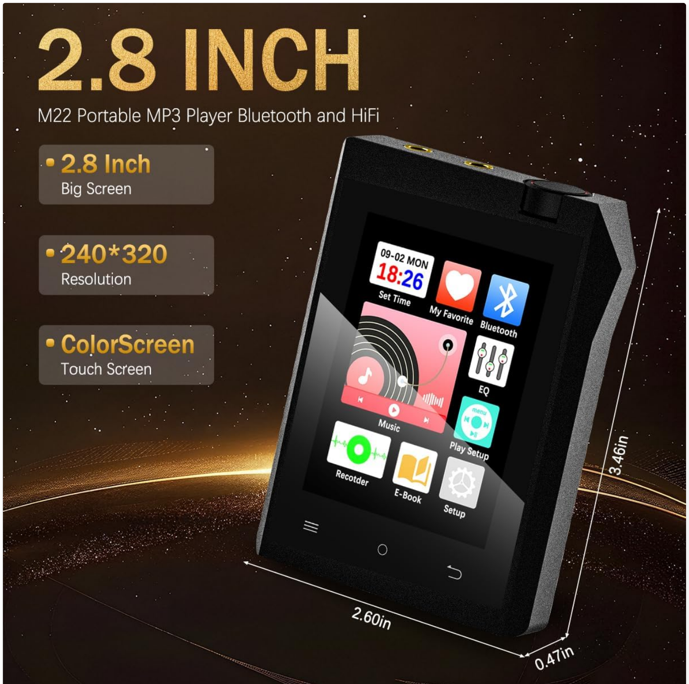
Figure 2.2: The CCHKFEI M22 MP3 Player with its key dimensions: 2.60 inches (width), 3.46 inches (height), and 0.47 inches (thickness). It features a 2.8-inch color touch screen with 240x320 resolution.