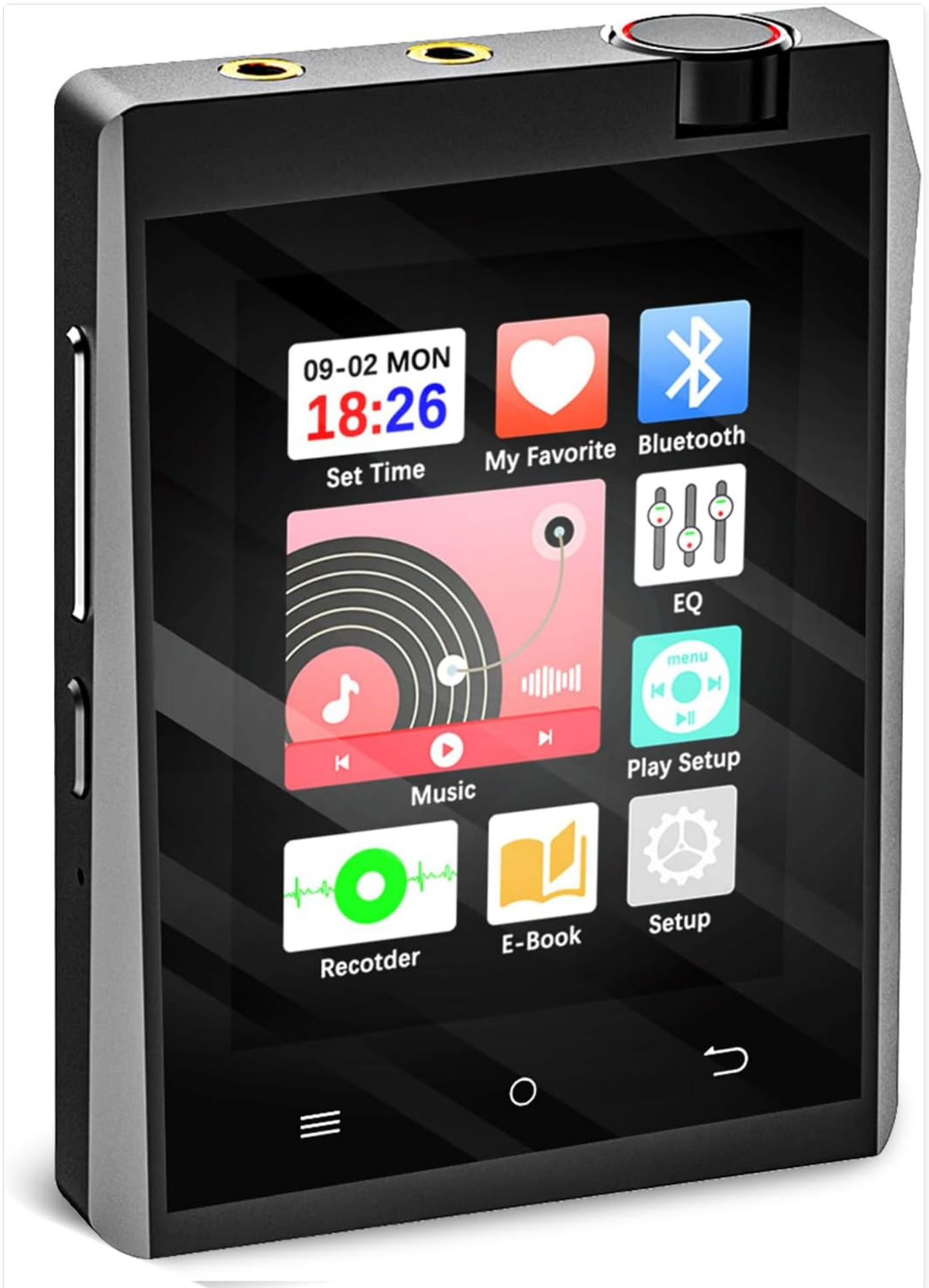
Figure 2.1: Front view of the CCHKFEI M22 MP3 Player, showing the 2.8-inch touch screen interface with icons for Set Time, My Favorite, Bluetooth, EQ, Music, Play Setup, Recorder, E-Book, and Setup. The device has a sleek, dark gray metallic finish with a volume knob on the top right.