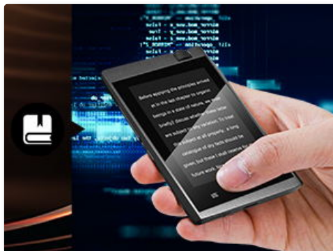
Figure 4.4: The e-book reader function on the M22 MP3 Player, displaying text content. This feature supports .TXT files.