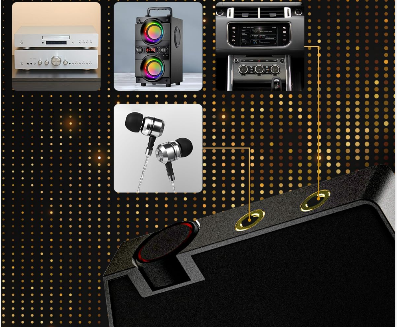
Figure 2.3: The top of the M22 MP3 Player features dual 3.5mm audio jacks, allowing for connection to various audio devices such as wired headphones, external speakers, or car audio systems. The headphone output power is 10mW@32Ω / 20mW@16Ω.

Headphone Output Power 10mW@32Ω / 20mW@16Ω