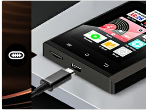
Figure 3.1: The USB-C port on the CCHKFEI M22 MP3 Player, used for charging the device and transferring data.