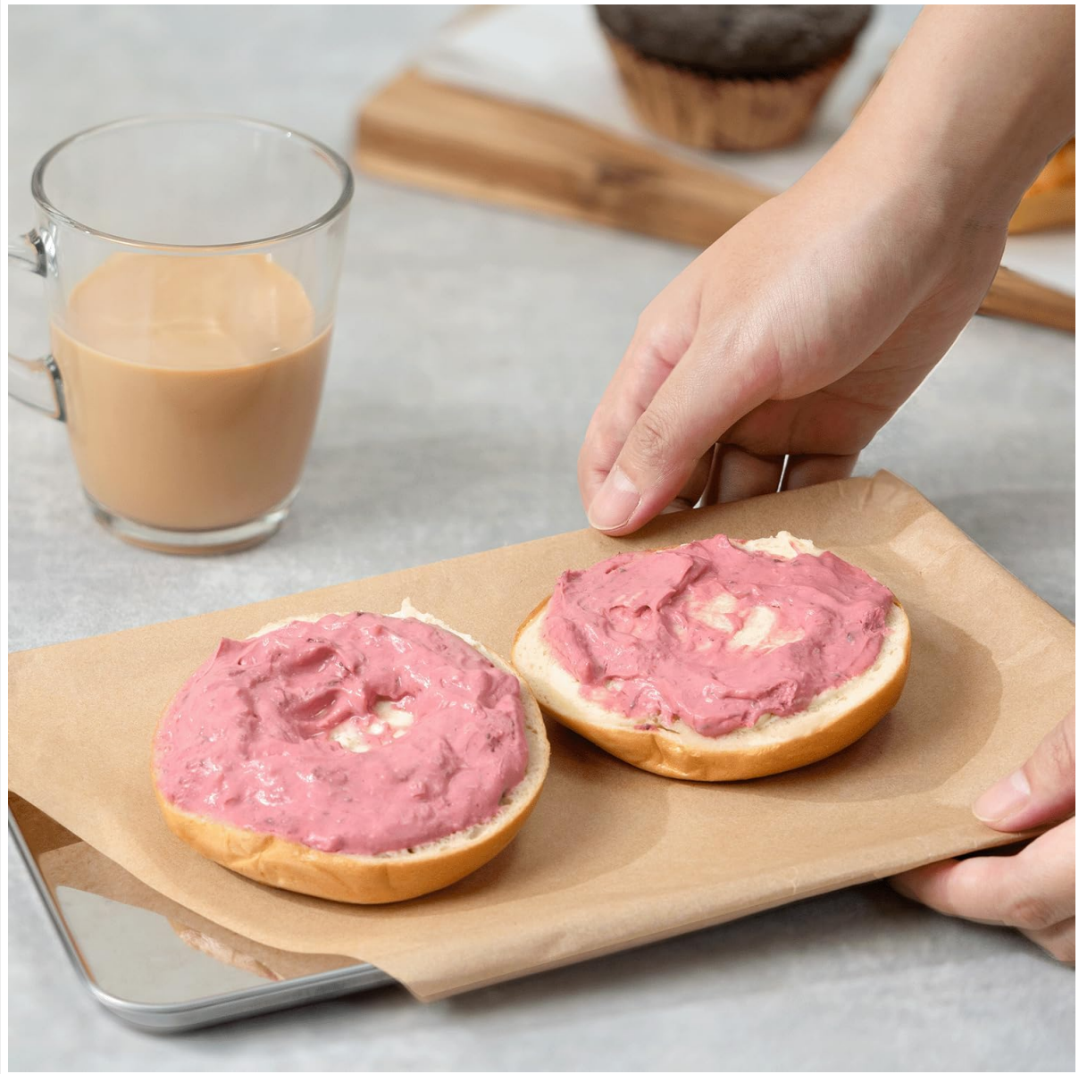
Image: A hand demonstrates placing a bagel with cream cheese onto a deli paper sheet, illustrating its use as a serving liner.