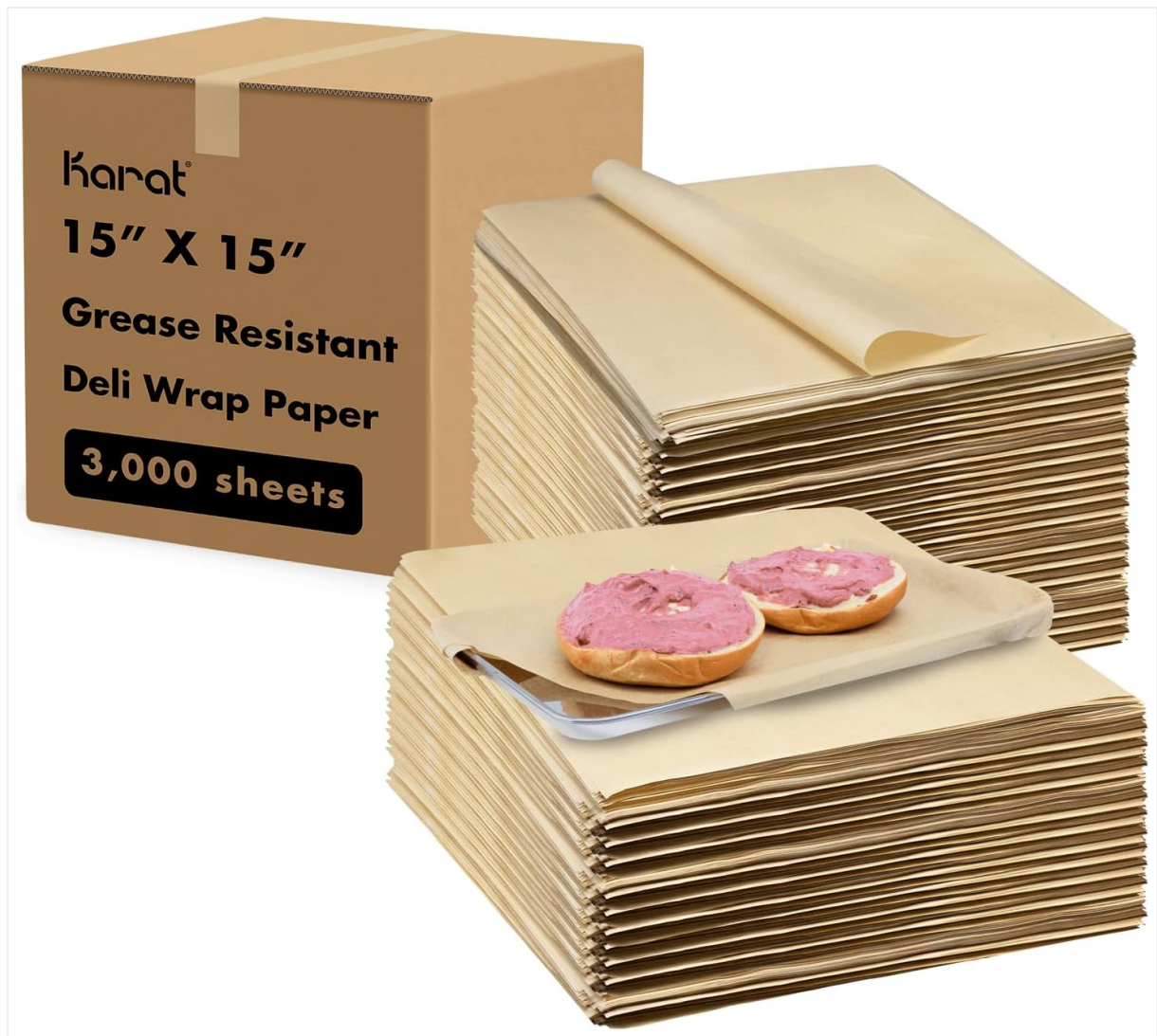
Image: Packaging and stacked Karat Kraft 15x15 inch deli paper sheets, with two bagels on a sheet.