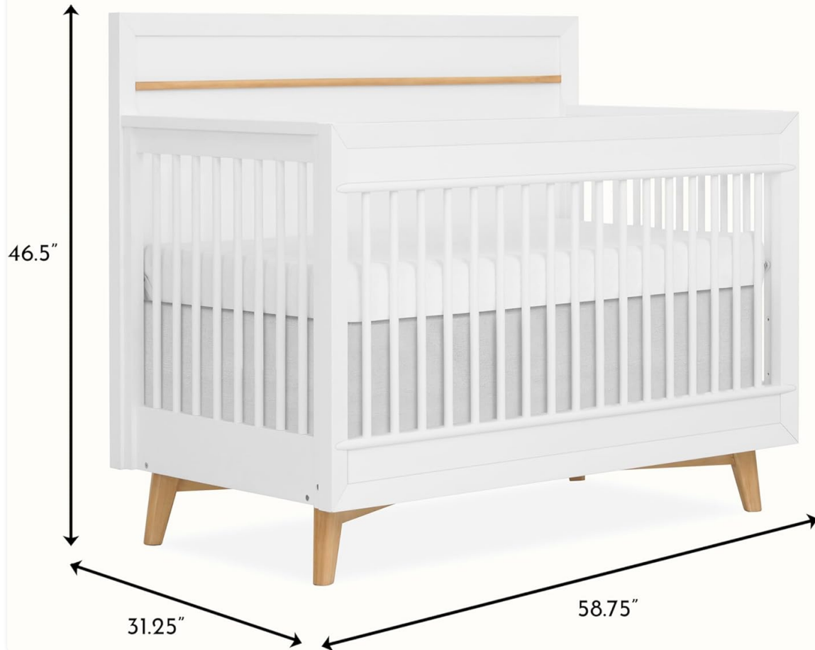
Image: Diagram showing the dimensions of the assembled Evolur Loft Antilia Crib: 58.75 inches length, 31.25 inches width, and 46.5 inches height.