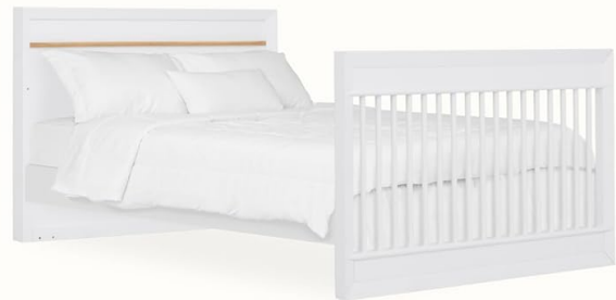
*Full-size bed *Universal full-size bed rails