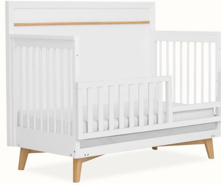
*Toddler bed *Universal toddler guardrail