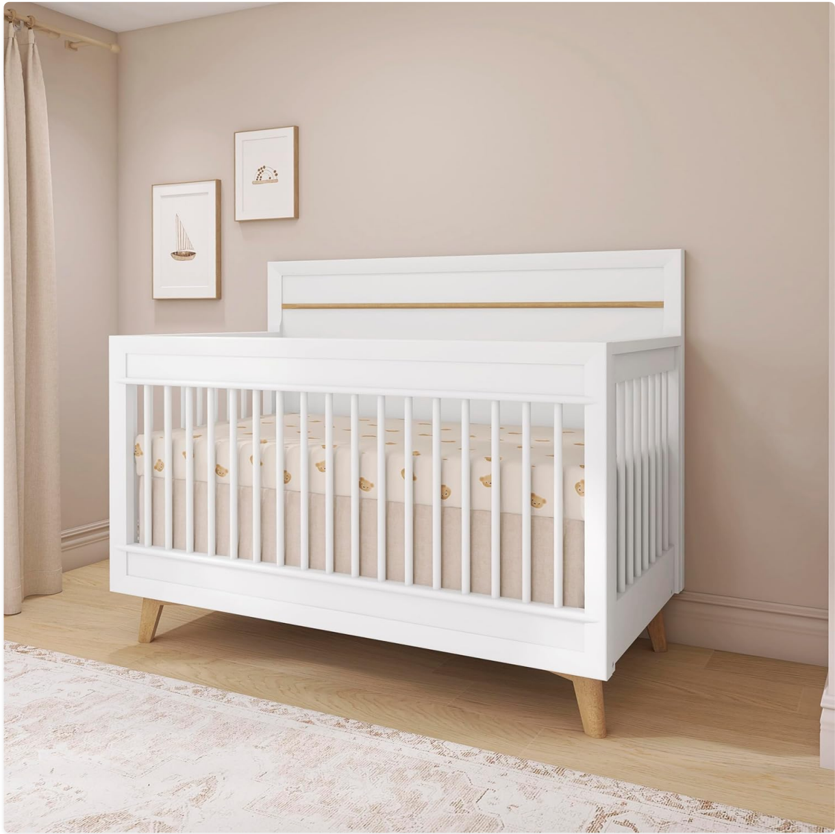
Image: The Evolur Loft Antilia Mid-Century 4-in-1 Convertible Crib in White & Natural, showcasing its modern design and sturdy construction.