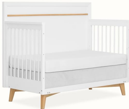
Daybed/ kids sofa