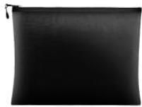
Fireproof Bag x1