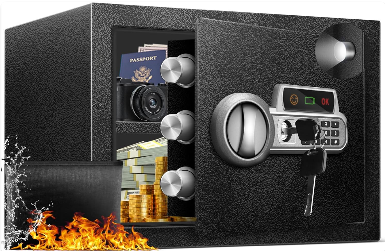
Figure 1: Fdsutvit 1.5 Cu Ft Steel Security Safe Box, designed for securing valuables.

Thank you for choosing the Fdsutvit 1.5 Cu Ft Steel Security Safe Box. This manual provides essential information for the safe and efficient operation of your new security safe. Please read it thoroughly before installation and use, and keep it for future reference.