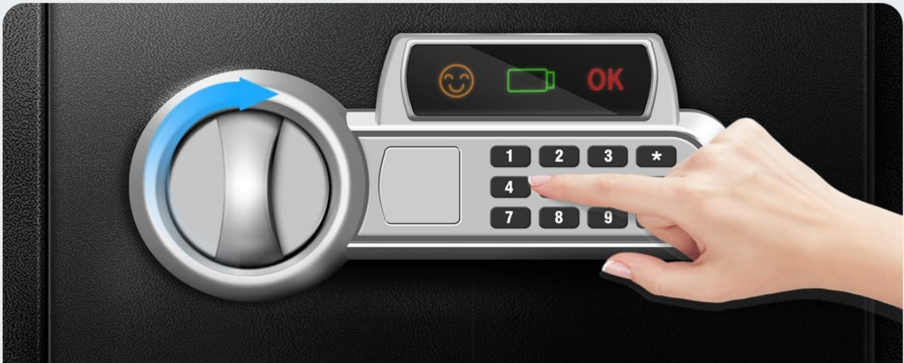
PASSCODE + KNOB