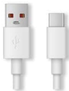
Type-C Cable x1