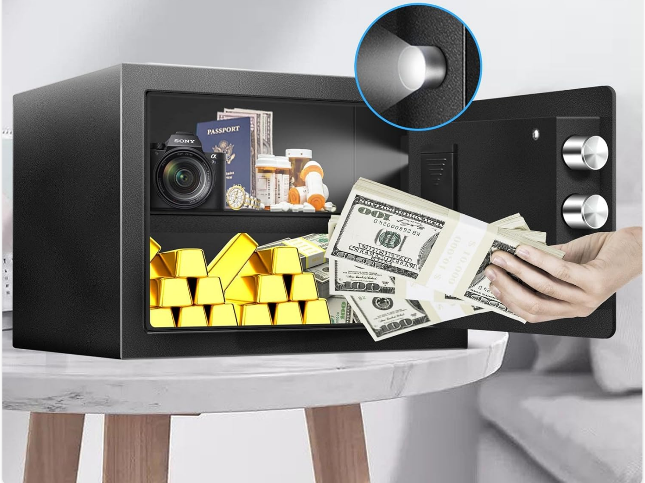
Figure 7: Built-in motion sensor lights illuminate the safe's interior.