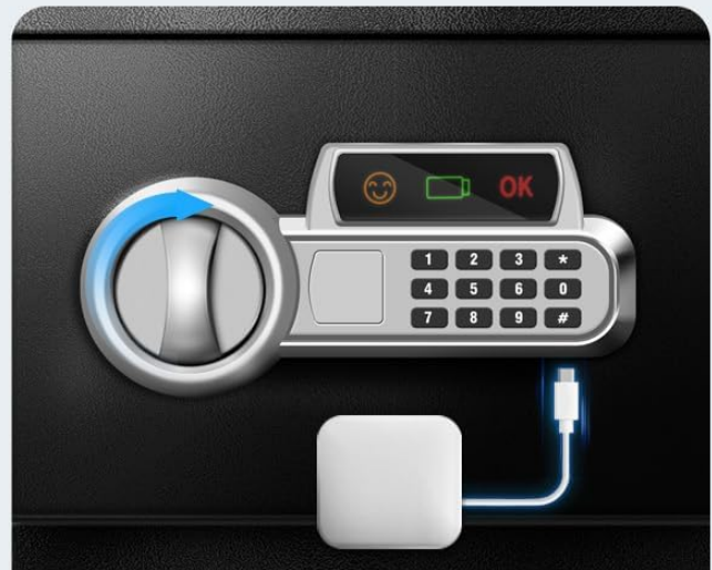
USB POWER + CODE + KNOB