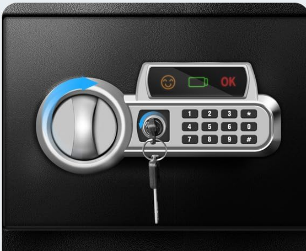
KEY + KNOB