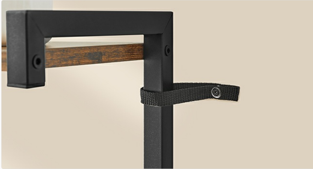
Figure 2: Anti-tip strap for securing the shelf to the wall.