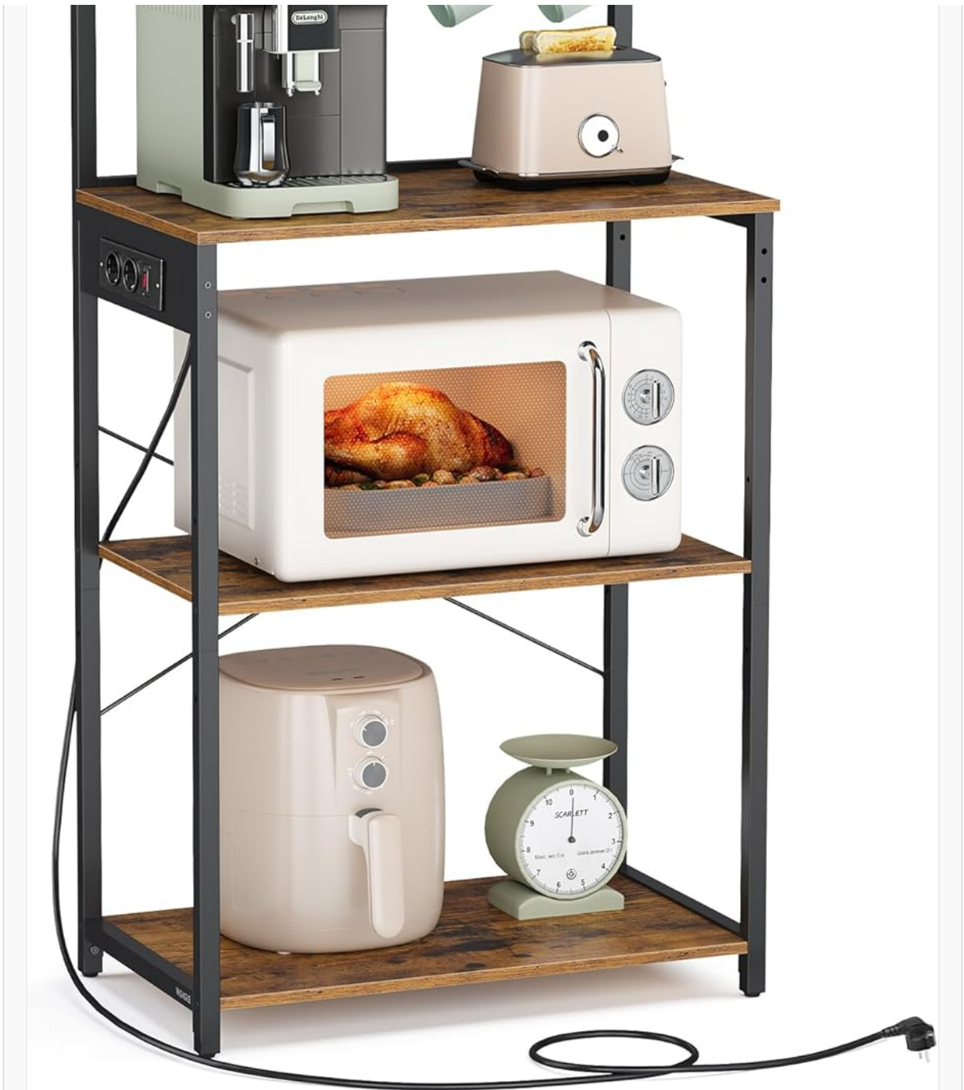
Figure 1: Fully assembled VASAGLE KKS014K02 Kitchen Shelf in a kitchen environment.