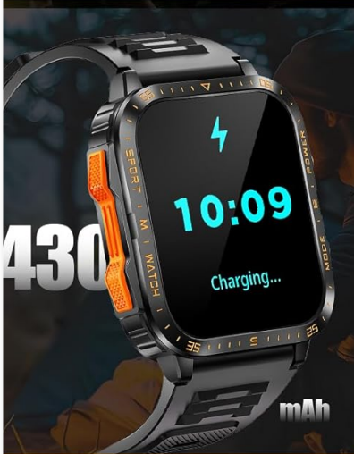
430 mAh Battery