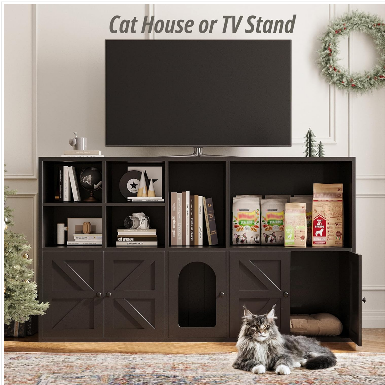
Figure 2.5: Shows the versatility of the enclosure, functioning as a TV stand with ample storage.