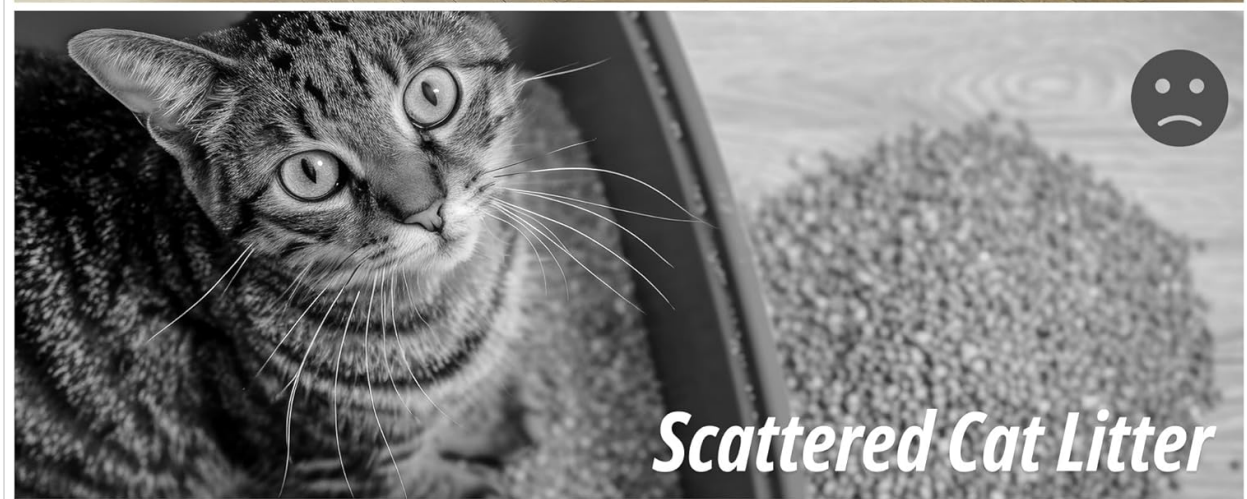
Figure 2.4: Demonstrates how the enclosure conceals the litter box and reduces scattered litter.