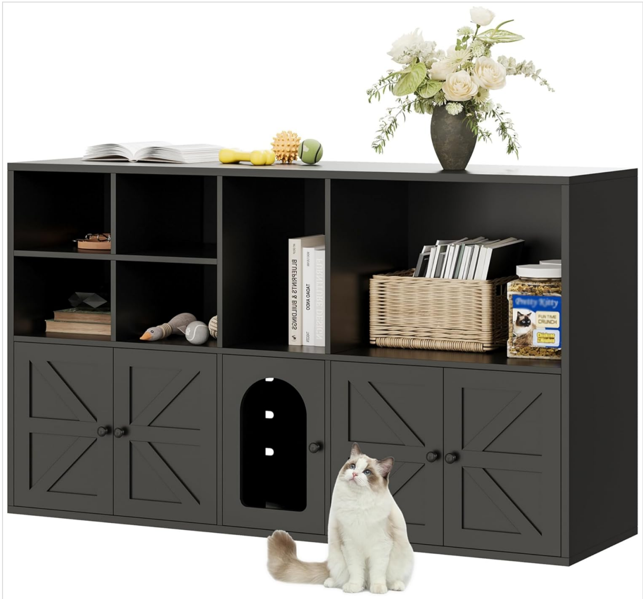
Figure 2.1: Overall view of the IRONCK Cat Litter Box Enclosure, showcasing its design and how it integrates into a living space.