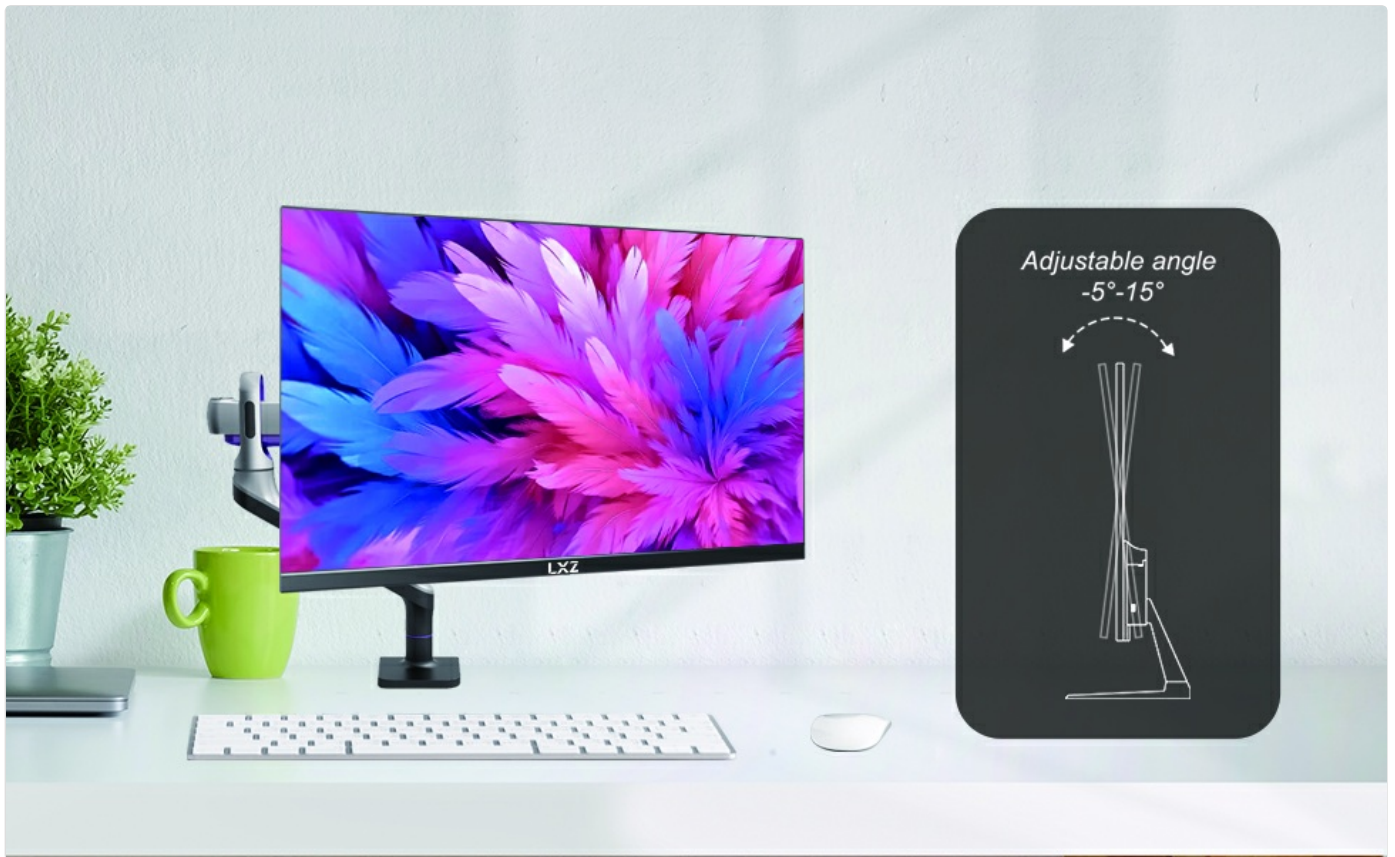
Figure 4: Key Gaming Features Overview