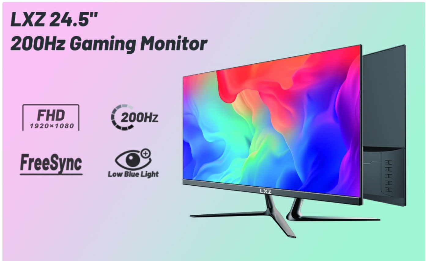
Figure 2: FHD 1080P Resolution Clarity

experience with 8-bit color depth, 16.7 million colors, a 100000:1 contrast ratio, and 99% sRGB coverage.