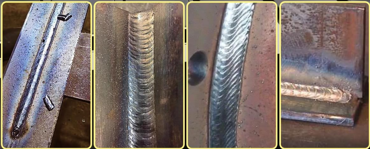
Figure 6.2: Real Welding Results. This image displays examples of clean and consistent weld beads produced by the machine.