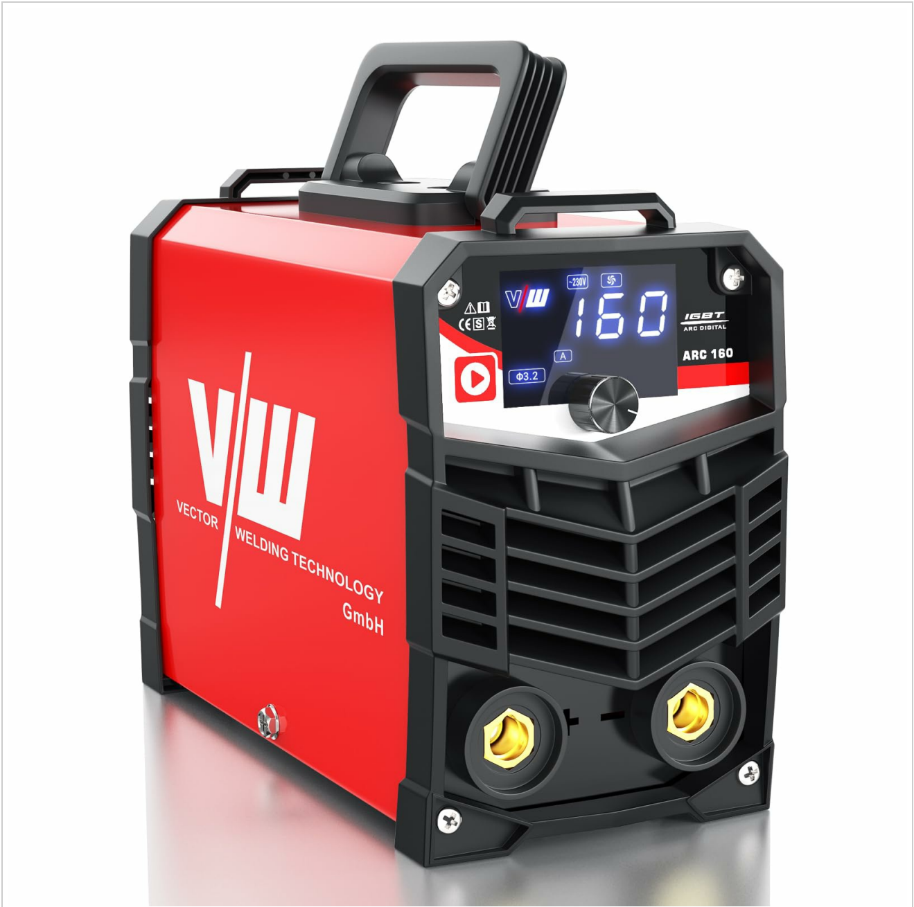
Figure 5.1: Welder with Cables Connected. This image shows the general setup of the welding machine with the ground clamp and electrode holder cables attached.