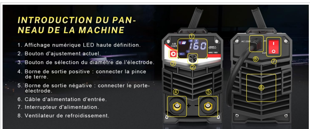
Figure 4.2: Machine Panel Introduction. This image highlights the high-definition LED digital display, current adjustment knob, electrode diameter selection button, positive output terminal (for ground clamp), negative output terminal (for electrode holder), input power cable, power switch, and cooling fan.