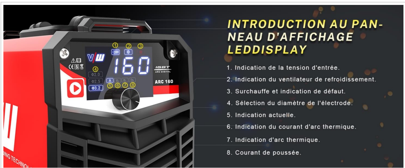
Figure 4.1: LED Display Panel Introduction. This image shows the various indicators on the display, including input voltage, cooling fan status, overheat/fault indication, electrode diameter selection, current indication, thermal arc current, and thrust current.