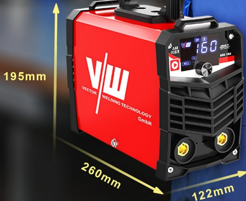
Figure 4.3: Portable Design. The welder weighs 3.2 kg and features a convenient carrying handle, making it easy to transport. Dimensions are approximately 260mm (length) x 122mm (width) x 195mm (height).