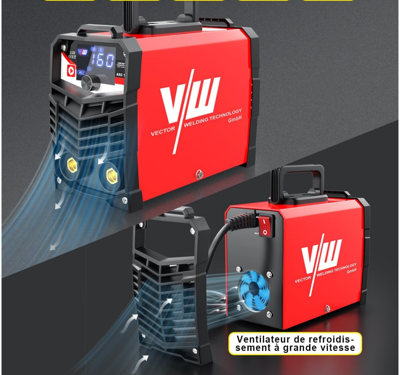
Figure 2.1: Enhanced Safety Features and Cooling System. The welder is IP23 certified for protection against dust and splashing water. Multi-channel cooling reduces temperature efficiently.