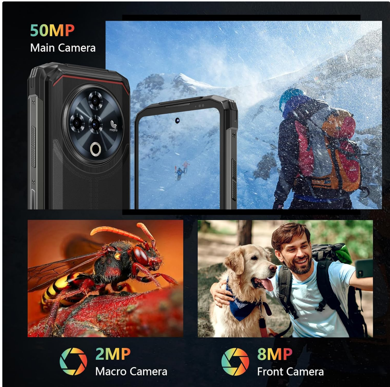
Figure 8: Overview of the phone's camera system, including the 50MP main, 8MP front, and 2MP macro lenses.

The camera app includes features like audio note, beauty mode, watermark, filter options, composition lines, smile shutter, and AI scene recognition to enhance your photography experience.