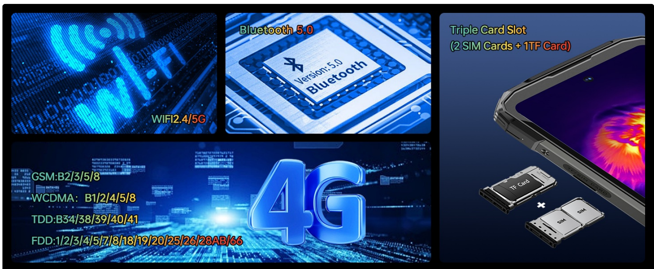
Figure 2: Illustration of the triple card slot for two SIM cards and one TF card.