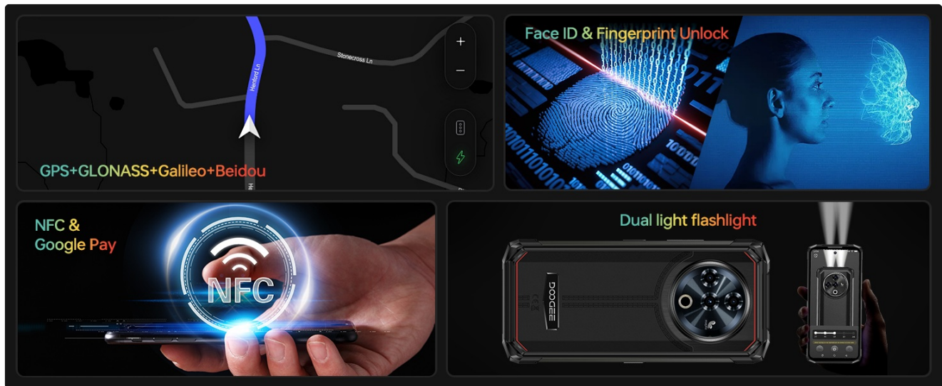
Figure 5: Visual representation of the Face ID and side fingerprint unlock functionalities.