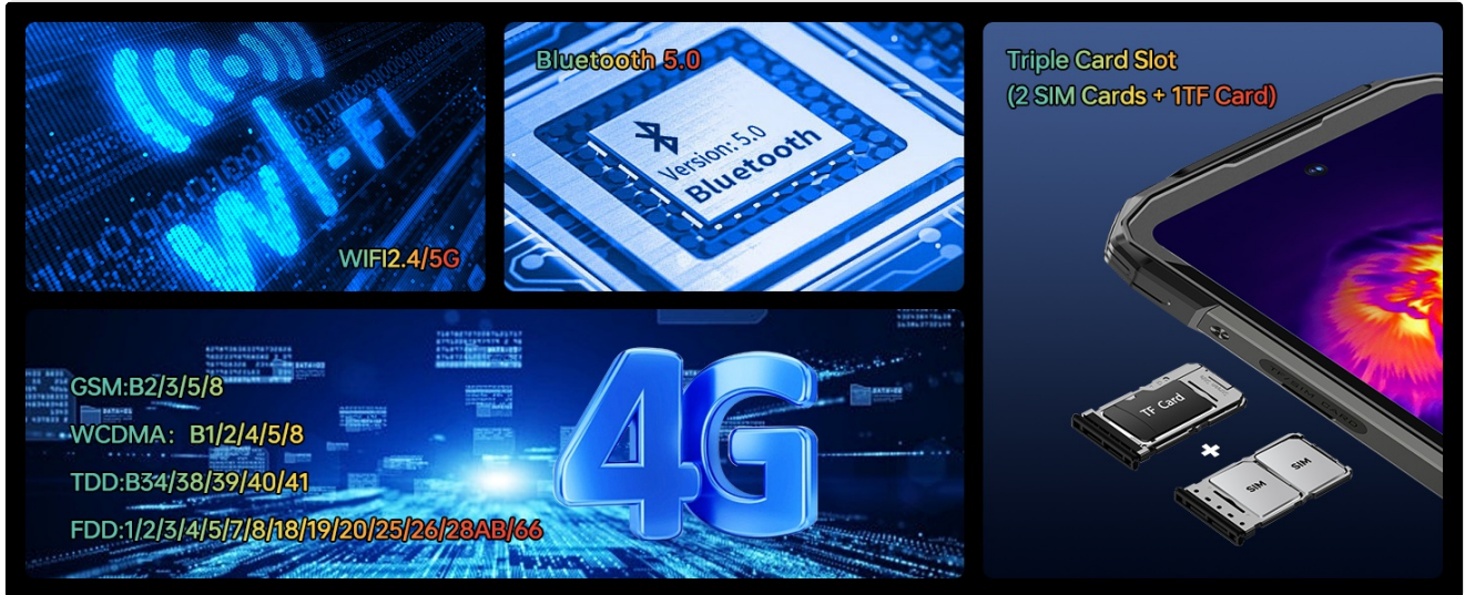
Figure 12: An illustration of the phone's comprehensive connectivity features, including Wi-Fi, Bluetooth, 4G, and the triple card slot.