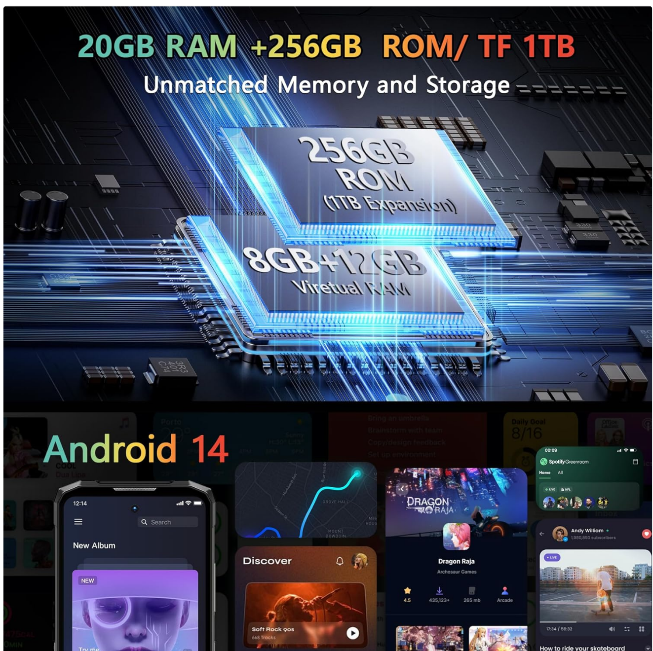
Figure 11: Visual representation of the 20GB RAM and 256GB ROM, with an emphasis on 1TB TF card expandability.