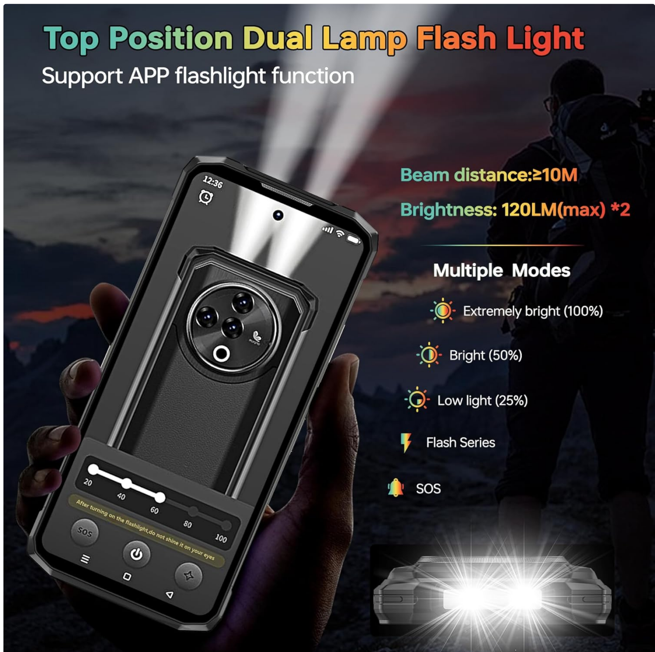
Figure 9: The powerful top-mounted dual lamp flashlight in action, illustrating its various modes and brightness levels.

The phone is equipped with a powerful 120LM top-mounted dual lamp flashlight, providing strong illumination for various situations. It can be controlled via a customized key and an APP function.