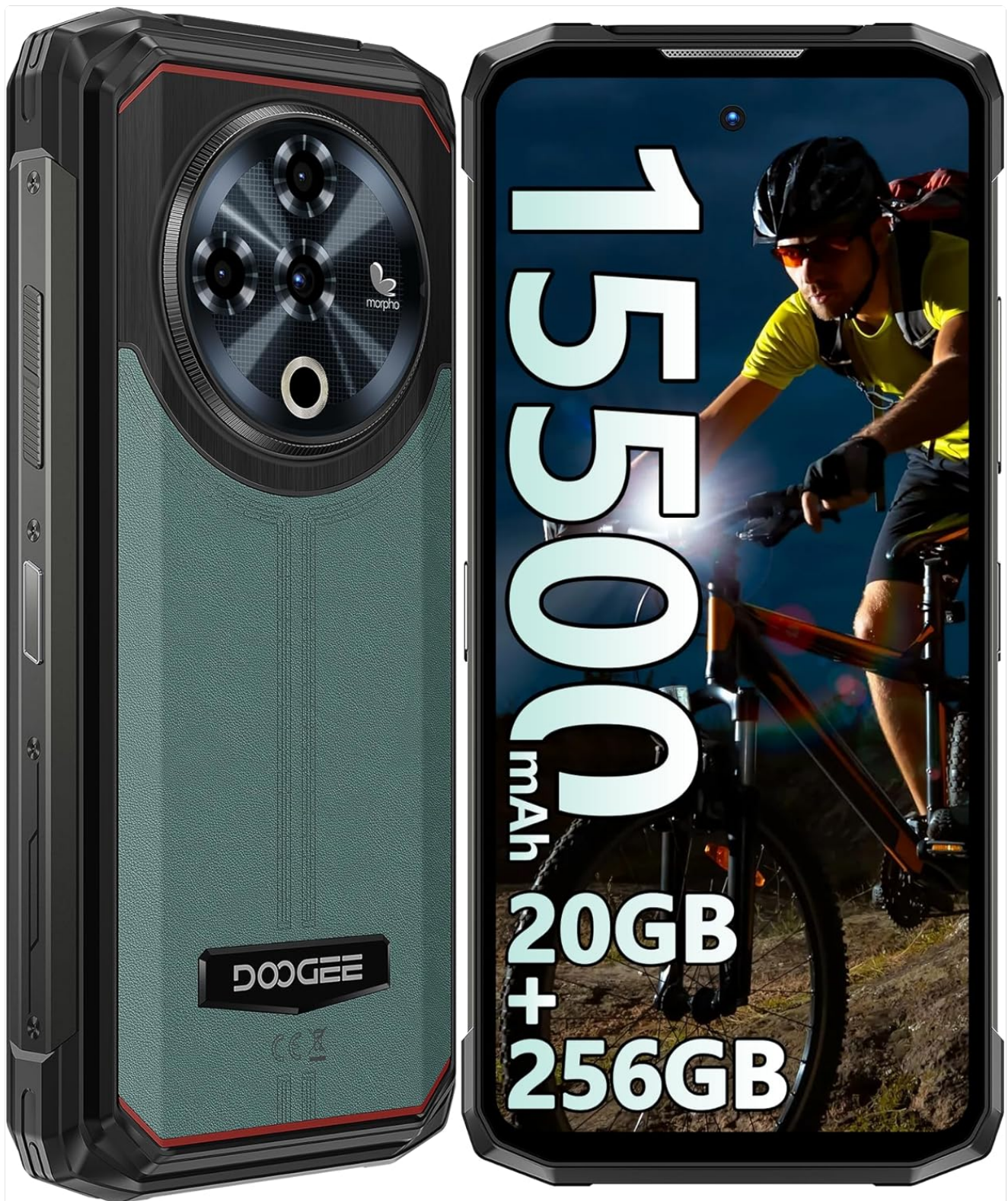
Figure 1: Front and rear view of the DOOGEE Fire 6 Power Rugged Phone, highlighting its robust design and large display.

This device is IP68/IP69K certified for water and dust resistance and meets MIL-STD-810H standards for shockproof durability, making it an ideal companion for outdoor adventures and demanding work conditions.