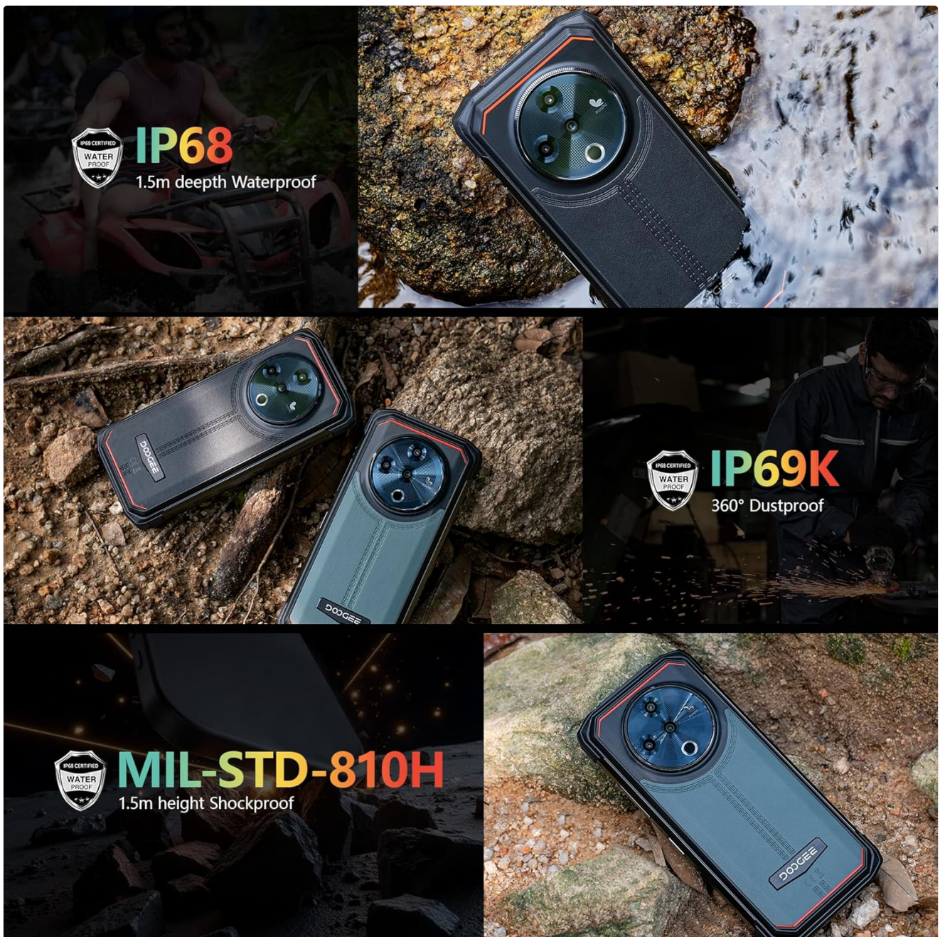
Figure 13: The phone demonstrating its IP68 waterproof, IP69K dustproof, and MIL-STD-810H shockproof capabilities in various environments.

To maintain the phone's ruggedness, ensure all port covers are securely closed before exposing the device to water or dust. Avoid intentional drops or extreme impacts beyond the certified limits.