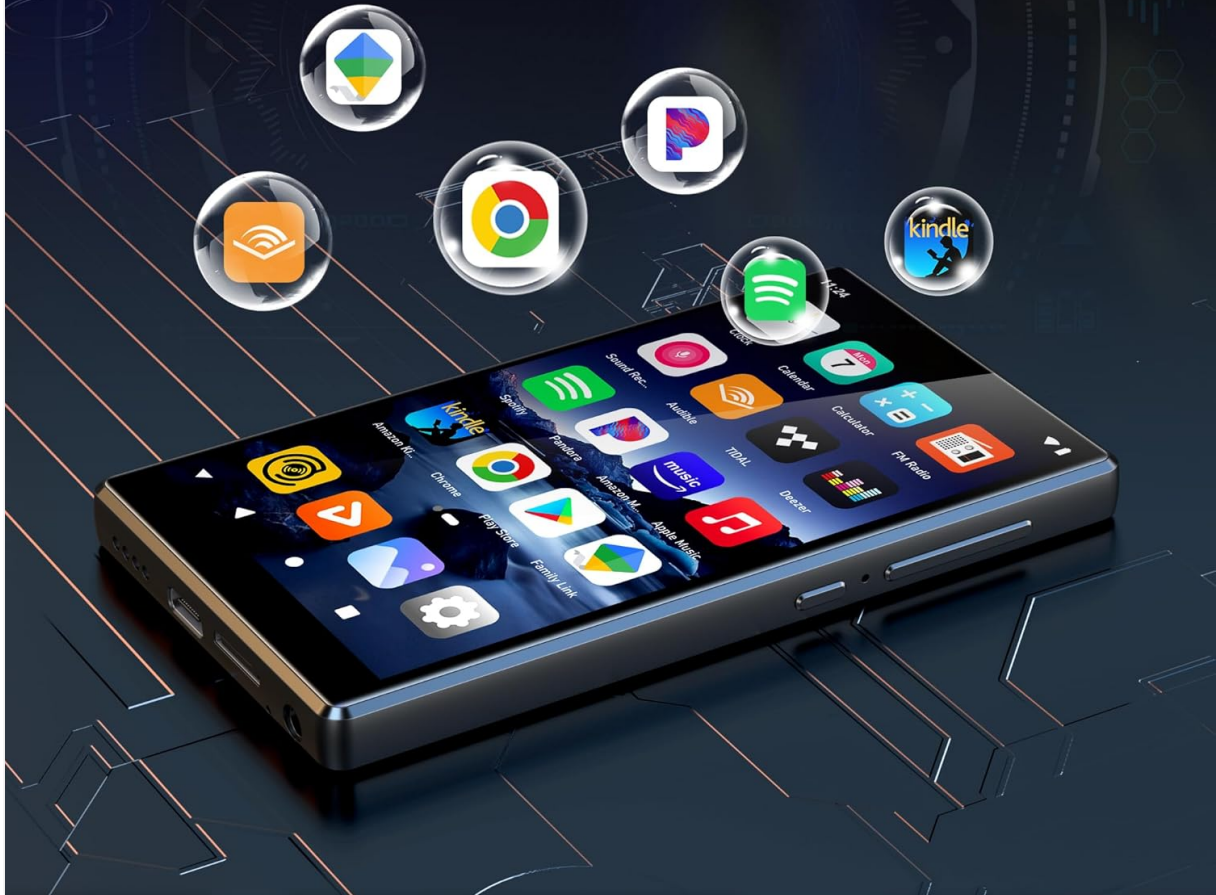
Image: Front view of the SWOFY D26 MP3 Player.

Support downloading other applications (or uninstall)