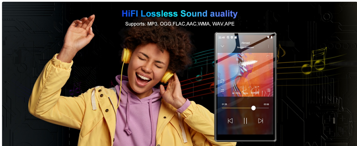
Image: Enjoying music with the SWOFY D26 MP3 Player.