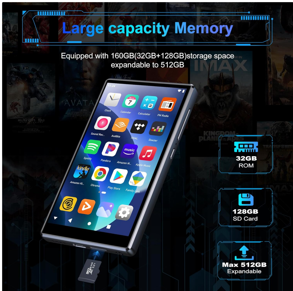
Image: Inserting an SD card for memory expansion.